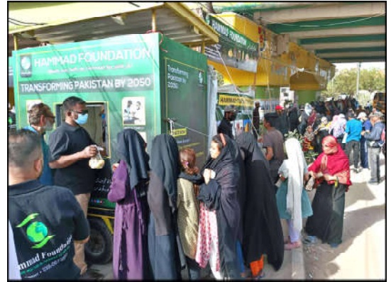
KARACHI: A large number of women in queue to get fruits and vegetables for just Rs.10 per Kg in Ramadan-ur-Mubarak organized by Hammad Foundation Pakistan camp at Hasan Square area.