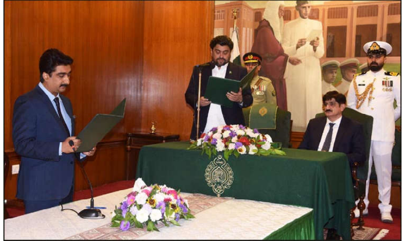
KARACHI: Governor Sindh Kamran Khan Tessori taking oath from Syed Zulfiqar Ali Shah as a Provincial Minister. Chief Minister Sindh Syed Murad Ali Shah is also present.

The CM directed the food department to procure 100,000 bags/ bardana and mobilise food department teams to start procurement of the wheat at the earliest. Commissioner Karachi Saleem Rajput briefed the cabinet on the initiative taken to control prices of edible items, particularly during the holy month of Ramzan, said that the district administration was conducting raids to control prices. The district administration from March 6, 2024, onwards conducted 1500 raids, registered 1,150 cases, sealed 14 shops, and recovered Rs7.14 million fine. The chief minister directed his cabinet members to start conducting surprise visits to the markets to control the prices.