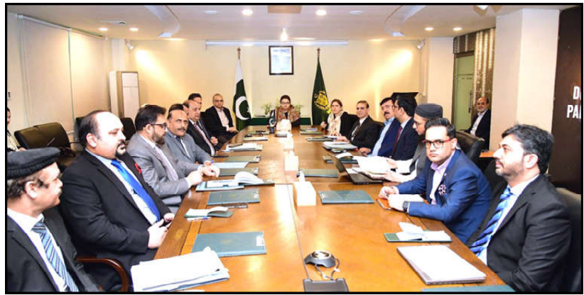
ISLAMABAD: Minister of State for IT and Telecommunication, Shaza Fatima Khawaja chairing a briefing on the working and projects of Ministry of IT & Telecom.