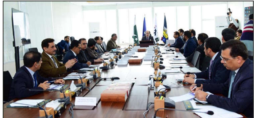
Federal Minister for Finance & Revenue Mr. Muhammad Aurangzeb chairing a meeting during his visit to FBR Headquarters.

ISLAMABAD (APP): The per tola price of 24 karat gold in the local market decreased by Rs.1,800 and was traded at Rs.228,300 on Wednesday as against its sale at Rs.230,100 on the last trading day. The price of 10 grams 24 karat gold also decreased by Rs.1,544 to Rs.195,730 from Rs.197,274 whereas that 10 gram 22 karat gold decreased to Rs.179,420 from Rs.180,834, the All Sindh Sarafa Jewellers Association reported. The price of per tola and ten gram silver witnessed no change and was traded at Rs.2,600 and Rs.2,229.08 respectively.