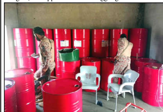
KARACHI: Rangers officials conduct raid in 3 different areas of Gadap and recovered illegal Iranian Oil, Cars and Mobile Phones in Karachi.

KARACHI (APP): Pakistan Rangers Sindh, along with police and customs intelligence, conducted a joint operation based on intelligence information. During the operation in areas connected to Gadap, Super Highway, they apprehended 14 suspects involved in Iranian oil smuggling at three different locations. According to the spokesperson of Sindh Rangers, the apprehended suspects were found in possession of 22,800 liters of Iranian diesel, 6 smuggling units, 6 tanks, cash amounting to approximately Rs 0.5 million, and 17 mobile phones. Additionally, 5 trucks and 2 cars used in the smuggling operation were also seized. Pakistan Rangers Sindh has vowed to continue the operation until the complete eradication of smuggling activities.