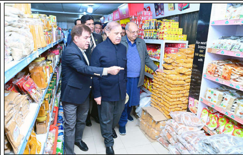
ISLAMABAD: Prime Minister Muhammad Shehbaz Sharif visits various special distribution points of Utility Stores Corporation set up with regard to PM's Ramzan Relief 2024.

The prime minister said he had appointed several teams that would pay surprise visits to various USC outlets to check the availability and quality of the food items adding that strict action would be taken against those involved in selling low quality items at the stores.