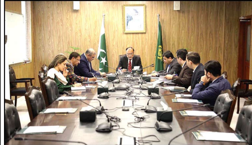
ISLAMABAD: Federal Minister for Planning Development & Special Initiatives Professor Ahsan Iqbal chaired a meeting to bring major reforms in Planning Commission on March 13. The meeting was attended by the Secretary Planning Ministry and Members Planning Commission.

tive tone and focus on addressing public and provincial concerns. Addressing a joint press conference with federal Minister for Planning Ahsan Iqbal and federal Minister for States and Frontier Regions (SAFRON) Amir Muqam, Gandapur emphasized the importance of cooperation between the federal and the provincial governments in delivering solutions to a number of pressing issues. Following is a recap of the significant discussions and outcomes of the meeting. Chief Minister Gandapur underscored the constructive dialogue with PM Shehbaz Sharif, emphasizing their discussions on matters ranging from law and order to public welfare. The CM lauded the PM's commitment in providing full support and fulfilling promises made, signaling a collaborative approach to ensure good-governance.