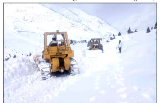
ASTORE: Heavy machinery being used to remove snow and boulders from the blocked road of Astore Valley by the staffer of Gilgit-Baltistan Disaster Management authority and Works Department after heavy snow fall and rain in area caused land sliding in diffident area.