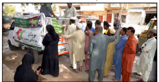
HYDERABAD: People purchase flour bags on subsidize rates from vehicle of Prime Minister program at Latifabad.