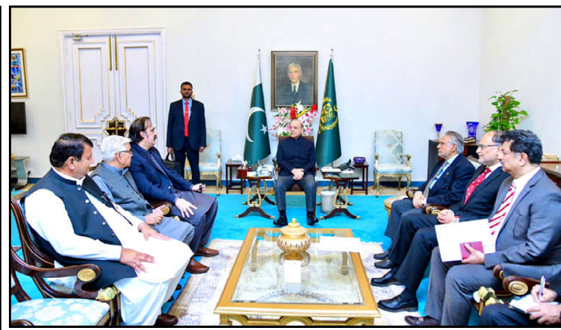
ISLAMABAD: Chief Minister Khyber Pakhtunkhwa, Ali Amin Khan Gandapur calls on Prime Minister Muhammad Shehbaz Sharif.

ISLAMABAD (APP): An earthquake of 5.3 magnitude on the Richter scale jolted various parts of the country on Wednesday. According to a private news channel, the National Seismic Monitoring Centre (NSMC) confirmed that tremors were felt in various parts of Khyber Pakhtunkhwa, the federal capital, and the adjoining areas. Earthquake tremors occurred in the Upper and Lower Dir, Mohmand, Buner, Orakzai and Abbottabad areas of KP. Earthquake tremors also occurred in Islamabad and Rawalpindi. According to NSMC Islamabad, the epicenter was in the Hindu Kush region, and the depth was 130 km. As of now, there have been no reports of loss of life or damage to property.