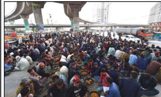
KARACHI: People sit and wait for iftar to break their fast during holy month of Ramadan.

RAWALPINDI (INP): Slamming the 2024 national general election once again, incarcerated Pakistan Tehreek-e-Insaf (PTI) founding chairman Imran Khan has predicted Sri Lanka-like situation in the country as the nation's hopes were shattered by "stealing the mandate". "My all predictions have proven true," the former prime minister said during an informal interaction with journalists in Rawalpindi's Adiala Jail, in which he reiterated that he was not engaging into talks with the current rulers to reach a "deal". "Each and everything is based on lies [...] like the election was a lie [...] the security threat was also a lie," the cricketer-turned-politico said, adding that the PTI was deliberately kept away from the 2024 polls. Khan, the deposed premier who was removed from power via a parliamentary vote in April 2022, said that the voters took revenge on the polling day but the "change via vote was not accepted". He added that the former ruling party would continue its peaceful protests against the rigging bests approaching the Supreme Court (SC).