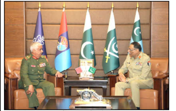
RAWALPINDI: General Sheikh Mohammed Bin Isa Bin Salman Al Khalifa, Commander Bahrain National Guard, called on General Sahir Shamshad Mirza, Chairman Joint Chiefs of Staff Committee, at Joint Staff Headquarters.