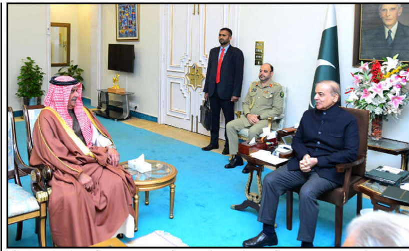
ISLAMABAD: Commander of Bahrain National Guard calls on Prime Minister Muhammad Shehbaz Sharif.

markable achievement," he added. Pakistan should replicate this model in the country to alleviate poverty, provide jobs to the youth, and encourage small and medium entrepreneurs to kickstart businesses in villages, towns and cities in sectors of agriculture, industry, information technology and on other platforms, the prime minister said. Citing Pakistan as one of the first batch of countries joining the Group of Friends of the Global Development Initiative (GDI), PM Sharif said that Pakistan fully and firmly supports China-proposed GDI and Global Security Initiative and believes the initiatives will further create strong connections between global communities. He commended the China-proposed Belt and Road Initiative (BRI) as a very visionary initiative, which spans continents and alleviates poverty and hunger in the countries, promotes investments, and boosts education and health.