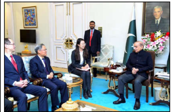
ISLAMABAD: Ambassador of the People's Republic of China Ambassador Jiang Zaidong calls on Prime Minister Muhammad Shehbaz Sharif.