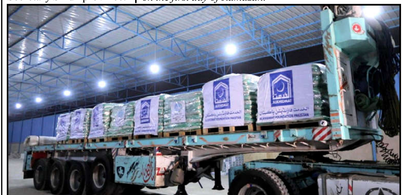
Ramzan Food Package for 15000 affected families is being dispatched to Gaza from Al-Khidmat Foundation.