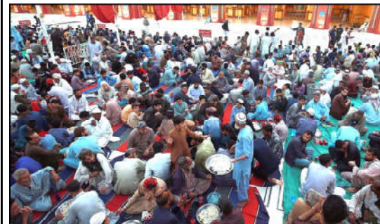
KARACHI: Faithfuls sit and wait for Iftar to break their fast during 1st holy month of Ramadan at Memon Masjid.