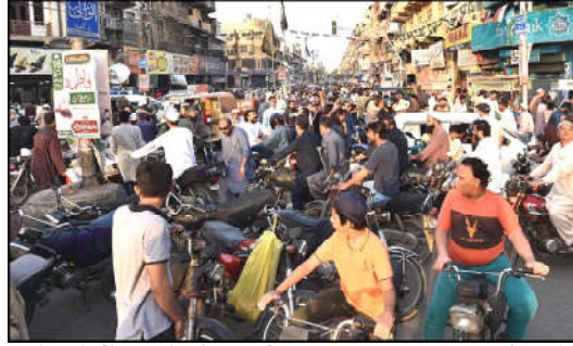
KARACHI: A view of rush on bazaar during 1st holy month of Ramadan.