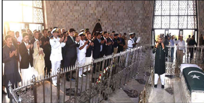
KARACHI: Sindh Chief Minister, Syed Murad Ali Shah along with his newly appointed provincial cabinet members of Sindh are offering Fataha on the grave of Quaid-e-Azam Muhammad Ali Jinnah during their visit to Mazar-e-Quaid in Karachi.