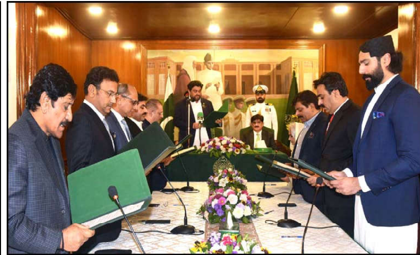
KARACHI: Sindh Governor, Kamran Tessori administering oath to provincial cabinet members of Sindh during oath taking ceremony held at Governor House in Karachi.