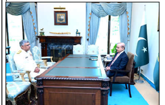
ISLAMABAD: Chief of Naval Staff, Admiral Naveed Ashraf calls on Prime Minister Muhammad Shehbaz Sharif.

Earlier, on his arrival at the mausoleum of Quaid-e-Azam Muhammad Ali Jinnah, a smartly turned out contingent of cadets from the Pakistan Military Academy, Kakul presented guard of honour to the President Asif Ali Zardari.