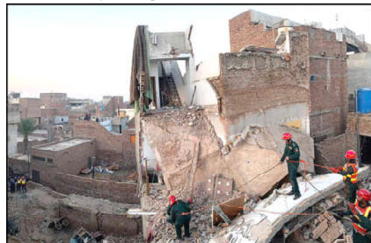
MULTAN: Rescue-1122 workers performing rescue operation at the cylinder gas blast spot in Mohala Jawadia near Haram Gate.

According to sources, home department Punjab has directed to conduct search operation on March 13 inside jail through special branch.