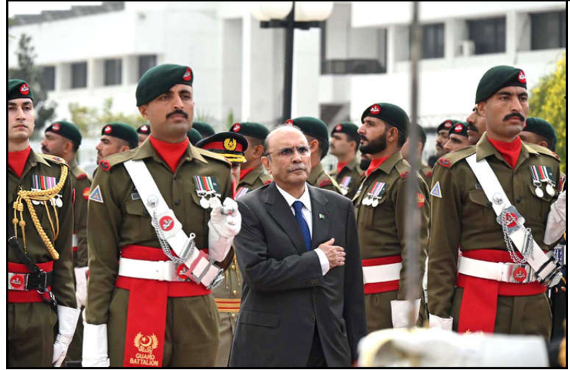
ISLAMABAD: President Asif Ali Zardari inspecting the Guard of Honour, at Aiwan-e-Sadr.