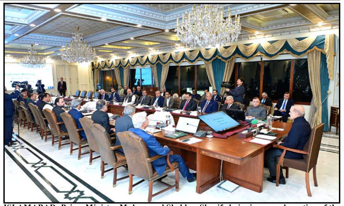
ISLAMABAD: Prime Minister Muhammad Shehbaz Sharif chairs inaugural meeting of the Federal Cabinet.

by maintaining piety with regular praying and obeying which helped them to earn blessings and absolve them of their sins. He also referred to the Quranic verses which had explained the reasons behind keeping fasts which also saved a faithful from falsehood, use of foul language, cheating, hoarding, adulteration in food stuff and other sins. The president also prayed for the progress and prosperity of the country.