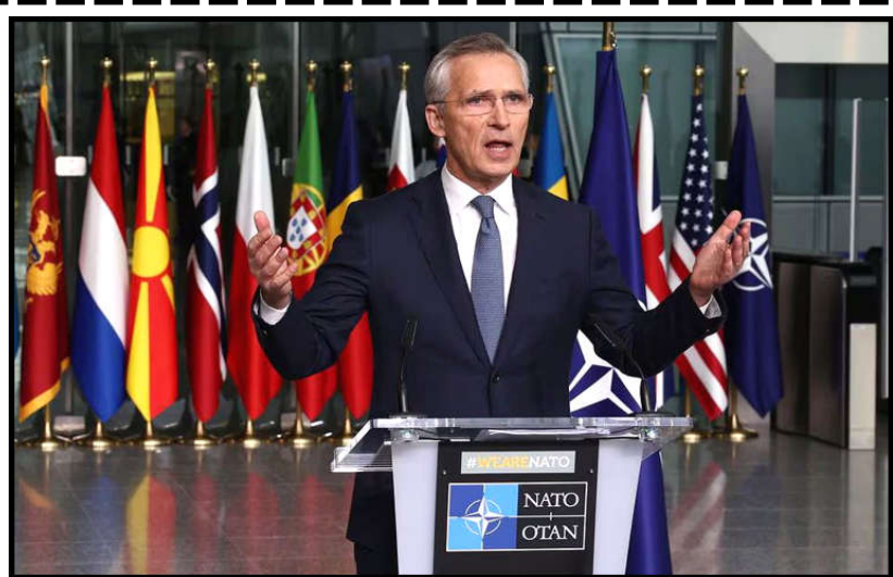
NATO Secretary General Jens Stoltenberg gestures as he attends a press conference on the day of a flag-raising ceremony at NATO headquarters following the accession of Sweden to the alliance, in Brussels, Belgium.

Monitoring Desk LONDON: Thousands of Russians braved the cold for hours earlier this month to honor the opposition politician Alexei Navalny after his funeral. They chanted anti-war slogans and covered his grave with so many flowers that it disappeared from view. It was one of the largest displays of defiance against President Vladimir Putin since he invaded Ukraine, and happened just weeks before an election he is all but assured to win. But Russians watching television saw none of it. A leading state television channel opened with its host railing against the West and NATO. Another channel led with a segment extolling the virtues of domestically built streetcars. And there was the usual deferential coverage of Putin. Since coming to power almost 25 years ago, Putin has eliminated nearly all independent media and opposition voices in Russia — a process he ramped up after the 2022 invasion of Ukraine. The Kremlin's control over media is now absolute. President Vladimir Putin has no doubt he will secure another term in Russia's election. The vote that leaves him in suspense, and could do more to change his policies, will occur eight months later in the United States. Putin has publicly said he prefers US President Joe