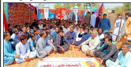
KARACHI: Activists of Pasban Democratic Party (PDP) are holding protest demonstration against prolong sui-gas load shedding in city, held at Lea Market area in Karachi.