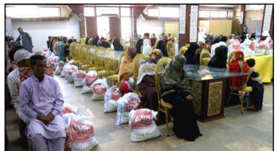
KARACHI: People sit near their ration bags given by UMR United Mission by Relief Development during a ceremony of Holy month of Ramadan.