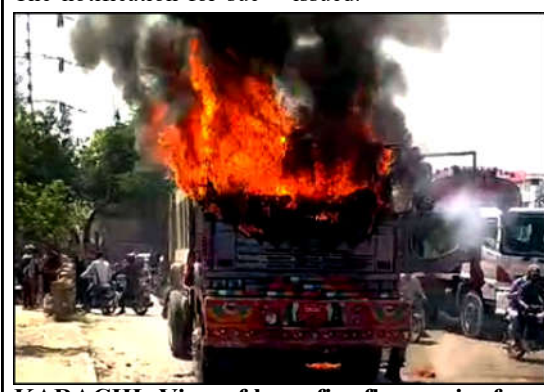
KARACHI: View of huge fire flames rise from burning vehicle after traffic accident, at North Karachi Power House roundabout in Karachi.