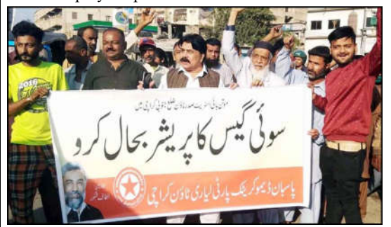
KARACHI: Activists of Pasban Democratic Party (PDP) are holding protest demonstration against prolong sui-gas load shedding in city, held at Lea Market area in Karachi.