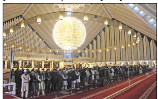
People offering Namaz-e-Taraweeh of first ramadan at Faisal Mosque in the Federal Capital.

ISLAMABAD (Online): Time schedule of National Assembly (NA) session to be held on March 13 has been changed. According to notification issued by NA Secretariat the NA session on March 13 will commence from 4 p.m instead of 2 p.m.