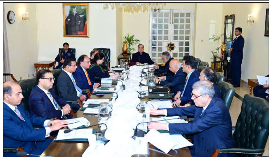
ISLAMABAD: Prime Minister Muhammad Shehbaz Sharif chairs a meeting regarding petroleum sector in Federal Capital.

Firstly, Yan suggested to promote China-Pakistan joint energy exploration and development cooperation.