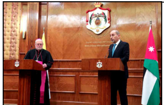
Jordan's Foreign Minister Ayman Safadi speaks during a joint press conference with Archbishop Paul Richard Gallagher, the Vatican Secretary for Relations with States, in Amman, Jordan.