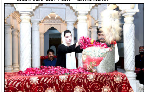
LARKANA: BiBi Aseefa Bhutto Zardari showering flowers on the grave of Shaheed Zulfiqar Ali Bhutto at Garhi Khuda Bakhsh.

ISLAMABAD (APP): Pakistan People Party (PPP) senior leader Qamar Zaman Kaira said on Monday that political consultation and dialogue were essential components of the PPP's ideology. Speaking to a private news channel, Kaira underscored the importance of negotiations and communication among political parties to mitigate polarization among the public. Kaira said that while elections have concluded, it is now imperative for politicians to move forward and focus on the country's betterment. He said that collective decision-making and reconciliation efforts will be upheld by the President's House. While acknowledging that criticism is integral to democracy, Kaira condemned the exacerbation of internal rifts to foment political unrest.