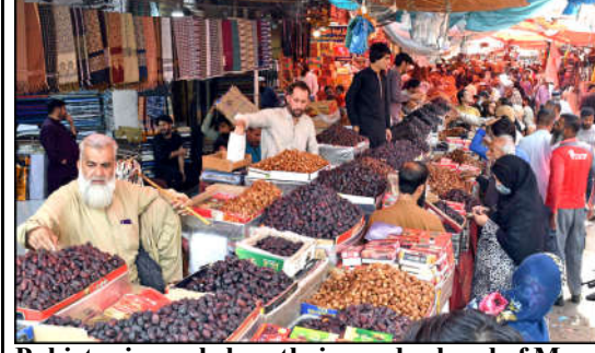
Pakistani people buy their needs ahead of Muslims' holy month of Ramadan at shopping centers, in which are crowded due to Ramadan preparations in Karachi.