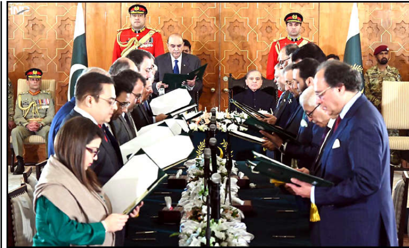
ISLAMABAD: President Asif Ali Zardari administering oath of office to members of Federal Cabinet at Aiwan-e-Sadr. Prime Minister Muhammad Shehbaz Sharif was also present on the occasion.

choices; either to sit as silent spectators or be counted, at that time they had decided to take responsibility of the country. Then the interim government followed them but the economic situation in the country was stable and did not worsen, he opined. The prime minister said that once more, they took the responsibility of steering the country out of the huge challenges and without wasting time, they should tread upon that path leading to destination. Felicitating the nation on the arrival of Ramazan, he said that about Rs12 billion Ramazan Package was being initiated under which the edible items at the Utility Stores and mobile utility stores would be provided to the poor and deserving.