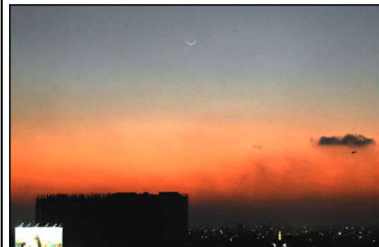
KARACHI: An eye-catching view of the first crescent moon of Ramzan ul Mubarak sighting on the horizon.

Assad with an onboard crew of 45 capsized in open sea off Hajmro creek on March 5th due to inclement weather. Search operation involved multiple assets of PN and PMSA including aircraft, helicopters, ships and speed boats. Major break through of search efforts materialised today when PMSS REHMAT upon receipt of information from deployed units recovered 10 dead bodies of missing fishermen. The recovered bodies have been handed over to concerned civil authorities for further formalities.