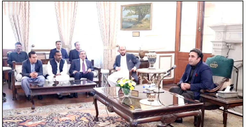
LAHORE: Chairman PPP Bilawal Bhutto Zardari presides over the Punjab Parliamentary Party meeting at Governor House Lahore.