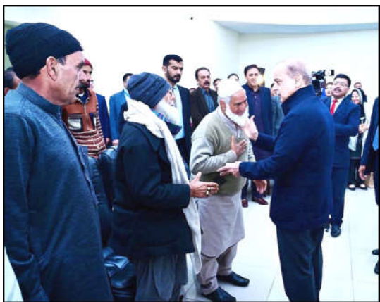
MUZAFFARABAD: Prime Minister Muhammad Shehbaz Sharif interacting with the families of the deceased and injured in the wake of recent torrential rains and heavy snowfall.

ISLAMABAD: President Dr Arif Alvi being presented with the farewell Guard of Honour, at Awaran-e-Sadr.