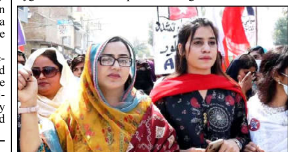
LARKANA: A large number of Women participating in "Aurat Azadi March" rally on the occasion of Women's International Day organized by Joint Action Committee Sindh, in Larkana.

Improvement notices were also given to the management of the cafeterias. On the occasion of the inspection, the DG SFA also warned the management of cafeterias to improve the sanitation situation. Meanwhile, the team of SFA also destroyed the expired items from the warehouse in Korangi. It should be noted that a large number of expired juice boxes and mineral water bottles were recovered from a warehouse in Korangi.