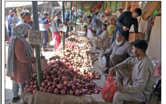
ISLAMABAD: People are busy buying vegetables in Friday Weekly Bazaar.

"SBP considers it imperative to support the career progression of the women employees and encourage them to aim for leadership position with the hope that in the coming years women in leadership position should become the norm, not the exception".