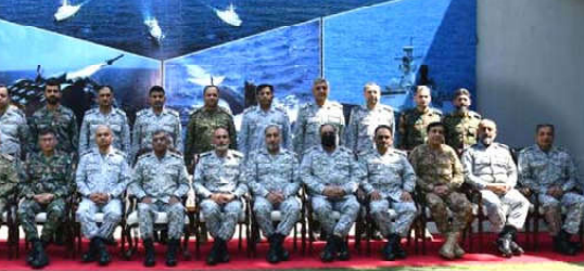
KARACHI: Chief of the Naval Staff, Admiral Naveed Ashraf in a group photo along with Tri-Services Officers during the closing session of exercise SEASPARK 2024, in Karachi.

Exercise SEASPARK-2024 was aimed to assess combat readiness and operational preparedness of Pakistan Navy to meet the entire spectrum of National Security Challenges in the Maritime Domain.