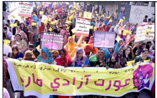
HYDERABAD: Large number of women participating in a rally in connection of International Women's Day at Thandi Sarak.