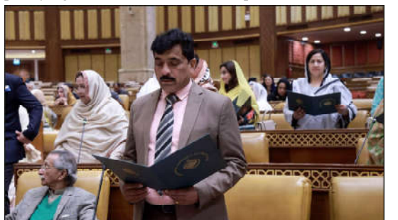
LAHORE: MPAs elected on minority special seats taking oath during Punjab Assembly Session.

She urged that parents should take their children into confidence so that they could tell them whenever they are subjected to harassment outside. Girls should be made powerful.