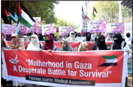
KARACHI: Women supporters of the Jamaat-Islami holds banner to stage a Pro-Palestinian demonstration on the eve of International Women's Rights Day, in the Provincial Capital.

He said tax evasion was one of the biggest challenge that would be resolved to increase the country's resources.