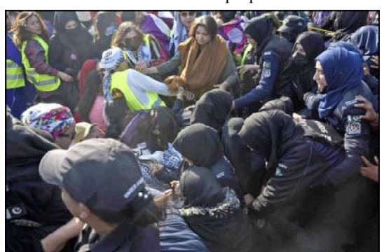
ISLAMABAD: Women activists scuffle with police personnel during Aurat March, a demonstration rally, to mark the International Women's Day, in the Federal Capital.