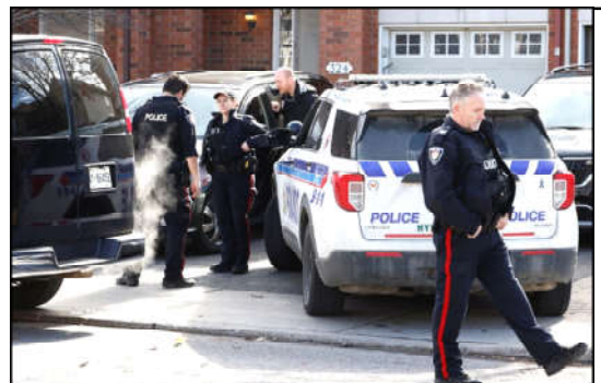
Ottawa Police Service officers surround a home after four children and two adults were found dead inside a neighbouring house in the Ottawa suburb of Barrhaven, Ontario, Canada.

Security forces did not arrive at the scene until several hours later, locals said, prompting concerns from families and analysts that the gunmen might have gone deep into the forest with the children.