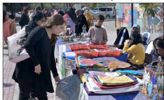
ISLAMABAD: Women visiting stalls at 10th National Women at Work commemorating International Women's Day organised by Lok Virsa with the collaboration of Devcom-Pakistan and dtn.

The seminar provided a platform for experts and stakeholders to explore the potential of Norwegian red cattle in enhancing genetic and domestic breed improvement in the dairy industry. PARC's institutions, the National Institute for Genomics and Advanced Biotechnology (NIGAB) and the Animal Sciences Institute (ASI).