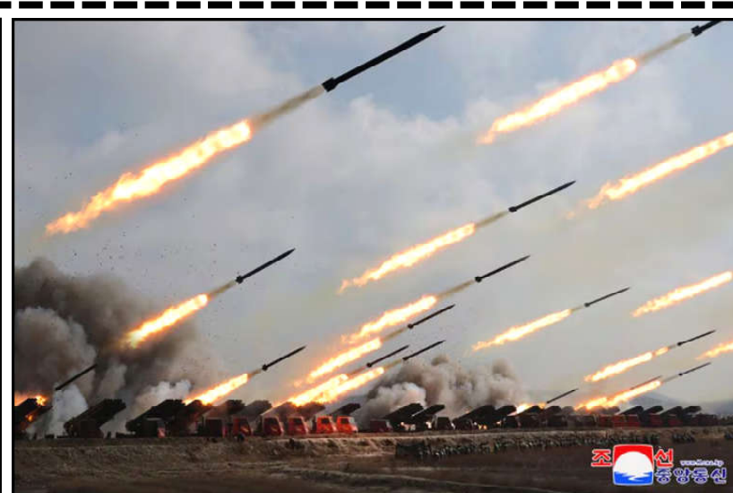
The Korean People's Army conducts an artillery firing drill, KCNA news agency reported, in North Korea in this picture released by the Korean Central News Agency.

Thursday's artillery drill was aimed at increasing combat readiness posture and actual war capability, KCNA said. Earlier this week, the North Korean state media said Kim inspected field training of troops at a major military operations base in the western region of the country.