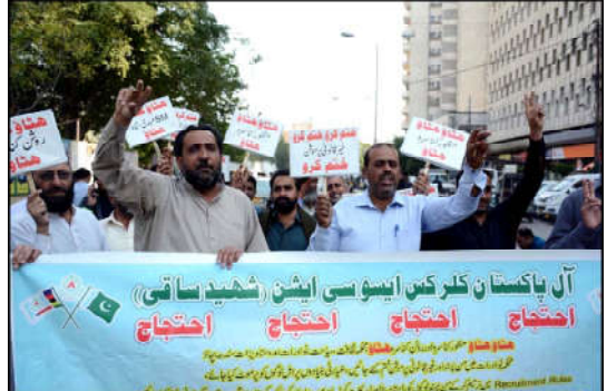
KARACHI: Members of All Pakistan Clerks Association are holding protest demonstration for acceptance of their demands, held at Karachi press club.

FPCCI Chief noted that technological advancements have changed the landscape of shipping and customs through digitalization; therefore, the need for upfront payments have also subsided globally. We demand customs department to look into the matter and provide relief to the business community of the liquidity blockages in these times where access to finance is severely restricted in Pakistan due to 22 percent key policy rate, he added.