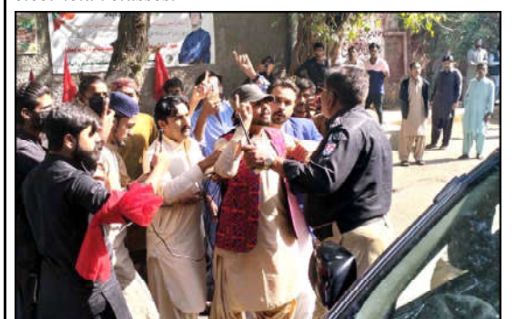
HYDERABAD: Police officials are restoring baton charge and arrest protesters during the protest demonstration of Jeay Sindh Mahaz for acceptance of their demands, at Hyderabad press club.