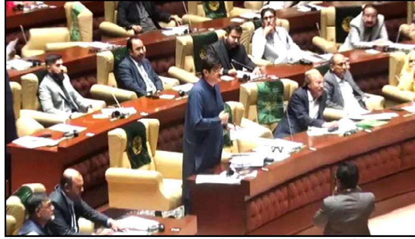
CM Murad Ali Shah tables the resolution to declare late PPP founder ZA Bhutto 'National Democratic Hero' in Sindh Assembly.