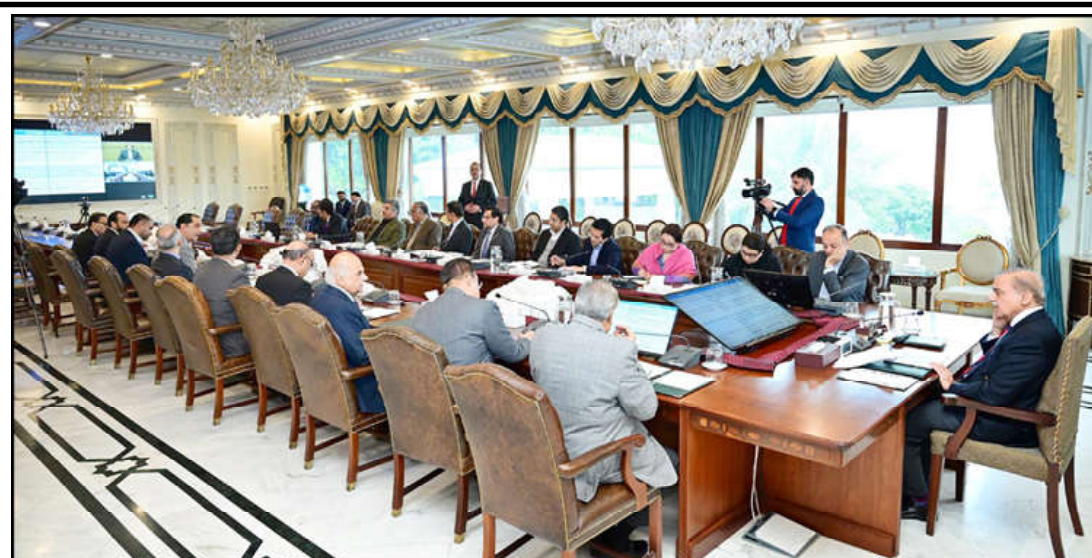
ISLAMABAD: Prime Minister Muhammad Shehbaz Sharif chairs a meeting on Privatisation of State Owned Enterprises.

He also stressed to ensure transparency of the privatisation process at the institutional level and to adopt effective international standards of its monitoring.