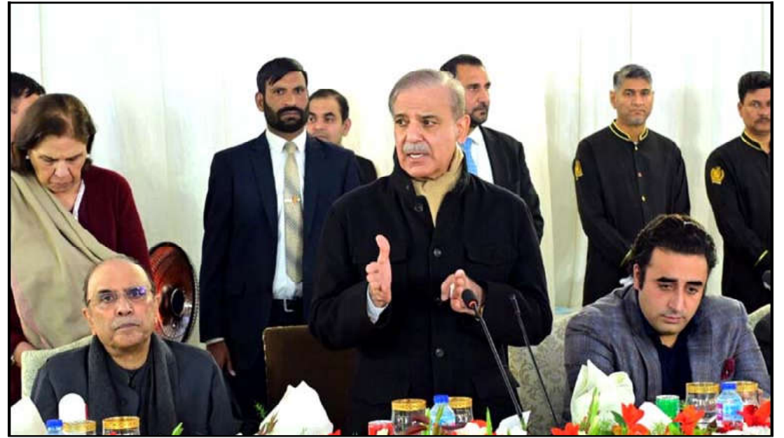
Prime Minister Muhammad Shehbaz Sharif addressing parliamentarians at a banquet in Islamabad.

The premier said Zardari will be elected as the president of the country in the next two to three days. PM Shehbaz said PML-N along with allied parties has secured a two-thirds majority in the National Assembly, noting that he respected the mandate of Pakistan Tehreek-e-Insaf (PTI)-backed independent candidates in Khyber Pakhtunkhwa.