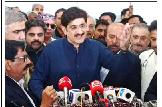
GARHI KHUDA BUX: Sindh Chief Minister, Murad Ali Shah along with others talks with media persons after showering rose petals and offer Fateha on the graves of Martyred Mohtarma Benazir Bhutto and Martyred Zulfikar Ali Bhutto held at Bhutto Mausoleum in Garhi Khuda Bux.

edible goods on lower rates. Under the Benazir Income Support Programme, 88 percent of the eligible families will be given 19 edible items including flour, rice, pulses, ghee, cooking oil, sugar, sherbet and milk on lower than market rates. The rate of subsidy on these goods would be 30 percent which was more than the inflation rate. Subsidy of Rs 77 per kilo would be given on the 20 kilogramme flour bag and Rs 70 subsidy on every kilogramme of ghee. The Prime Minister's Ramazan relief package would be distributed among the needy families through 4775 utility stores across the country and the supply would continue till the end of Ramazan.