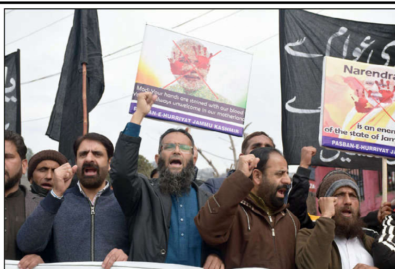
MUZAFFRABADA: Activists of Pasban-e-Hurriyat chanting slogans during protest at Azadi Chowk in the city, against Indian Prime Minister Narendra Modi visiting at Jammu and Kashmir's Srinagar.