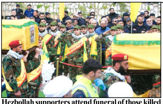
Hezbollah supporters attend funeral of those killed in Israeli bombardment.

STOCKHOLM (INP): After two centuries of non-alignment and two years of torturous diplomacy, Sweden on Thursday becomes the 32nd member of NATO, a major step for a country once careful not to anger Russia. Swedish Prime Minister Ulf Kristersson was visiting Washington where Secretary of State Antony Blinken will ceremonially receive the ratification documents after the hard-fought battle to secure the green lights needed from all NATO members. Kristersson is likely later in the day to attend the annual State of the Union address by President Joe Biden, who has been struggling to persuade the rival Republican Party to approve new aid to Ukraine. Sweden's blue and golden-yellow flag is expected to be hoisted on Monday at the Brussels headquarters of the North Atlantic Treaty Alliance. Russia has vowed "countermeasures" over Sweden's entry into NATO, especially if the alliance's troops and assets deploy in the country. Sweden and Finland, while both militarily intertwined with the United States and members of the European Union, have historically steered clear of officially joining NATO, formed in the Cold War to unite against the Soviet Union. Turning page on non-alignment - Sweden has not been involved in a war, including World War II, since the Napoleonic conflicts of the early 19th century.