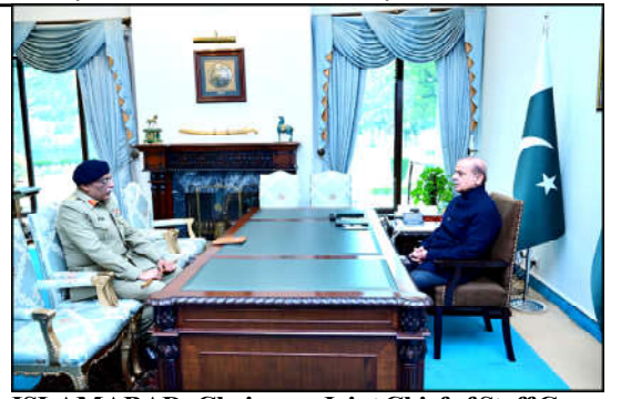
ISLAMABAD: Chairman Joint Chief of Staff Committee General Sahir Shamsah Mirza calls on Prime Minister Shehbaz Sharif.

ISLAMABAD (INP): Pakistan Peoples Party (PPP) on Thursday decided to invite party workers to Lahore on March 9 to celebrate the expected victory of PPP co-chairman Asif Zardari in Presidential elections against his rival Mehmoood Khan Achakzai.