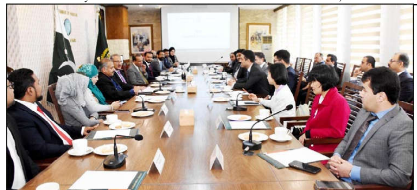
Ministry of Economic Affairs (MoEA) hosted the visit of the International Commercial Banking Course and the International Central Banking Course, alongside representatives from the National Institute of Banking and Finance (NIBAF) at Ministry of Economic Affairs, Islamabad.