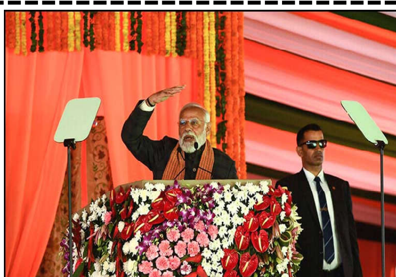
India's Prime Minister Narendra Modi speaks during a rally, as his bodyguard looks on at the Bakshi Stadium in Srinagar.

inaugurated a slew of development projects and government schemes for boosting agro-economy and tourism in Indian-occupied Kashmir and other parts of India. The projects included new infrastructure around the revered Muslim shrine of Hazratbal in the city. The visit comes ahead of India's national elections due by May, the first since the region lost its autonomy. The last local elections in Indian-occupied Kashmir were held in 2014. Modi's government claims New Delhi's direct rule of Indian-occupied Kashmir brought about a new era of "peace and development", but critics and many residents say it heralded a drastic curtailment of civil liberties and press freedom.