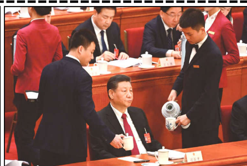
BEIJING: Workers replenish Chinese President Xi Jinping's teacups during the opening session of the National People's Congress at the Great Hall of the People.

Commercial surveillance tools "increasingly present a security risk to the United States and our citizens," said Treasury Under Secretary for terrorism and financial intelligence Brian Nelson. In particular, the Intellexa Consortium was founded in 2019 and served as a "marketing label" for companies offering commercial spyware and surveillance tools. The tools, the Treasury Department said, are packaged as a suite under the brand-name "Predator" spyware, able to infiltrate devices without user interaction.