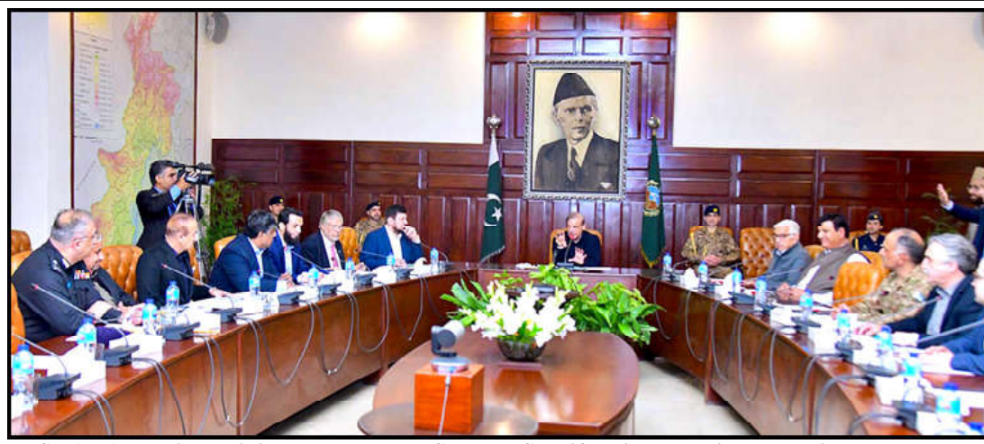
PESHAWAR: Prime Minister Muhammad Shehbaz Sharif chairs a meeting regarding recent torrential rains and heavy snowfall and the ongoing rescue and relief activities for the affecteds.

The Pakistan Peoples Party (PPP) holds 73 seats including 54 general seats, 16 women and another three reserved seats for minorities. Followed by the Mutahida Quami Movement (MQM) with 22 seats, including 17 general seats and five reserved seats — four women and one minority. Furthermore, the PML-Q has obtained five seats including three general, one independent and one seat reserved for women was also allocated to it.