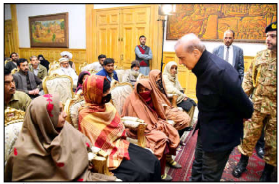
PESHAWAR: Prime Minister Muhammad Shehbaz Sharif interacting with the families of the deceased and injured in the wake of recent torrential rains and heavy snowfall.

After successful completion, the Prime Minister's Office directed for up-scaling of the said initiative to other four airports - Karachi, Lahore, Quetta and Peshawar. Efforts were made to extend the project, however, the MOU between both Governments was signed on 17 th May 2023.