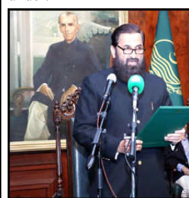
LAHORE: Governor Punjab Muhammad Balighur Rehman administering oath to 18-member new Provincial Cabinet. Chief Minister Maryam Nawaz is also present.

Names of the newly-appointed provincial ministers, along with their constituencies, from where they were elected to the Punjab Assembly, are as under: