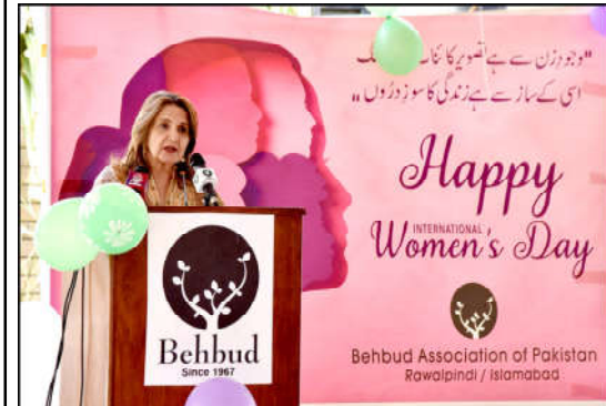
RAWALPINDI: First Lady Begum Samina Alvi addressing an event in connection with International Women's Day, at Behbud Association of Pakistan.

RAWALPINDI (APP): First Lady Begum Samina Alvi, On Wednesday while emphasizing the importance of women's role in the country's development, said that a progressive and inclusive society could not be possible without empowering women in every sector of life. Addressing an event organized in connection with International Women Day by the Behbud Association of Pakistan, Samina Alvi said it was the responsibility of everybody to ensure a conducive environment for girls and women to provide proper education and training, enabling them to live a life with dignity and respect. Appreciating the role of the association in empowering women, she said that since its inception, the Behbud Association has empowered around one million women by providing skills and training in various fields. She said women comprised half of the total population of the country, and their participation was very important to ensuring the economic development of the country. The first lady pointed out that the women's literacy rate in the country was much lower as compared to the men. She said Pakistan also needed to improve its current rating of 142 out of 147 countries in the Global Gender Gap Index.