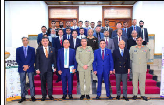
ISLAMABAD: A high-level delegation of Saudi Arabia's Al-Ajan Holding Group visited Special Investment Facilitation Council (SIFIC).