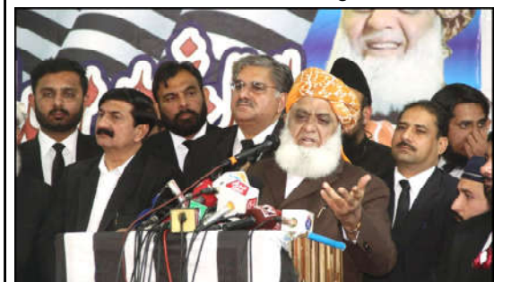
LAHORE: Amir JUI Maulana Fazlur Rehman addressing a ceremony with lawyers.

Crafted with state-of-the-art advanced technologies, HAIDER stands as a testament to Pakistani defence industry's relentless pursuit of excellence in defence innovation. The COAS was briefed in detail about the technical capabilities of the HAIDER tank and the progress being made in achieving indigenization in arms and armament. The COAS also visited other manufacturing facilities within the Heavy Industrial Complex and appreciated the commitment of the officers and workforce in successful achievement of another technological milestone.