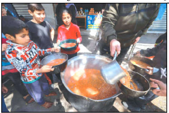
RAFAH: Palestinian children receive cooked food rations as part of a volunteer youth initiative in the southern Gaza Strip.