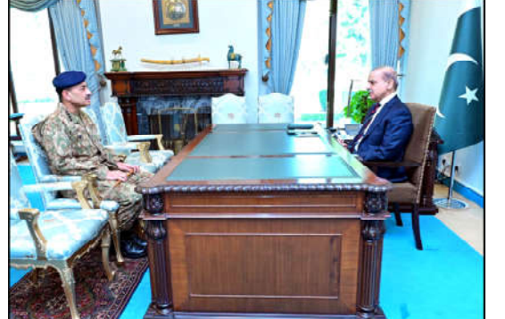
ISLAMABAD: Chief of Army Staff General Syed Asim Munir NI (M) calls on Prime Minister Muhammad Shehbaz Sharif.

He urged: "Let us reaffirm our commitment to promoting cultural harmony and understanding among all communities across the country, says a new release issued here.