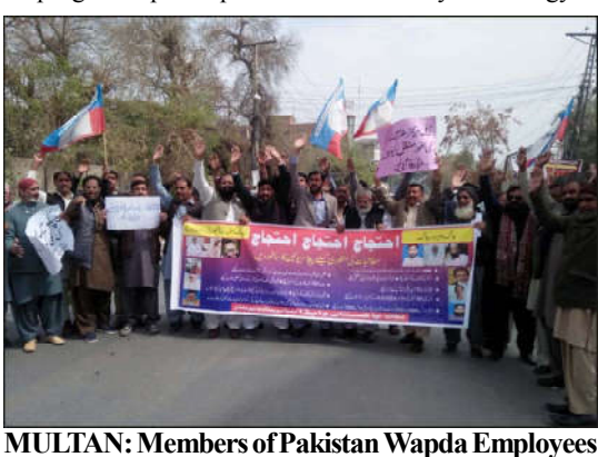
Pegham Union are holding protest demonstration for acceptance of their demands, at Multan press club. HESCO to facilitate issuance of new connections to commercial, Industrial zones

Pakistan has consistently been ranked among to 10 most vulnerable countries on the Climate Risk Index. Hawkins underscored the need for urgent action to adapt to climate change and highlighted U.S. efforts to support Pakistan through the 'Green Alliance' to address the challenges related to climate change, food security and energy.