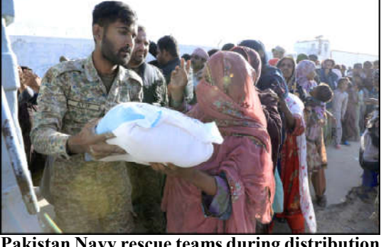
Pakistan Navy rescue teams during distribution of ration amongst flood affectees of Gwadar.

the reconstruction and renovation of road median, walkways, transforming them into welcoming spaces for the pedestrians.