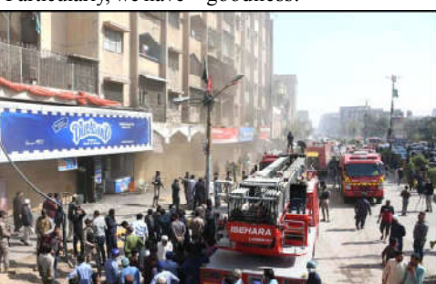
KARACHI: Pakistani fire fighters struggle to control a fire which broke out in foam market at MA Jinnah Road in Karachi.

"He is not to innovate at pleasure. He is not a knight errant, roaming at will in pursuit of his own ideal of beauty or of goodness.