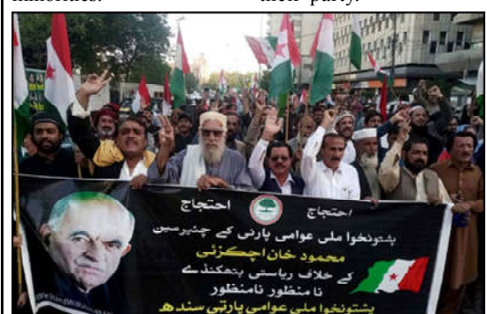
KARACHI: Members of Pashtunkhwa Milli Awami Party are holding protest demonstration for acceptance of their demands, held at Karachi press club.