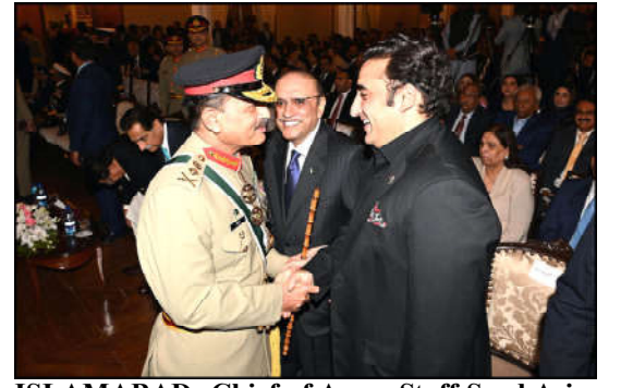
ISLAMABAD: Chief of Army Staff Syed Asim Munir shake hand with Chairman Pakistan Peoples Party Bilawal Bhutto Zardari during the oath taking ceremony of Prime Minister Mian Muhammad Shehbaz Sharif at President House in the Federal Capital.