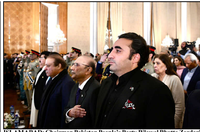
ISLAMABAD: Chairman Pakistan People's Party Bilawal Bhutto Zardari, Co-Chairman PPP Asif Ali Zardari, leader of PMLN Mian Muhaamad Nawaz Sharif attending oath taking ceremony of Prime Minister Mian Muhaamad Shahbaz Sharif at President House in the Federal Capital.