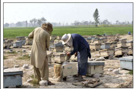
LAHORE: Farmers are busy in preparing to collect honey from boxes placed roadside fields in the Provincial Capital.

The campaign, he said had started from Dera Ghazi Khan in this regard.