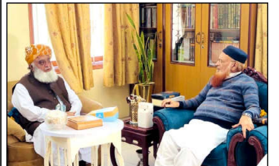
KARACHI: President of Jamia Dar-ul-Uloom Karachi and Wifaq Ul-Madaris Al-Arabia Pakistan, Mufti Muhammad Taqi Usmani exchanges views with Jamiat Ulema-e-Islam (JUI-F) Chief, Maulana Fazal-ur-Rehman during meeting held Jamia Dar-ul-Uloom in Karachi.

ISLAMABAD (INP): The presidential election in Pakistan is scheduled for March 9 when Asif Ali Zardari, the co-chairman of the Pakistan Peoples Party (PPP), and Mahmood Khan Achakzai, the chairman of the Pashtunkhwa Milli Awami Party (PkMAP), will vie for the prestigious office. National Assembly Speaker Ayaz Sadiq has called for a joint session of Parliament on March 9. The National Assembly secretary has issued a notification of the joint session. The scrutiny of nomination papers for candidates vying for the role of president was held on Monday. The final list of eligible candidates will be released on March 5 (Tuesday). Asif Ali Zardari's nomination papers have been approved after scrutiny, making him eligible to contest for the coveted presidential seat. However, Mahmood Khan Achakzai's nomination papers have not been approved yet, as reservations have been raised against them.