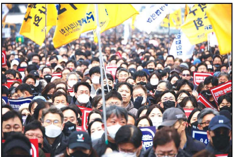
Children stand amid the rubble of a mosque and makeshift shelters that were destroyed in Israeli strikes in Deir El-Balah in central Gaza.