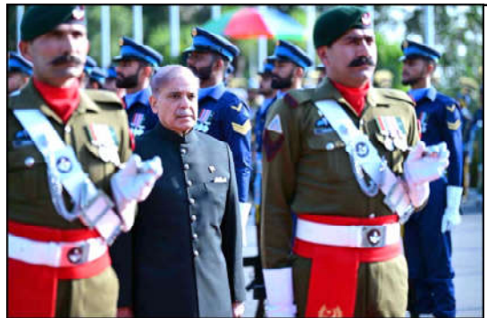
ISLAMABAD: Prime Minister Muhammad Shehbaz Sharif inspecting the Guard of Honor presented by a contingent of Pakistan's Armed Forces upon arrival at the Prime Minister House.

The business leader said that many PML-N leaders were experts in economic affairs, and with their advice, the country can be removed from the current whirlpool of problems.