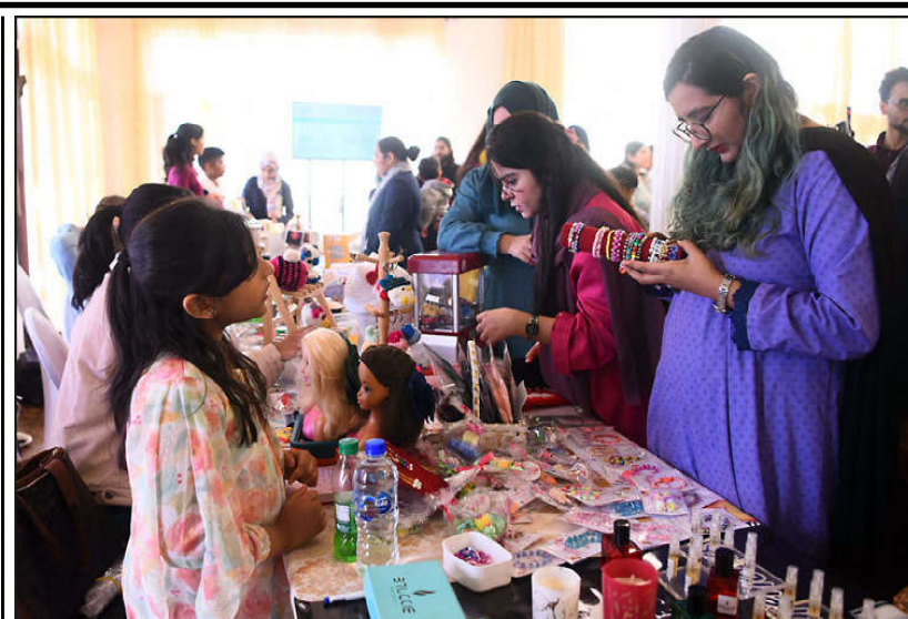
KARACHI: Women are busy buying handmade items on a stall at a local hotel, in the Provincial Capital.

He said that the prime focus and mission of WELDO was to provide impartial returns and reintegration services to returnees coming back to Pakistan through health, social, economic, and psychosocial support measures.