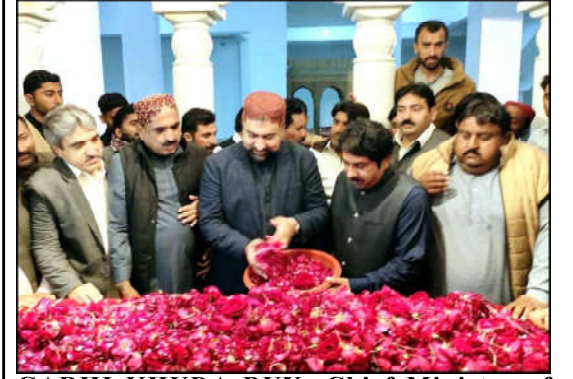
GARHI KHUDA BUX: Chief Minister of Balochistan, Mir Sarfraz Bugti along with others are offering and showering rose petals on the graves for the peace of departed soul of Martyred Mohitarma Benazir Bhutto and Martyred Zulfiqar Ali Bhutto held at Bhutto Mausoleum in Garhi Khuda Bux.

Spices and beverages would also be available at cheaper prices, he added.