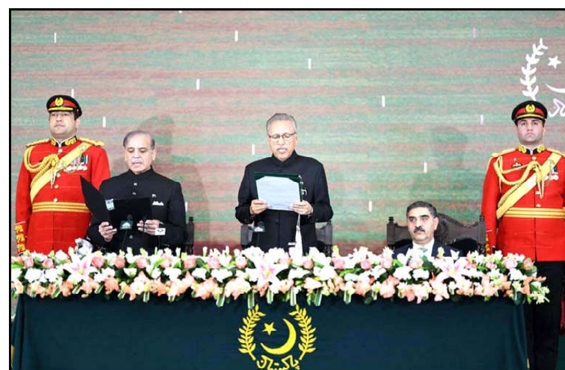
ISLAMABAD: President Dr. Arif Alvi administering the oath of office to Mian Muhammad Shehbaz Sharif as the Prime Minister of the Islamic Republic of Pakistan at Aiwan-e-Sadr.

chief ministers and diplomats. PML-N Quaid Muhammad Nawaz Sharif, President of Pakistan Peoples Party Parliamentarians Asif Ali Zardari, Pakistan Peoples Party Chairman Bilawal Bhutto Zardari, other political leaders including Hamza Shehbaz, Aleem Khan, Raja Zafarul Haq, Ahsan Iqbal and Khawaja Muhammad Asif, and senior officers also attended the ceremony. Prime Minister Shehbaz Sharif has directed the authorities concerned to prepare an action plan on an emergency basis to revive national economy.