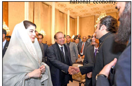
ISLAMABAD: Leader of Pakistan Muslim League (N) Mian Muhammad Nawaz Sharif shake hand with Chairman Pakistan Peoples Party Bilawal Bhutto Zardari after the oath taking ceremony of Prime Minister Mian Muhammad Shehbaz Sharif at President House in the Federal Capital, Chief Minister of Punjab Maryam Nawaz Sharif also seen in the picture.