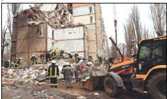
Rescuers work at the site of a heavily damaged apartment building in Odesa, following a Russian drone attack.

use that as an excuse to call for the eradication of a state — or any kind of hatred or antisemitism." After months of pro-Gaza public demonstrations and growing pressure on both the government and Labour party to take a tougher stance on Israel, it appears that the victory of George Galloway in a by-election in the erstwhile Labour stronghold of Rochdale is the straw that broke the camel's back. He won with overwhelming numbers that night, beating both the Labour and Tory candidate by wide margins. A much-loathed figure in British politics for his populist rhetoric, pro-Gaza Galloway lured Rochdale's Muslim voters through a targeted campaign centering on Gaza and the British government's silence on Israel's continued bombardment.