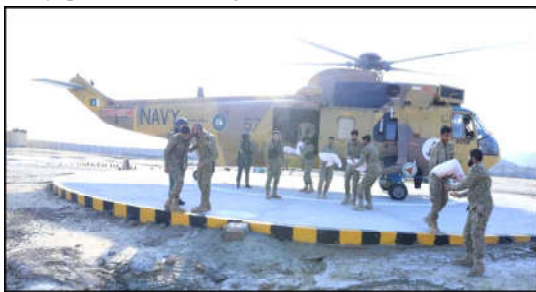
Pakistan Navy helicopter loading ration for distribution amongst flood affectees of Gwadar district.

KARACHI (INP): Pakistan Navy continues to extended relief and rescue operations to various small coastal villages of Balochistan affected by recent flash flooding. To expedite rescue and relief operations in flood affected areas of district Gwadar, Pakistan Navy has stationed helicopters there. Pakistan Navy helicopters undertook multiple hops from Gwadar to the flood affected villages of Pishukan and Kappar. Relief teams delivered ration bags, clean drinking water and food items near people stranded in their villages. Moreover, ration and relief goods distribution conducted by Pakistan Navy personnel amongst flood affectees of Gwadar city. In addition, large numbers of medical supplies and ration bags have also been dispatched to different other flood-affected villages through road where land connectivity was restored. Further, in assistance to civil administration, Pakistan Navy troops were wholeheartedly undertaking rescue and relief operations utilizing all available equipment and resources. In this regard, de-flooding operations were being conducted on various localities of Gwadar city to clear flood water. Pakistan Navy was resolutely committed to supporting our flood-affected brethren during this difficult time.