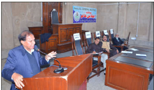
FAISALABAD: A speaker addressing an Annual General meeting of Faisalabad Union of Journalist (FUJ).

such as temporary shelter, food, and other necessities for owners of damaged homes. Ali Amin Gandapur directed urgent provision of medical assistance to the injured. He also directed to restore the closed roads due to heavy snowfall and rain. The Chief Minister has stressed the utilization of all available resources for this purpose. In light of any emergency situations, preparedness measures should be in place to tackle the challenges effectively, Ali Amin Gandapur asserts.