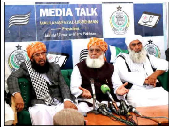
JUI-F chief Maulana Fazlur Rehman addressing a press conference in Karachi.

KARACHI (INP): Expressing dismay over the dwindling significance of the Parliament, Fazl remarked, "The Parliament, where we see a mockery of democracy, is no longer representative of the people. The Parliament, which we witness, will have some individuals calling themselves rulers. They may govern bodies but cannot govern the hearts of the nation." Despite his inclination to support Mahmood Achakzai, the candidate backed by the Pakistan Tehreek-e-Insaf (PTI)-supported Sunni Ittehad Council (SIC), Fazl indicated that his party's stance compels them to act otherwise. He dismissed the prospect of forming alliances with allied parties, citing an inadequate environment for a grand alliance. Fazl made these assertions during a press conference in Karachi, where he claimed that mounting international pressure forced Pakistan's military establishment to yield, thus influencing the election outcome. "The establishment's coercion will indeed be labelled as coercion. The establishment has divided its own ranks, accommodating some at one place and others elsewhere," he stated, addressing the alleged interference in the electoral process.