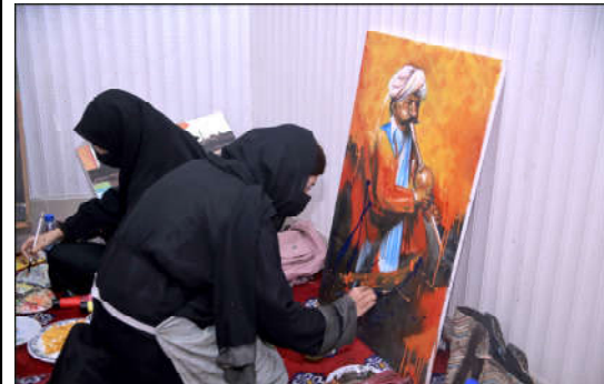
SARGODHA: Student giving final touch to painting during Punjab painting competitions organized by Sargodha Arts Council.

Pakistan, nature has blessed Punjab with beautiful wildlife, the protection and promotion of which is our responsibility. "On World Wildlife Day, I pay tribute to the workers and organizations serving in this field" she concluded. Meanwhile, Punjab Chief Minister Maryam Nawaz Sharif congratulated Pakistan Muslim League-Nawaz (PML-N) President Shehbaz Sharif on being elected Prime Minister of Pakistan for the second time. In her message issued on Sunday, the CM said, "I also congratulate the people of Pakistan as they have got a Khadim."