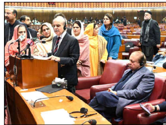
ISLAMABAD: Prime Minister Shehbaz Sharif address in the National Assembly after electing Prime Minister.

vals the Pakistan Peoples Party (PPP), as well as several smaller factions, to keep Khan's candidates out. In return, the PPP—a dynastic party ruled by the family of slain ex-premier Benazir Bhutto—has been promised the office of president for Bhutto's widow, Asif Ali Zardari. Ex-prime minister Khan was jailed in the run-up to the election and barred from running, while his Pakistan Tehreek-e-Insaf (PTI) party was targeted by a crackdown of arrests and censorship. PTI candidates were forced to run as independents but nonetheless secured more seats than any other party. However, they fell short of the figures needed to form a government, paving the way for Sharif's return. Omar Ayub Khan stood against Sharif as the