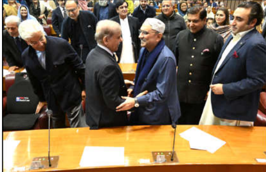
ISLAMABAD: Prime Minister Shehbaz Sharif hand shakes with PPP Leader Asif Ali Zardari after electing prime minister.