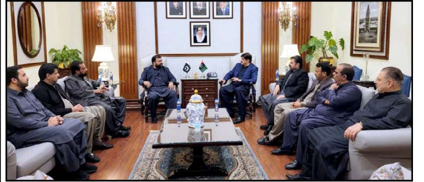
KARACHI: Chief Minister Balochistan Mir Sarfraz Ahmed Bugti meeting Chief Minister Sindh Syed Murad Ali Shah.

Balochistan CM — PPP senior leader Syed Khurshid Shah on Saturday felicitated Sarfraz Bugti on becoming the Balochistan chief minister. Expressing his thoughts, Shah rallied behind Bugti, saying, "Sarfraz Bugti will play an anchoring role in terms of uplifting the province." "We pray that the province will witness peace, development, and prosperity," Shah stated.