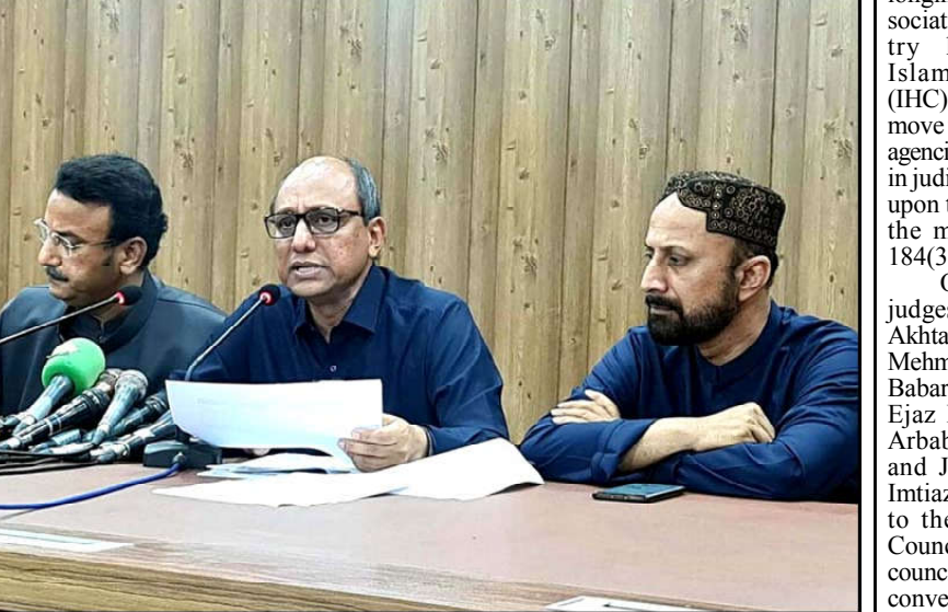
KARACHI: Sindh Minister for Local Government, Saeed Ghani addresses to media persons during press conference, in Karachi.