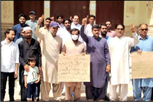
LARKANA: IBA passed candidates are holding protest demonstration for demanding appointment letters, at Jinnah Bagh in Larkana.

try prepares to enter its 24<sup>th</sup> IMF program. He em-He lamented the lack of attention given to cruphasized that while the cial ministries such as Foreign Affairs, stressing their potential to attract elite class remains largely unaffected by these programs, it is the common significant investments people who bear the brunt into the country