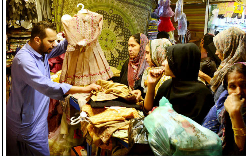
HYDERABAD: Women busy in Eid shopping at Resham Bazaar during upcoming Eid-ul- Fitr celebrations.