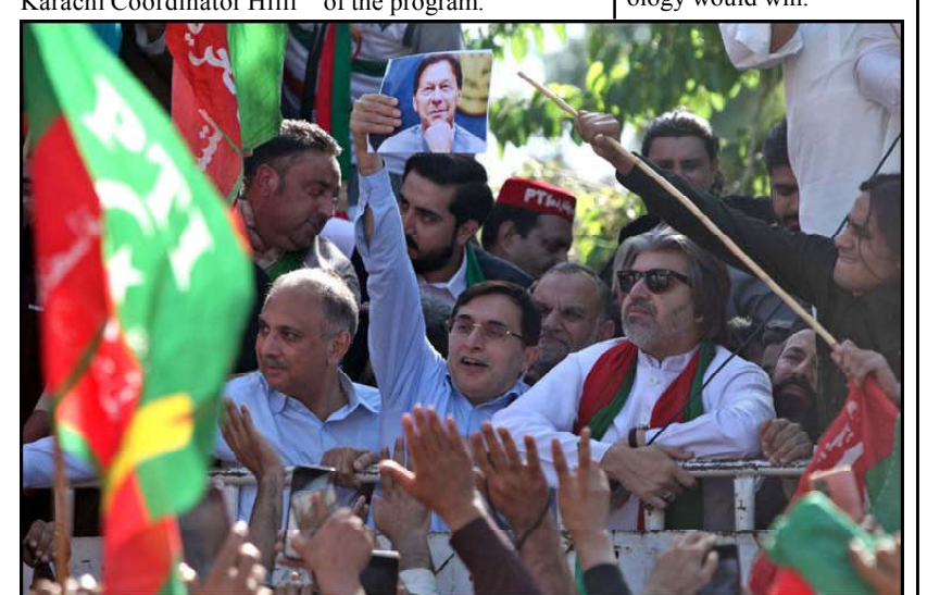
PESHAWAR: Activists of Tehreek-e-Insaf (PTI) are holding protest demonstration for release of Imran Khan, Former Prime Minister, at Peshawar press club.

He further said that they are taking measures to put an end to street crimes in Karachi