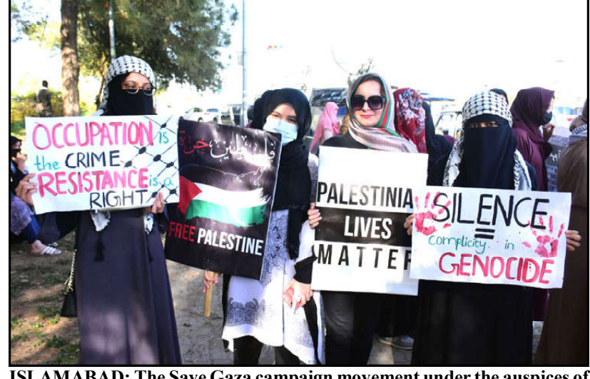
ISLAMABAD: The Save Gaza campaign movement under the auspices of Civil City is staging a sit-in at D Chowk in the Federal Capital.

in the religious affairs of Kashmiri Muslims and diman said the best way to vide the people.