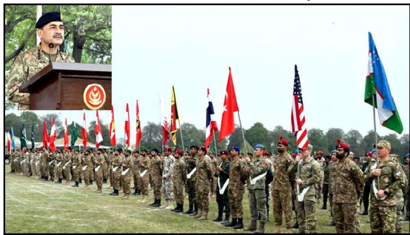
Chief of the Army Staff, General Syed Asim Munir addressing the closing ceremony of the Seventh Pakistan Army Team Spirit Exercise-2024 at Kharian.