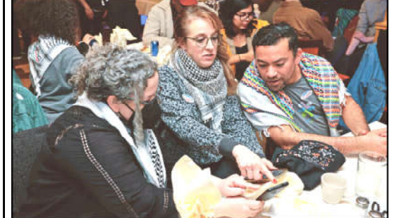
People look at election results at a monitoring centre set up in Dearborn by the Listen to Michigan watch party, a group which asked voters to vote 'uncommitted' instead of voting for President Joe Biden.

the Democratic primary was also high, at some 900,000 voters overall. About 81pc of those votes backed Biden. As the results were being tallied, a senior Biden campaign official said the team will continue to "make our case in the state — to both uncommitted voters and the entire Michigan constituency. The president will continue to work for peace in the Middle East." Biden's staunch support for Israel during its five-month war with Hamas, which has decimated Gaza, has sparked outrage and a well-organised backlash among progressive Democrats and Arab Americans, with Michigan as their epicentre.