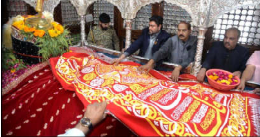
SEHWAN: Governor Sindh Kamran Tessori laying wreath on the shrine of Hazrat Lal Shahbaz Qalandar (RA) on his 772 URS celebrations at Sehwan Sharif.

UNITED NATIONS (APP): The United States supports Pakistan's efforts to "break free" from the vicious cycle of debt and financing, a State Department Spokesperson has said, urging the new government to continue working with the International Monetary Fund (IMF) and other global financial institutions. "Pakistan's new government must immediately prioritize the economic situation because the policies over the next several months will be crucial to maintaining economic stability for Pakistan," Spokesperson Mathew Miller told his daily news briefing on Wednesday. The spokesperson was responding to a question at the daily State Department briefing about a letter sent by ex-PTI's Chairman Imran Khan's to the IMF, suggesting to link the next loan facility to an audit of the Feb 8 general elections in the country. "I'll just say with respect to the IMF that we support Pakistan's efforts to break free from the vicious cycle of debt and international financing," the Spokesperson added. "The long-term health of Pakistan's government—or economy is crucial to its stability," Miller added. Pakistan has been facing financial challenges in recent years, with dwindling foreign exchange reserves and declining value of its national currency.