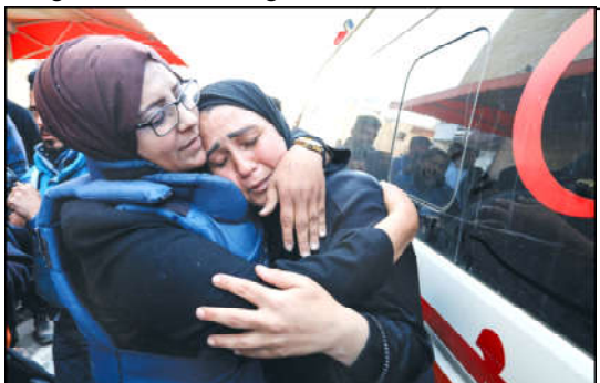
A member of the press consoles a woman outside Al-Aqsa hospital in Deir el-Balah.

Visibly angry, Putin suggested Western politicians recall the fate of those like Nazi Germany's Adolf Hitler and France's Napoleon Bonaparte who had unsuccessfully invaded Russia in the past.