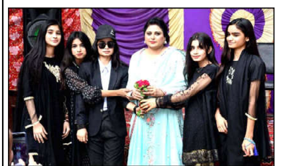
LARKANA: Student presents a bouquet to her teacher during a function at Govt little folks Girls High School Jinnah Bagh.