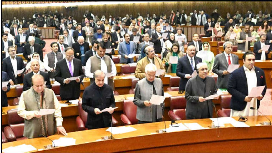
ISLAMABAD: The newly elected members of the National Assembly taking oath of their office during the inaugural session of the 16th National Assembly at the Parliament House.

Ph: 0300-3898091 Vol: 06. No. 42 Shaban 19, 1445 AH Friday March 01, 2024 Pages 04 Price Rs. 12.00