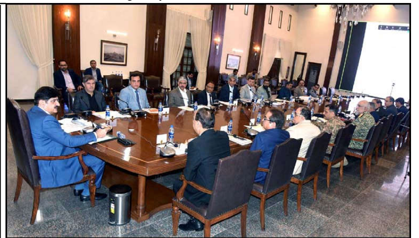
KARACHI: Sindh Chief Minister, Syed Murad Ali Shah presides over a rain-emergency meeting, held at CM House in Karachi.