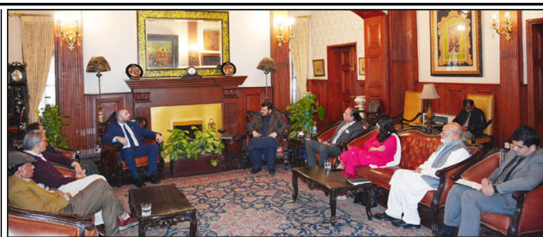
PESHAWAR: A delegation of Association of Small Medium Enterprises (BVMW) Germany meeting with Khyber Pakhtunkhwa Governor Haji Ghulam Ali.

He further said that the business community of the province and the importers and exporters are already under burden of heavy taxes while the Cess levy of 2% on import and export trade by the care-taker provincial government will further increase the problems and complications which is to be condemned.