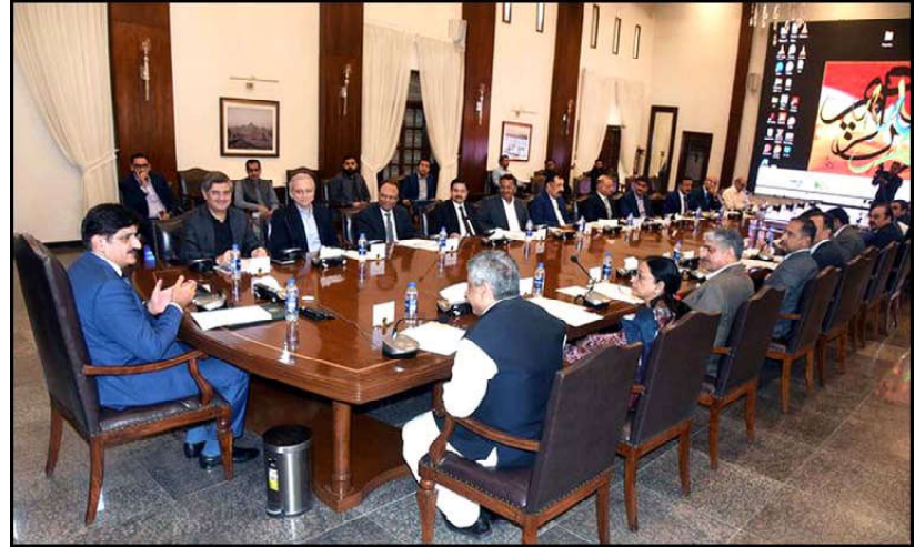
KARACHI: Sindh Chief Minister, Syed Murad Ali Shah presides over a meeting to review the progress of the projects launched for the rehabilitation of flood-affected infrastructure in the province, held at CM House in Karachi.