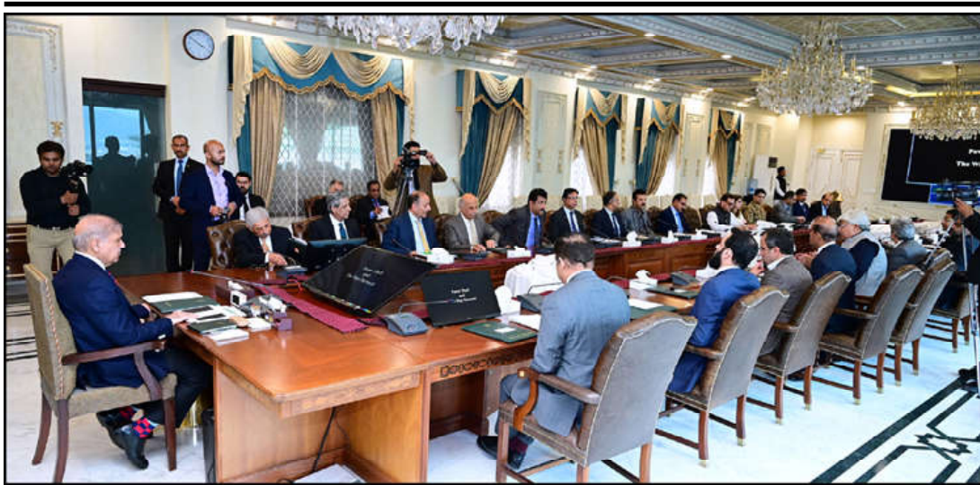
ISLAMABAD: Prime Minister Muhammad Shehbaz Sharif chairs a meeting on Anti-Power theft campaign.

ISLAMABAD (APP): Prime Minister Shehbaz Sharif Thursday chaired a high level meeting on stoppage of electricity theft and directed that immediate disciplinary action should be initiated against the officers and exemplary punishment should be given to them for abetting the crime and causing loss of billions of dollars. He said it was their responsibility to create a stable system by taking measures like launching a