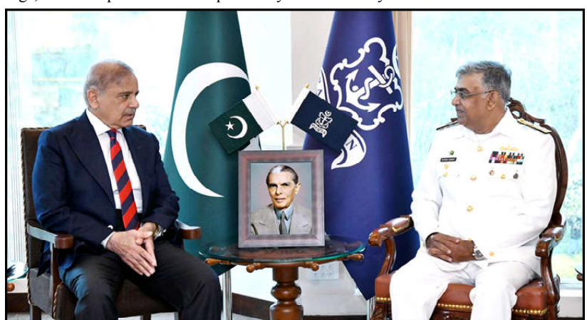
ISLAMABAD: Prime Minister of Pakistan, Muhammad Shehbaz Sharif exchanging views with Chief of the Naval Staff, Admiral Naveed Ashraf at Naval Headquarters.

the Prime Minister had said that he would go to meet the Chief Justice despite all of his busy schedule. The meeting between the Chief Justice of Pakistan Qazi Faez Isa and the Prime Minister Shehbaz Sharif lasted for one and a half hours, he said, adding that the most senior judge Justice Mansoor Ali Shah was also present in the meeting. The issues pertaining to the important national issues including economic and judges' letter were also came under discussion, he said. Tarar said that we leave it to the judiciary to decide whether the judges' letter is misconduct or not. He said that the TORs of the inquiry commission would also include this letter and past cases as well. He further said that in his opinion when such matters come up, they should not be suppressed. What ever commissions have been formed, they have been bringing all the things to public, he added.