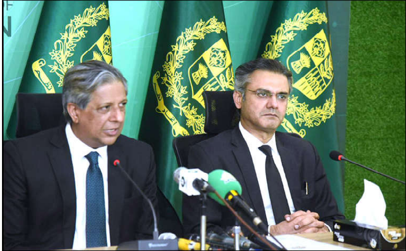
ISLAMABAD: Federal Minister for Law and Justice, Azam Nazeer Tarar and Attorney General of Pakistan, Mansoor Awan, address an important press conference.