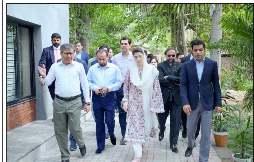
LAHORE: Punjab Chief Minister Maryam Nawaz inspecting the upgradation pilot project of Basic Health Centre Shamkay Bhatian.

LAHORE: Punjab Chief Minister Maryam Nawaz on Thursday ordered to complete brick lining of all watercourses in the province in five years under 'Sarsabz Punjab Khushaal Khastkar' initiative. The chief minister was presiding over a meeting in which formal approval was given to various agriculture projects. During the meeting, approval was given to the project under which lining of all watercourses in Punjab would be carried out besides solar tube-well project. In the first phase, lining of 1,200 watercourses would be carried out in two years at a cost of Rs 10 billion while in the second phase lining of 7,000 watercourses would be ensured. Farmers possessing upto 25 acres of land would be provided solar system in two years. In the meeting, the agriculture secretary briefed the chief minister about agriculture projects. Decision was made in the meeting to give 56 types of agricultural machinery to farmers on 60 per cent subsidy while farmers would be given 1,000 laser levelers in the next six months. Maryam Nawaz directed the relevant authorities to increase seed production from 400,000 tons to 600,000 tons. The meeting also discussed proposal to cultivate soyabean seed on 100,000 acres of land with the cooperation of University of Agriculture, Faisalabad.