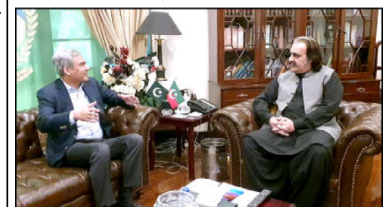
PESHAWAR: Federal Minister for Interior Mohsin Naqvi in a meeting with Chief Minister Khyber Pakhtunkhwa Ali Amin Khan Gandapur.

Pakhtunkhwa. They expressed complete solidarity with families of victims of Chinese nationals, people, Govt of China and expressed the resolve to bring the facilitators behind the attack to justice. Mohsin Naqvi said that culprits could not escape from the clutches of law. The minister directed effective coordination to counter the menace of terrorism and that through such nefarious acts, the courage of the Pakistani nation could not be shaken.