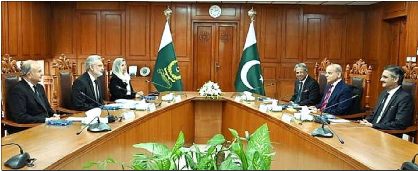
ISLAMABAD: Prime Minister Muhammad Shabbaz Sharif meeting with Chief Justice of Pakistan Justice Qazi Faez Issa at Supreme Court of Pakistan

Vol. XIV No. 75 Reg. mails-B/ID-445 Friday March 29, 2024, Ramzan 18, 1445 A.H. Ph: 2158688, 2158997 Pages 4: Rs. 12