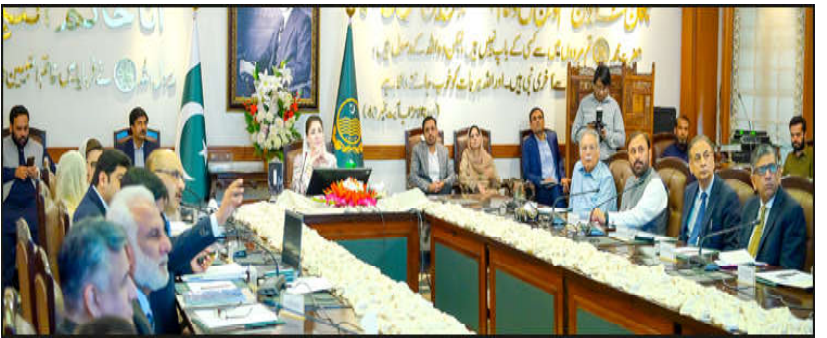
LAHORE: Punjab Chief Minister Maryam Nawaz Sharif presides over the special meeting about Mines and Minerals.

ISLAMABAD (APP): Minister for Planning, Development and Special Initiatives Ahsan Iqbal on Thursday said the recognition of Pakistan Medical and Dental Council (PM&DC) by the World Federation for Medical Education was a testament to Pakistan's commitment to excellence in healthcare and medical education. "An effective healthcare system's greatest indicator is to ensure that all citizens, despite their socioeconomic background, get the best available health facilities in a timely, acceptable, affordable, and accessible manner," he said while addressing a ceremony held to commemorate a significant milestone in the history of medical education and healthcare in Pakistan. The minister commended the collective efforts of healthcare professionals, educators, policymakers and stakeholders who tirelessly worked towards enhancing the standards of medical education and healthcare delivery in Pakistan, a news release said. Highlighting the notable progress of Pakistan's healthcare sector over the past decade, the minister shared that 3.5 percent increase in life expectancy from 2005 to 2019 was recorded. In the area of infant mortality, he said a 15 percent decline was recorded from 2000 to 2019, with an infant mortality rate of 58 per 1,000 live births. Remarkable increase was also marked in the number of healthcare facilities, which grew up to 20 & from 2007 to 2017, resulting in a total of 7,089 healthcare facilities.