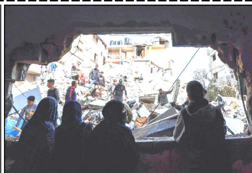
Palestinians search for food and belongings through the rubble of the buildings that were destroyed in the overnight Israeli bombardment in Rafah.

Putin warned Ukraine's Western allies against providing air bases in their countries from where the F-16s could launch sorties against the Kremlin's forces. Those bases would become a "legitimate target," he said. "F-16s are capable of carrying nuclear weapons, and we will also need to take that into account while organizing our combat operations," Putin added. Military analysts have said the arrival of F-16s won't be a game-changer in view of Russia's massive air force and sophisticated air defense systems, though Ukrainian officials have welcomed them as an opportunity to hit back at Russia's air dominance. Putin insisted the F-16s "won't change the situation on the battlefield."