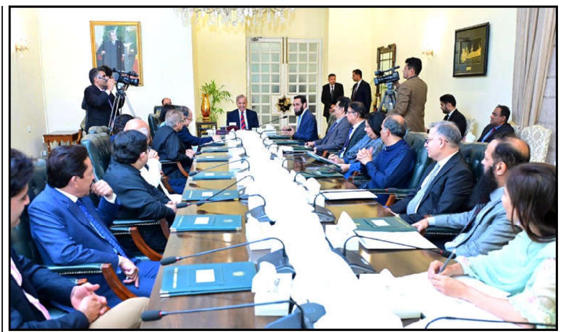
ISLAMABAD: A delegation of All Pakistan Newspapers Society calls on Prime Minister Muhammad Shehbaz Sharif.

strategy to revive the economy. A strategy was being formulated to modernize the system of tax collection, he said adding Federal Board of Revenue was being completely digitalized and work was continuing for increasing the tax base. Cases of more than Rs 2000 billion were pending in the courts and tribunals, he told. He said recently the government held the Tax Excellency Award with the aim to encourage good taxpayers, exporters and women entrepreneurs. Billions of rupees of electricity were being sto-