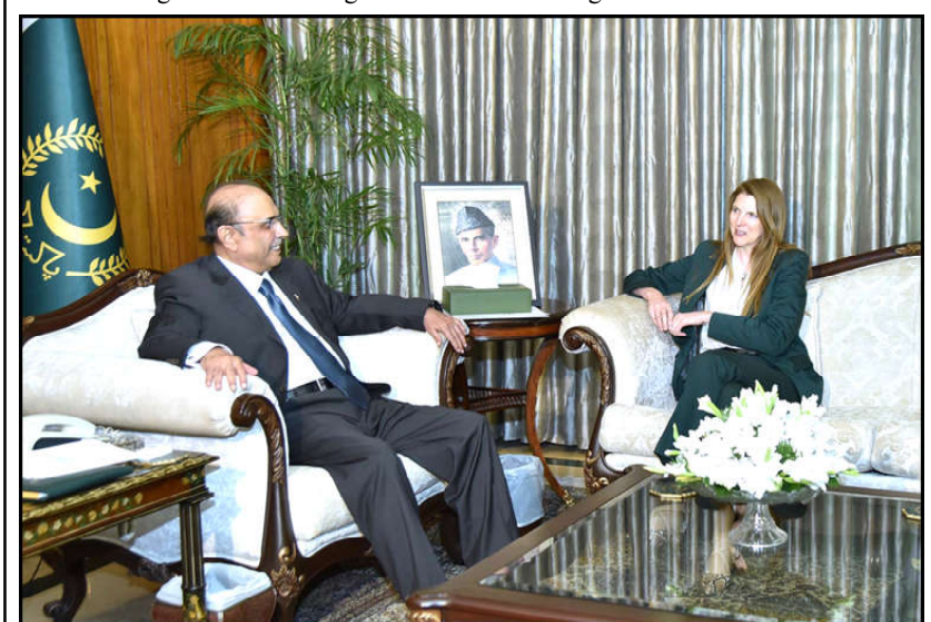
ISLAMABAD: The British High Commissioner to Pakistan, Ms Jane Marriott, calls on President Asif Ali Zardari, at Aiwan-e-Sadr.

posed a serious challenge to Pakistan as it was among the most vulnerable countries to climate change. He informed the High Commissioner that Sindh had mangrove forests, covering an area of 600,000 hectares, which supported the coastal ecosystem, besides contributing to environmental sustainability. He said that Pakistan had huge potential for solar and wind energy and their proper utilization could help the country meet its energy requirements. Jane Marriott felicitated President Asif Ali Zardari on assuming the office of the President of Pakistan.