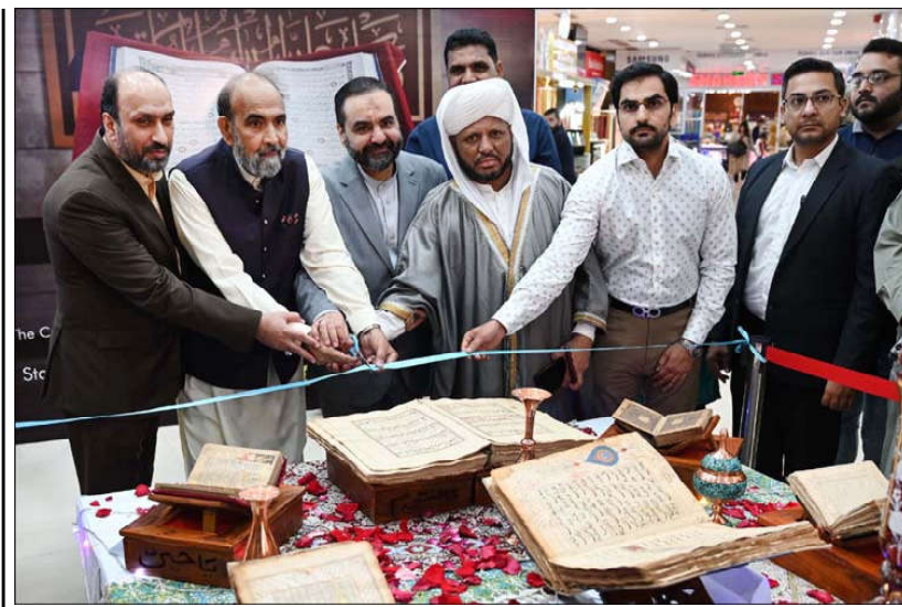
ISLAMABAD: Chairman of the Council of Islamic Ideology (CII) Dr. Qibla Ayaz along with others cutting ribbon at the opening ceremony of Quran Exhibition of Manuscripts organized by Cultural Consulate Embassy of I.R. Iran Islamabad and Iran Pakistan Institute of Persian Studies in collaboration with Safa Gold Mall.

ISLAMABAD (APP): Prime Minister Muhammad Shehbaz Sharif on Wednesday reiterated Pakistan's firm support to global efforts for peace and stability without compromising on the security of its people, sovereignty and territorial integrity. Addressing an Iftar dinner hosted in honour of the members of the diplomatic corps at the Ministry of Foreign Affairs, the prime minister said 'as a peace loving nation, Pakistan desires peace with all and enmity with none'. He reaffirmed that his government would follow this message of the founding fathers of the country. The prime minister further said that constitution of Pakistan guaranteed equal rights to all citizens without any distinction. To translate it into reality, different policies had been enacted and every community in Pakistan had the complete freedom to profess their faith and practice their religion, he added. The prime minister also spelled out the priorities of the government and said that after conclusion of peaceful general elections, progress and prosperity of the people of Pakistan were at heart of the government's agenda. They had a development oriented agenda to turn around the economic trajectory, he said, adding the government would strive to bring reforms, forge global partnership for shared development and attract foreign investment. He said that country's foreign robust policy continued to support global efforts for peace and stability. The prime minister further reiterated