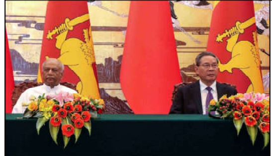
Sri Lanka's Prime Minister Dinesh Gunawardena and China's Premier Li Qiang during bilateral talks in Beijing.