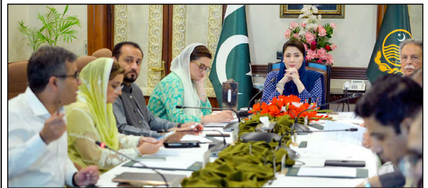
LAHORE: Punjab Chief Minister Maryam Nawaz Sharif presides over the special meeting regarding Health Reforms in province.

LAHORE (APP): Ahad Khan Cheema, Syed Mohsin Raza Naqvi, Hamid Khan, and four others have secured victory unopposed in the seven general seats of the Senate from Punjab. As per details shared by a spokesperson of the Provincial Election Commissioner of Punjab, 12 candidates were in the race for the seven general seats of the Senate from Punjab. However, after the withdrawal of nomination papers by five candidates, only seven candidates remained in contention, resulting in all seven candidates technically winning without competition. Among them, five candidates from the Pakistan Muslim League-Nawaz (PML-N) and two candidates from the Sunni Ittehad Council emerged victorious without contest. Pervaiz Rashid, Nasir Mahmood, Ahad Khan Cheema, and Muhammad Tallal Badar of the PML-N clinched success. Similarly, Mohsin Naqvi, backed by the government alliance, also triumphed. Raja Nasir Abbas and Hamid Khan Advocate likewise secured victory unopposed.