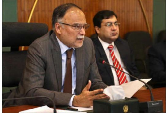
ISLAMABAD: Federal Minister for Planning, Development & Special Initiatives, Professor Ahsan Iqbal chairs the first Steering Committee meeting to implement 5Es development framework.

ISLAMABAD (APP): Empowerment. The National Economic Council (NEC) approved the framework last year in June, following which the Planning Ministry expedited its implementation of the multi-pronged strategy to turnaround Pakistan and put it on a sustained growth trajectory. The Committee decided to hold a One-Day "consultative workshop" after Eid-ul-Fitr in which officials from all the ministries and relevant stakeholders would be invited for deliberations to implement the framework, a news release said. Among others, the meeting was attended by senior officials of federal and provincial ministries and divisions. The 5Es framework is centred on five key pillars including Exports, E-Pakistan, Environment and Climate Change, Energy and Infrastructure, Equity and