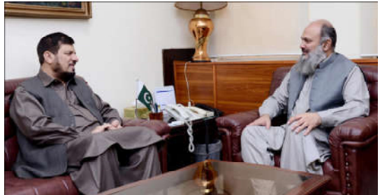
ISLAMABAD: Governor KPK, Haji Ghulam Ali calls on Federal Minister for Commerce, Jam Kamal Khan.

ISLAMABAD (APP): In a gesture of support and goodwill, Haji Ghulam Ali, the Governor of Khyber Pakhtunkhwa on Wednesday congratulated Jam Kamal Khan as newly appointed Federal Minister for Commerce, highlighting the significant challenges amidst Pakistan's economic landscape. Governor Ghulam Ali emphasized Jam Kamal's pivotal role in navigating economic complexities and fostering trade relations to spur growth, said a press release issued here. Jam Kamal Khan acknowledging the task's magnitude, expressed commitment to revitalizing the commerce sector through collaboration and innovation. The collaboration between federal and provincial authorities signifies a collective resolve to address economic imperatives for sustained growth and prosperity in Pakistan, Jam Kamal said. The Governor invited the federal minister to visit KPK and engage with the business community.