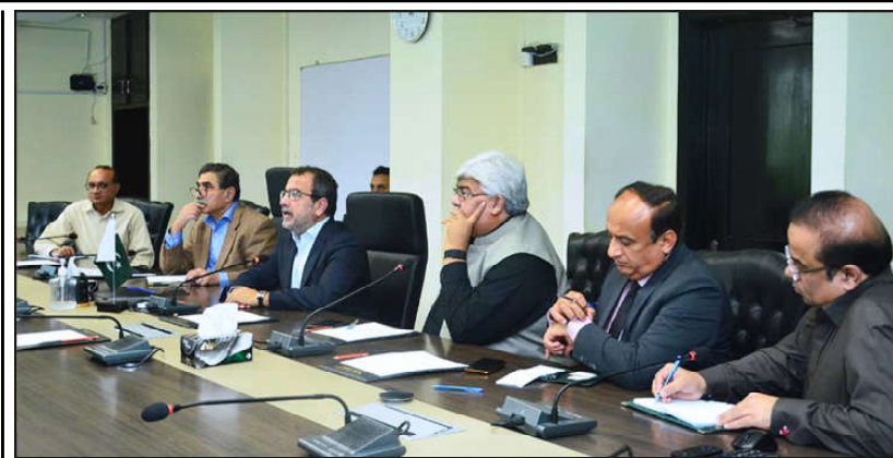
ISLAMABAD: Federal Minister for Power, Sardar Awais Ahmad Khan Leghari addresses the CEOs and Chairmen of DISCOS via video link.

He mandated the management of Distribution Companies (Discos) to maintain up-to-date financial records diligently and compile detailed information regarding the company's assets.