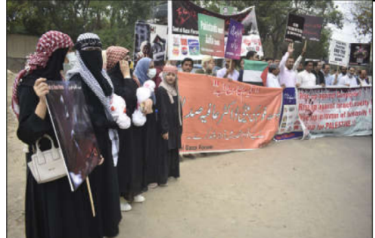
LAHORE: Members of civil society are protesting against Israel's aggression on Palestine.