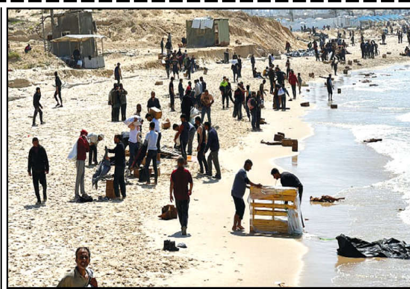
Palestinians gather on a beach as they collect aid dropped by an airplane, amid the ongoing Israeli bombardment of the northern Gaza Strip.

agency Unicef in Gaza, described seeing "paper thin" children in a hospital in northern Gaza and incubators full of underweight babies from malnourished mothers. "Tens of thousands of people crowd the streets," he told the same briefing, describing his latest visit to the north on Monday. "They make that universal signal of hand to mouth desperately asking and seeking for food." "Life-saving aid is being obstructed. Lives are being lost. I saw children whose malnutrition state was so severe, skeletal," he said. Other aid agencies also deliver food parcels to northern Gaza, although UNRWA is the biggest provider.