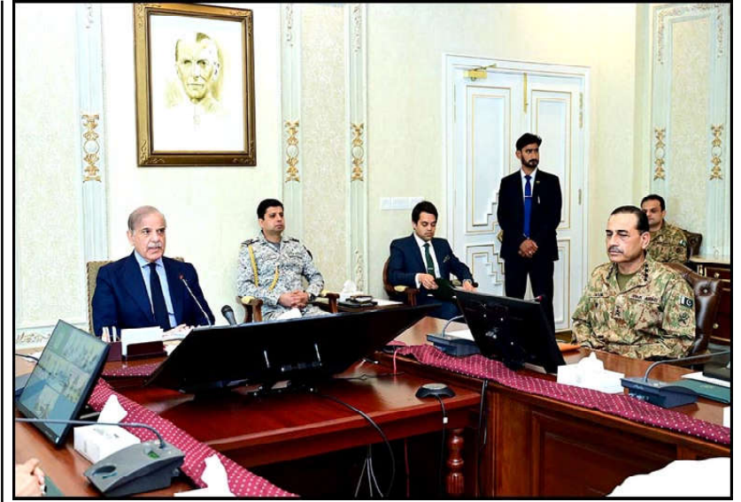
ISLAMABAD: Prime Minister Muhammad Shehbaz Sharif chairs a high level security meeting.

State and the people of Pakistan. He said, "we shall fight terrorism till every terrorist casting an evil eye on Pakistan, its people and their guests, is eliminated; we shall not leave any stone unturned to ensure that every foreign citizen, especially the Chinese nationals, contributing to the prosperity of Pakistan, is safe and secure in Pakistan. We shall fight terrorism with all our might, to the very end." The meeting concluded with the participants reiterating resolve to comprehensively combat terrorism employing all resources available to the state.