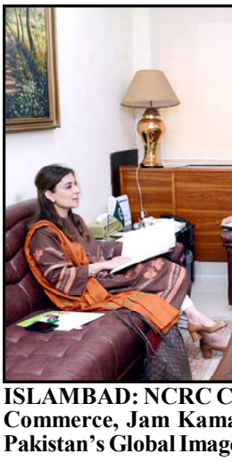
ISLAMABAD: NCRC Chairperson collaborates with Federal Minister for Commerce, Jam Kamal Khan to elevate child rights agenda and boost Pakistan's Global Image.

PESHAWAR (INP): Ali Muhammad Khan, a prominent leader of the Pakistan Tehreek-e-Insaf (PTI), has announced the nomination of Sher Fazl Marwat for the chairmanship of the Public Accounts Committee (PAC). Emphasizing the significance of the PAC chairmanship as an opposition privilege, Khan asserted that it is not within the government's authority to dictate who leads the committee. He dismissed any notion of factionalism within PTI, stating that despite internal discussions and differences, the party remains united under the leadership of Imran Khan.