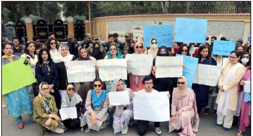
LAHORE: Teachers and parents of students of Aitchison College are holding protest demonstration for acceptance of their demands, outside Punjab Governor House building in Lahore.