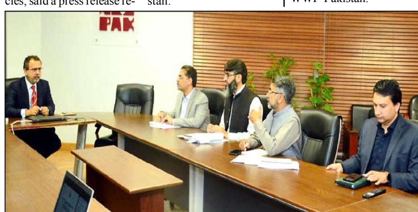
ISLAMABAD: Federal Minister for Power, Sardar Awais Ahmed Khan Leghari meets officials from Federal Flood Commission and Punjab Irrigation Department.

ISLAMABAD: The Centre for Peace and Development Initiatives (CPDI) extends warm greetings to Mr. Sarfaraz Ahmed Bugti, Chief Minister of Balochistan, on his recent assumption of office. While congratulating Mr. Bugti, CPDI emphasizes the imperative need for him to ensure the implementation of the Balochistan Right to Information Act, 2021.