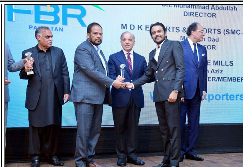
ISLAMABAD: Prime Minister Muhammad Shehbaz Sharif presents awards to the highest taxpayers and exporters of the country at the Tax Excellence Awards 2024.

The minister warned that the import-led and subsidy-supported businesses were not sustainable anymore and the country would have to accelerate export led-growth to achieve the trajectory of sustainable growth.