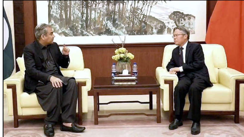
ISLAMABAD: Federal Minister for Interior, Mohsin Naqvi visits the Chinese Embassy and met with Chinese Ambassador Jiang Zaidong to offer condolences over the death of Chinese nationals in a suicide attack.