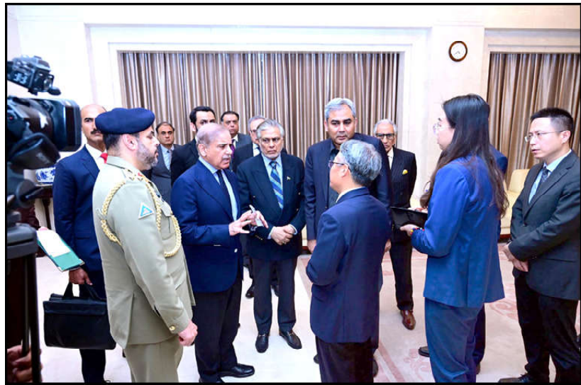
ISLAMABAD: Prime Minister Muhammad Shehbaz Sharif visits the Chinese Embassy, and met with Chinese Ambassador Jiang Zaidong to offer condolence over the death of Chinese nationals in a suicide attack in District Shangla.

Vol. XIV No. 73 Reg. mails-B / ID-445 Wednesday March 27, 2024, Ramzan 16, 1445 A.H. Ph: 2158688, 2158997 Pages 4: Rs. 12