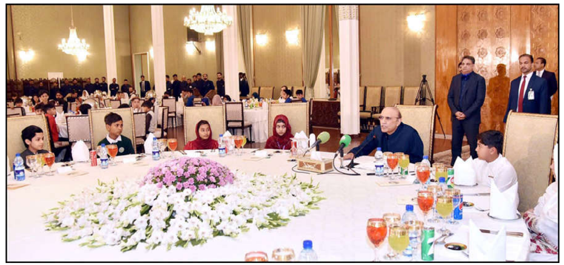
ISLAMABAD: President Asif Ali Zardari addressing the Iftar-Dinner hosted by him for children from different orphanages of the country on the occasion of Orphans Day in Islamic World, at Aiwan-e-Sadr.

Expressing gratitude to President Asif Zardari, the Chairman POCF said inviting children to the presidency would increase their confidence and motivation.