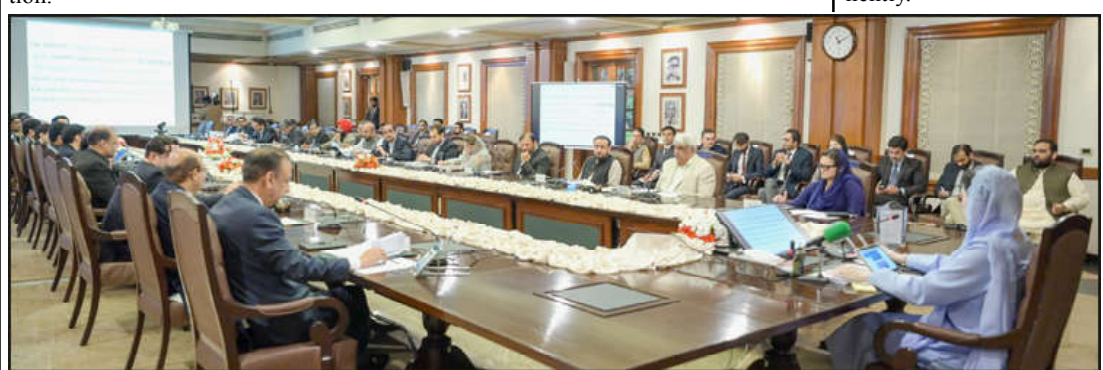
LAHORE: Chief Minister Punjab Maryam Nawaz Sharif presiding over 4th meeting of Provincial Cabinet.