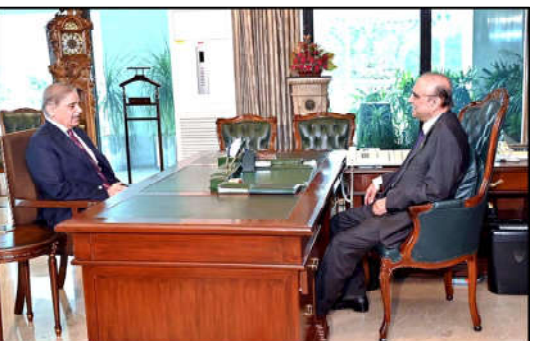
ISLAMABAD: Prime Minister of Pakistan Muhammad Shehbaz Sharif called on President Asif Ali Zardari, at Aiwan-e-Sadr.

The meeting also agreed on the installation of cameras inside the examination halls and the use of AI to check cheating in exams.