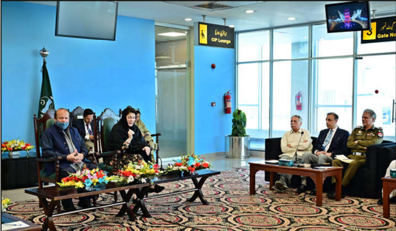
FAISALABAD: Chief Minister Punjab Maryam Nawaz and PMLN Supremo Nawaz Sharif are addressing a meeting of local parliamentarians and PMLN leaders at Faisalabad Airport.

while 3,000 motorbikes would be provided to male and female students in each district. She said that students would also be given laptops and iPads whereas a comprehensive system of solid waste collection was being implemented in 36 districts. The government has also set a target to introduce waste management system on PP mode in all districts of the Punjab including its rural areas within next 3 months, she added. She also condemned the killing of a youth with kite string and said that this incident was very painful which could not be ignored rather its responsible would be taken to task.