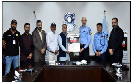
ISLAMABAD: Senior officers of Islamabad Capital Police, DG ZARRA alert, and representatives of social organization Roshni were present at the occasion.

cover missing and abducted children. While utilizing this new digital platform, resolving the issues of missing and abducted children is among the top priorities of Islamabad Capital Police. In this regard, Islamabad Capital Police will take effective measures to combat crimes against children and ensure that those involved are brought to justice.