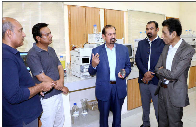
KARACHI: Federal Minister for Science and Technology Dr. Khalid Maqbool Siddiqui visits PCSIR Laboratories Complex.

will also get the first hand knowledge of latest developments in different fields. Stressing the need of unified efforts to deal with challenges confronted by the country Khalid Maqbool said that we may steer the nation out of crisis if every stakeholder prioritize state over political or individual motives. We have to set our direction towards an inclusive and participatory democratic approach by going into the masses for strengthening the democratic system in the country, he opined and added that his party was playing a constructive role to bring democratic stability in the country.