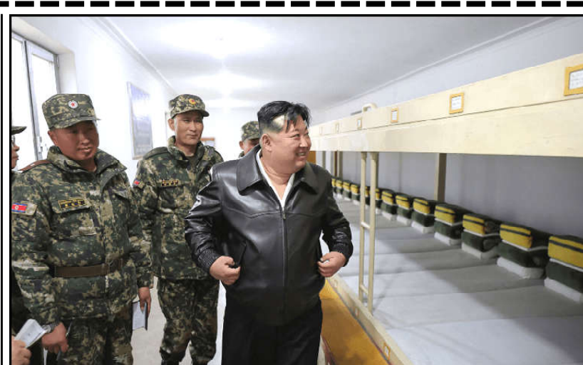
North Korean leader Kim Jong Un (C) inspecting the First Tank Armored Infantry Regiment, which is under the direct control of the Seoul Ryu Kyong Su Guards 105th Tank Division of the Korean People's Army (KPA) at an undisclosed location in North Korea.

try spokeswoman Maria Zakharova called into question US assertions that IS, which once sought control over swathes of Iraq and Syria, was behind the attack. In an article for the Komsomolskaya Pravda newspaper, she said the US was evoking the "bogymen" of IS to covertly "wards" in Kyiv and reminded readers that Washington had supported the mujahideen fighters who fought Soviet forces in the 1980s. Two US officials said on Friday that the US had intelligence confirming IS's claim of responsibility. Kremlin spokesman Dmitry Peskov later told reporters that Russia could not comment on the IS claim while the investigation was ongoing and would not comment on US intelligence, saying it was sensitive information.