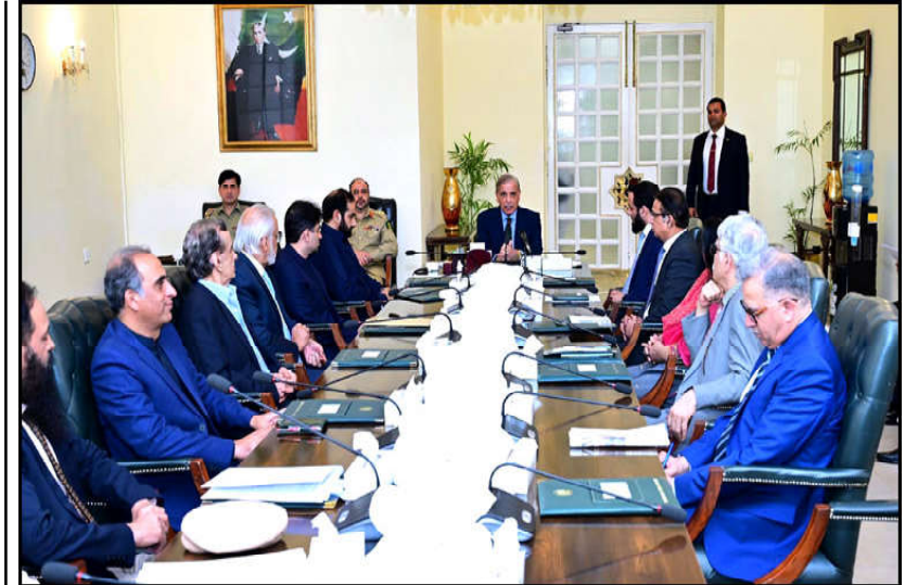
ISLAMABAD: A delegation of Pakistan Broadcasters Association calls on Prime Minister Muhammad Shehbaz Sharif.

tary campaign in response to eliminate fighter group, has killed more than 32,000 people, mostly women and children, according to the health ministry in the Palestine territory. The Security Council has been divided over the Israel-Gaza war since the October 7 attacks, only approving two of eight resolutions, which both mainly dealt with humanitarian aid. And those resolutions seem to have had little effect on the ground, where UN personnel say Israel continues to block aid convoys as experts warn of looming famine.