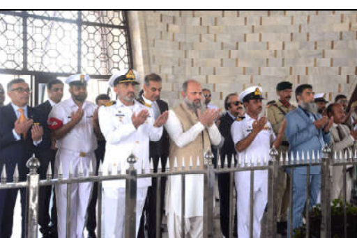
KARACHI: Federal Minister for Commerce Jam Kamal Khan offering Fataha at the Mausoleum of Father of the Nation Quaid-e-Azam Mohammed Ali Jinnah.

ISLAMABAD (APP): The Saudi Ambassador to Pakistan, Nawaf bin Said Al-Malki Monday called on Federal Minister for Power, Sardar Awais Ahmad Khan Leghari. During the meeting, the minister acknowledged the steadfast support of the brotherly country in all challenging situations, said a news release. Awais Leghari highlighted various investment opportunities, particularly in the transmission sector, and assured the ambassador of investor-friendly policies under the current government.