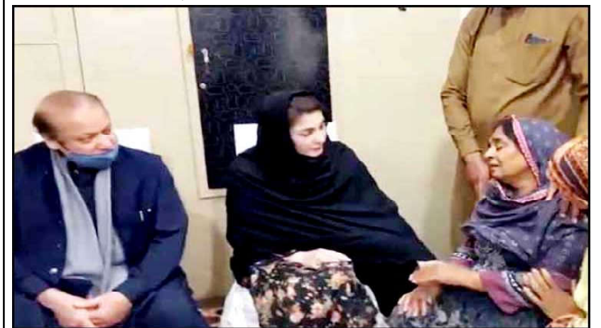
Both Nawaz and Maryam expressed condolences to the family for this tragic loss.