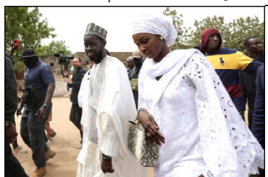
Presidential candidate Bassirou Diomaye Faye, who is backed by Senegalese opposition leader Ousmane Sonko, walks with one of his wives after casting his vote at the polling station at Ndiagianio in Mbour, Senegal.

Early Saturday, Israeli troops stormed the building and forced dozens of residents to leave. He said men were forced to strip to their underwear and four were detained. The rest were blindfolded and ordered to follow a tank south as blasts thundered around them. "From time to time, the tank would fire a shell," he told the Associated Press. "It was to terrorize us." Israeli jets on Sunday launched several strikes near Shifa Hospital, which largely stopped functioning following the November raid. After claiming that Hamas maintained an elaborate command center there, Israeli forces months ago exposed a single tunnel leading to a few underground rooms.