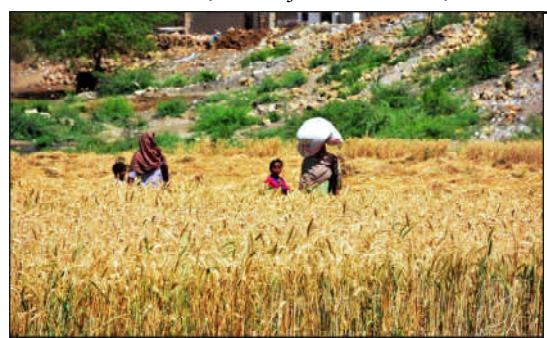
HYDERABAD: Wheat crop is ready for harvesting at Latifabad.