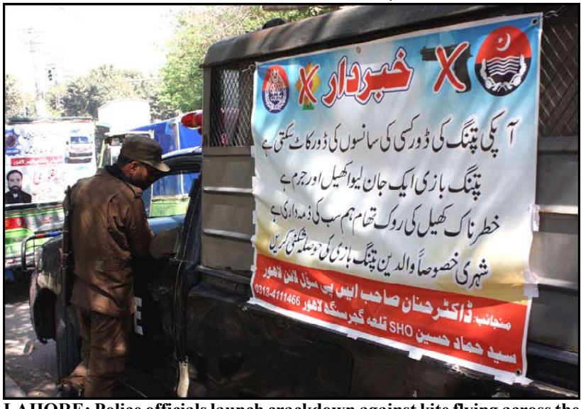
LAHORE: Police officials launch crackdown against kite flying across the city, in Lahore.

They said that maintaining peace and security, protecting human rights, preventing genocide, crimes against humanity, supporting sustainable development and upholding international law were prime responsibilities of the UN. Discussing the failure of the UN peace-building operations in effectively addressing human rights as warning signs of conflict, they said that there was a dire need to enhance strategies to ensure that human rights of the people were protected and respected under all circumstances and more important to add teeth to human rights machinery.