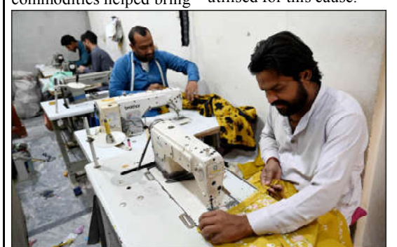
ISLAMABAD: Tailors busy stitching clothes for upcoming Eid ul Fitr festival.