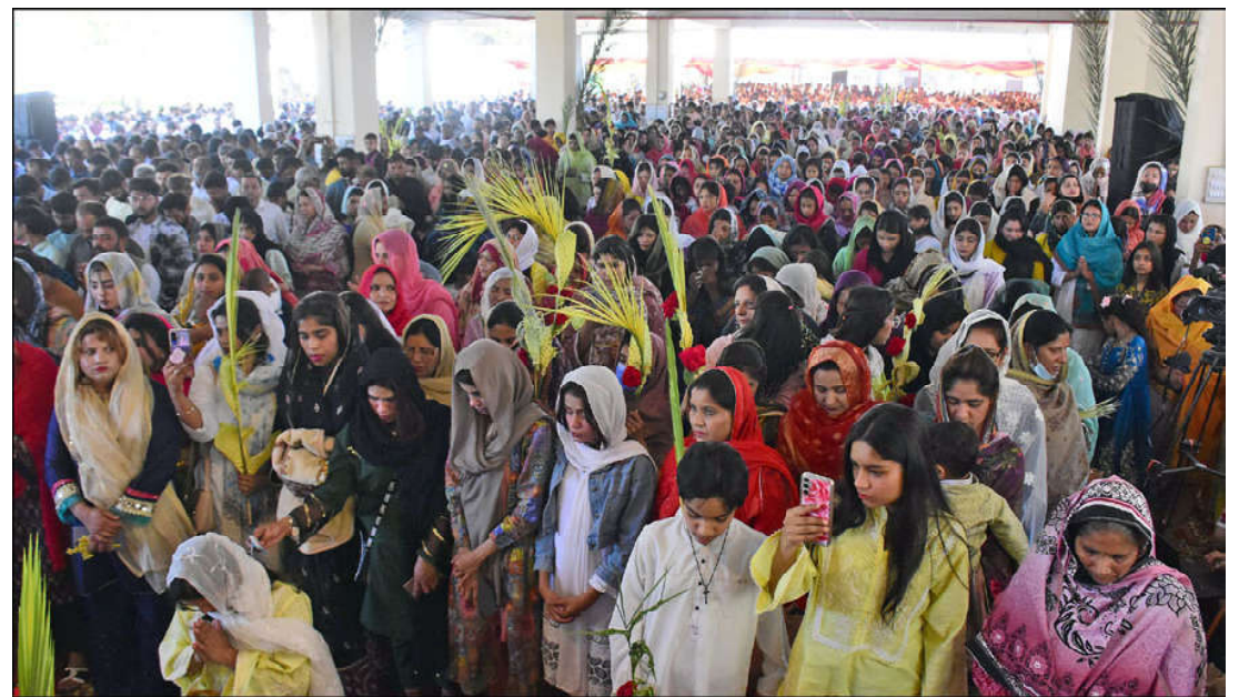
ISLAMABAD: Christian devotees attend a Palm Sunday Ceremony at Our Lady of Fatima Church in Federal Capital.