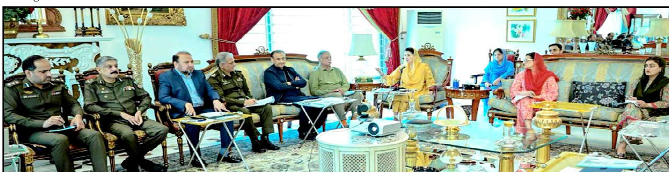
LAHORE: Chief Minister Punjab Maryam Nawaz presiding over a high-level meeting to review law and order situation

ISLAMABAD (APP): Capital Development Authority (CDA) has imposed heavy taxes on real estate properties in federal capital Islamabad. According to notification, owners of 140 square yards plots in sectors and housing societies like Shehzad Town, Margala Town, and Rawal Town will now pay Rs24,000 in taxes. Farmhouse owners with eight kanals will pay Rs180,000, while those with 90 to 120 kanals will pay Rs442,000. Commercial properties in the blue area will be taxed at Rs32 per square foot for ground floor, Rs22 per square foot for basement.