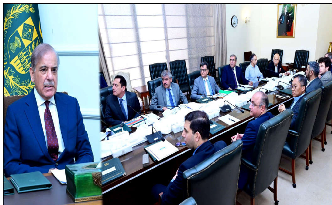
LAHORE: Prime Minister Muhammad Shehbaz Sharif chairs a meeting on Mines and Minerals of Balochistan with special context to Reko Dik Project.

Vol. XIV No. 71 Reg. mails-B/ID-445 Monday March 25, 2024, Ramzan 14, 1445 A.H. Ph: 2158688, 2158997 Pages 4: Rs. 12