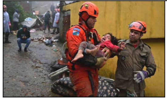
Members of the Civil Defense carry a girl, who remained more than 12 hours under the rubble of her house, which was destroyed by the heavy rains in Petropolis, Brazil.

were killed when camouflaged gunmen stormed the Crocus City Hall, in Moscow's northern suburb of Krasnogorsk, and then set fire to the building on Friday evening. The Islamic State group wrote on Telegram on Saturday that the attack was "carried out by four IS fighters armed with machine guns, a pistol, knives and firebombs," as part of "the raging war" with "countries fighting Islam". It is the deadliest attack in Russia for almost two decades. Russian officials expect the death toll to rise further, with more than 100 wounded in hospital. Russia's Investigative Committee, which probes major crimes, said rescue workers were still pulling bodies from the burnt-out building on Saturday.