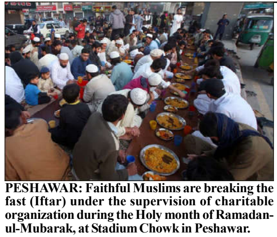
PESHAWAR: Faithful Muslims are breaking the fast (Iftar) under the supervision of charitable organization during the Holy month of Ramadan-ul-Mubarak, at Stadium Chowk in Peshawar.

on a priority basis with sustainable solutions, assured Ali Amin Gandapur. The chief minister also emphasized the need to overhaul the city's sanitation system by shifting it underground. In order to enhance public services, in all autonomous institutions, the provincial government will appoint hardworking and professional individuals based on merit, CM reiterated. He made it clear that no political recommendations would be entertained in this process. He said that local governments will be empowered and strengthened to ensure that public issues are resolved at the grassroots level.