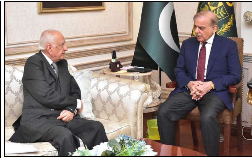
LAHORE: Former Governor of the Punjab Mr. Shahid Hamid calls on Prime Minister Muhammad Shehbaz Sharif.

SIALKOT (APP): The cleanliness of 325 villages of the district was progressing successfully under the 'Suthera Punjab Programme'. This was stated by District Council Chief Officer Ulfat Shahzad while reviewing the cleanliness drive in District Council Sialkot.