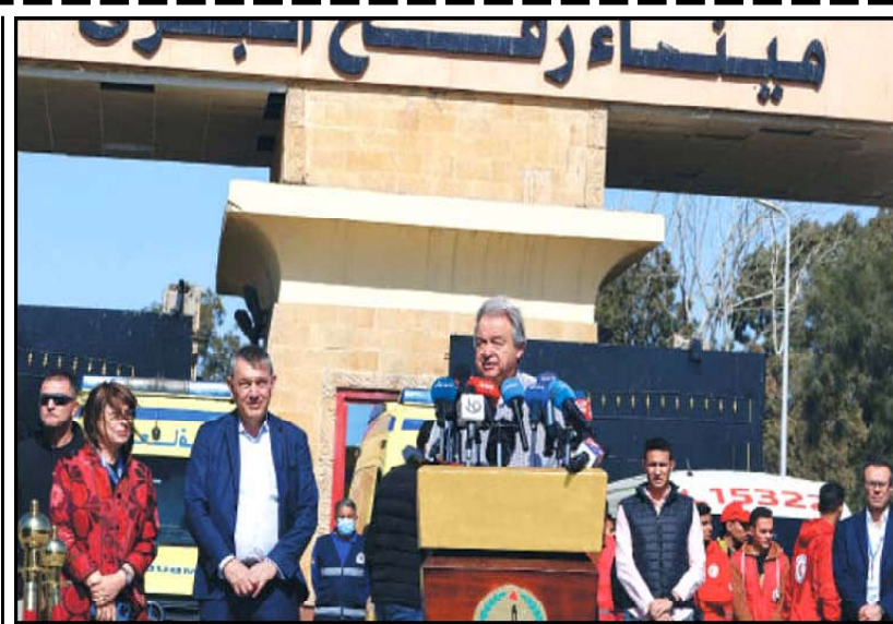
United Nations Secretary General Antonio Guterres talks to the media during a visit to the Rafah border crossing.