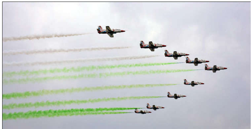
ISLAMABAD: Karakoram-8 (K-8) aircrafts of PAF perform aerobatic manoeuvres during a rehearsal ahead of the Pakistan Day parade, in Federal Capital.

The two Foreign Ministers noted with satisfaction the upwards trajectory of bilateral relations between Pakistan and Turkiye.