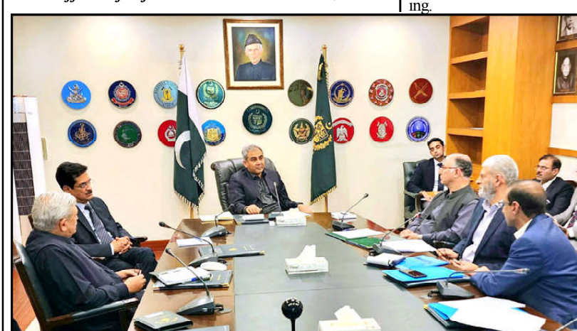
ISLAMABAD: Federal Minister for Interior Mohsin Naqvi chairing a meeting on matters related to Federal Investigation Agency.