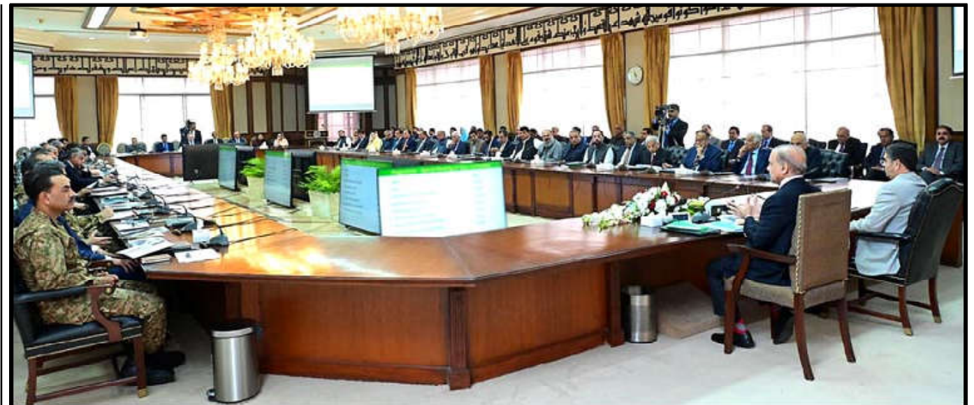
ISLAMABAD: Prime Minister Muhammad Shehbaz Sharif chairs special session of the Apex Committee of Special Investment Facilitation Council.

military action inside Afghanistan as a necessary message against increasing cross-border terrorism, the minister called on the Afghan interim regime to "control" the TTP and "not let them start a war" with Pakistan while living in Afghanistan. "We cannot continue like this," he said, adding that Islamabad will be forced to retaliate if the TTP continues its attacks. Elaborating on the prospects of bilateral trade and prospects of providing an economic corridor to Kabul, owing to the country being landlocked, Asif questioned why Islamabad should entertain such a possibility if the neighbouring country treats it "like an enemy".