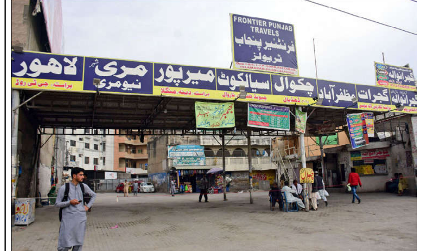
ISLAMABAD: Faizabad bus stands are deserted owing to Pakistan Day parade rehearsal, passengers suffering in the Federal Capital.

The police officials were further directed to ensure the data entry of all citizens entering the high security zone.