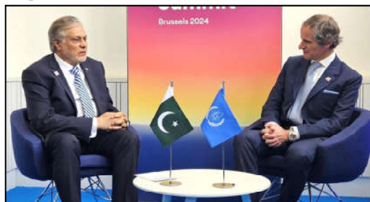
BRUSSELS: Foreign Minister Mohammad Ishaq Dar meeting with Director General, International Atomic Energy Agency (IAEA), Rafael Mariano Grossi, on the sidelines of the Nuclear Energy Summit in Brussels.

He revealed that nuclear energy constitutes around eight percent of our installed electric generation capacity as currently Pakistan has six operating nuclear power plants generating 3,530 MW of electricity. The Foreign Minister reaffirmed that Pakistan stands ready to share its experience and expertise in peaceful uses of nuclear technology with the world as country has fully trained human resource capable to support nuclear power infrastructure.