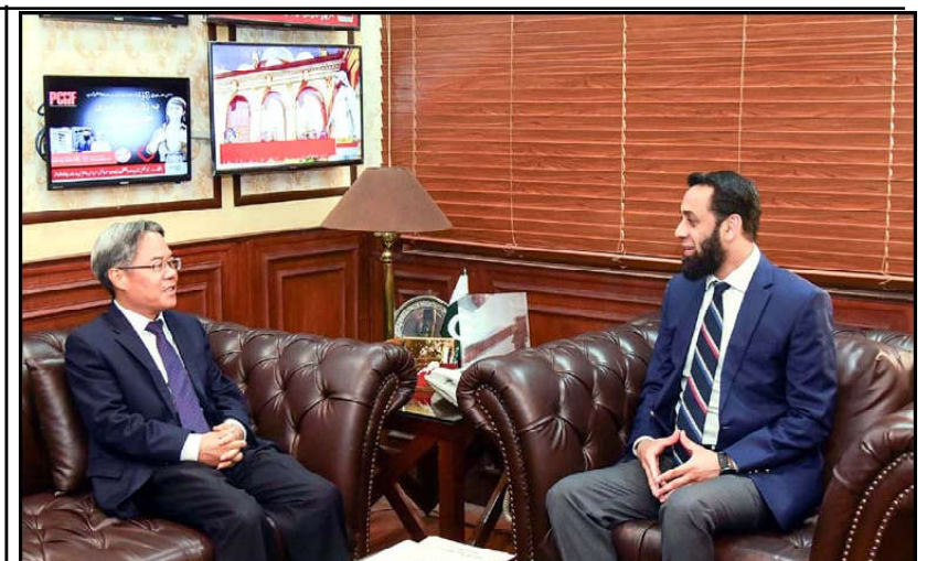
ISLAMABAD: Federal Minister for Information and Broadcasting, Attaullah Tarar exchanging views with Jiang Zaidong, Ambassador of the Peoples Republic of China during meeting held in Islamabad.