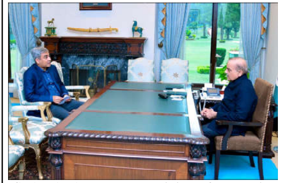
ISLAMABAD: Federal Minister for Interior, Narcotics Control and Chairperson Pakistan Cricket Board Syed Mohsin Raza Naqvi calls on Prime Minister Muhammad Shehbaz Sharif.

In his remarks, Ambassador Blome highlighted the importance of establishing robust ties to strengthen the relationship even further. He emphasized that economic development is the cornerstone of Pakistan-US relations with a renewed focus on groundwork to bolster ties and collaborate effectively towards fostering enhanced peace, prosperity, and regional stability. Following the talk, the participants engaged in an interactive discussion that focused on a range of subjects - including the situation in Afghanistan; peace, security and strategic stability.