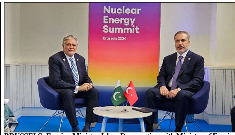
BRUSSELS: Foreign Minister Ishaq Dar meeting with Minister of Foreign Affairs of Türkiye Hakan Fidan on the sidelines of Nuclear Energy Summit 2024 in Brussels.

Chairman Ghani proudly announces WAPDA's implementation of the largest development portfolio, featuring eight transformative mega projects. These ambitious endeavors, including the Diamer Basha Dam, Mohmand Dam, Dasu Hydropower Project, and others, are poised to revolutionize Pakistan's economic landscape, providing essential water resources