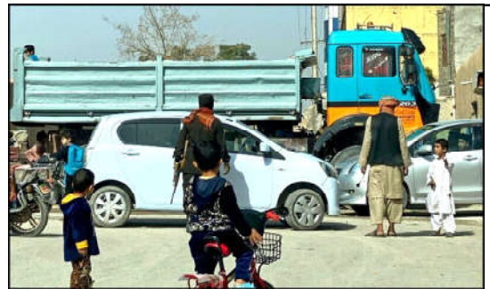
An Afghan security personnel checks a vehicle near the site of a suicide bomb attack in Kandahar.

Multiple countries have suspended their aid, and the UN has called for a ceasefire in Gaza.