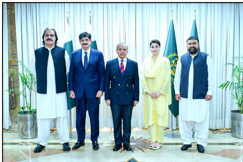
ISLAMABAD: Prime Minister Muhammad Shehbaz Sharif in a group photo with Chief Ministers of all the provinces.

The prime minister highlighted that annually hundreds of billions of rupees were lost in the State Owned Enterprises as PIA alone owed debt worth of Rs 825 billion. Likewise, he said that the interim government also signed many important agreements with different countries to bring investment in the country including that with the United Arab Emirates (UAE) valuing $10 billion.