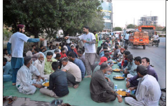
KARACHI: People break their fast during Iftar arranged by NGO during holy month of Ramazan at Press Club Chowrangi.

With these decisive measures and unwavering commitment to educational excellence, the prime minister's administration sets a strong precedent for the advancement of education, particularly in the vital field of medicine, in Azad Jammu and Kashmir.