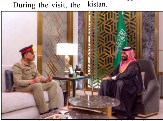
RIYADH: Chief of the Army Staff (COAS), General Syed Asim Munir exchanging views with Prince Mohammad Bin Salman Bin Abdulaziz Al Saud, The Crown Prince and Prime Minister of Kingdom of Saudi Arabia during meeting held in Riyadh.

The Army thanked the Saudi leadership for the warm sentiments and support for Pa-