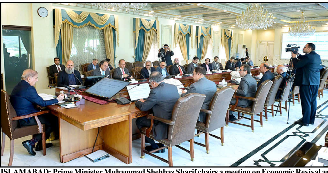
ISLAMABAD: Prime Minister Muhammad Shehbaz Sharif chairs a meeting on Economic Revival and