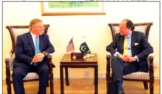
ISLAMABAD: Federal Minister for Finance and Revenue, Mr. Muhammad Aurangzeb was called on by H.E. Mr. Donald Blome, Ambassador of the United States of America & discussed matters of mutual interest, economic & financial relations between the two countries.

He thanked former Prime Minister Muhammad Nawaz Sharif for his strong public support to Kuwait's independence and sovereignty during the 1990-91 crisis.