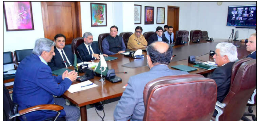
ISLAMABAD: Minister for Law and Justice Azam Nazir Tarar convened and chaired a meeting of Appellate Tribunal Inland Revenue at Law Ministry.