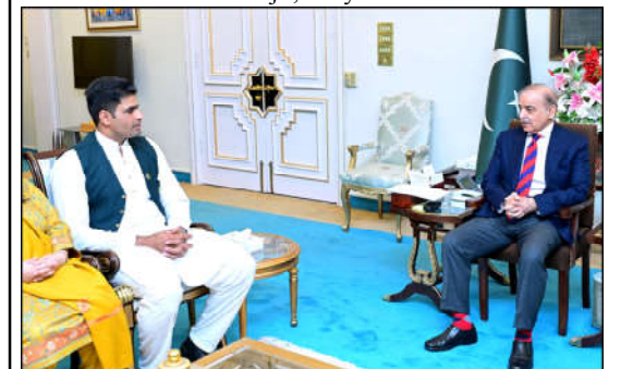
ISLAMABAD: Pakistani Athlete Arshad Nadeem calls on Prime Minister Muhammad Shehbaz Sharif.

he said that he started his career during 2012 and participated in the Youth festival afterwards, he participated in different world events in various categories and represented Pakistan. He termed his meeting with the prime minister as very constructive and highlighted various measures to promote sports in the country.