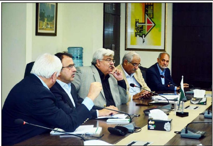
Federal Minister for Power, Sardar Awais Ahmad Khan Leghari, chairing a meeting with Power Planning and Monitoring Company in Islamabad.

Meanwhile, Sardar Awais Ahmed Khan Leghari, who has been assigned the portfolio of the Ministry of Power by the Prime Minister, is the architect of transformative sectoral reforms in Pakistan.