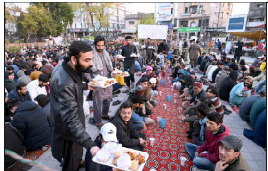
RAWALPINDI: Volunteers distribute food among the people in fast during the Holy Month of Ramadan at Satellite Town.