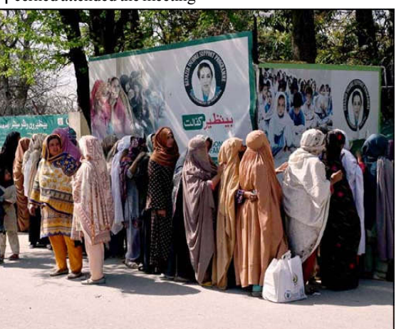
ISLAMABAD: A large number of women standing in a queue to draw money from Benazir Income Support Programme (BISP) beneficiaries outside Benazir One Window Center at G-7.