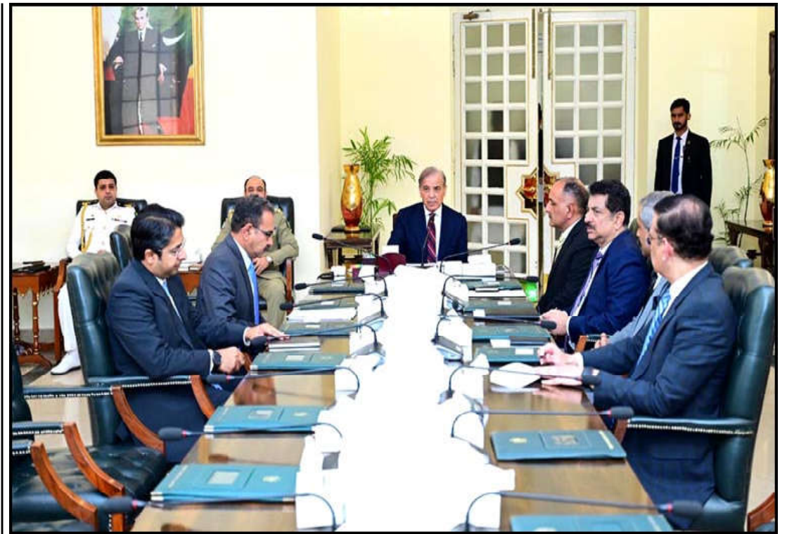
ISLAMABAD: Prime Minister Muhammad Shehbaz Sharif being briefed about the relief and rehabilitation activities in the wake of recent torrential rains as well as weather forecast and preparedness.

The meeting was further informed about the weather forecast during April to June and July to September in the current season and the preparedness of NDMA.