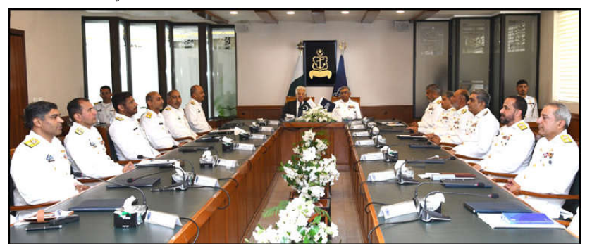
ISLAMABAD: Federal Minister for Defence Khawaja Muhammad Asif being briefed during his visit to Naval Headquarters.