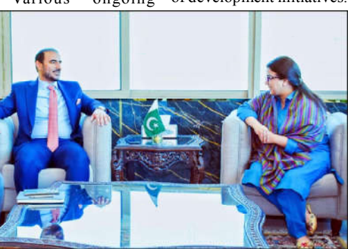
Minister of State for IT and Telecommunication Shaza Fatima Khawaja in a meeting with President and Group CEO PTCL Hatem Bamatraf in Islamabad.

The minister underscored the importance of maximizing benefits for farmers and boosting agricultural output to address food scarcity.