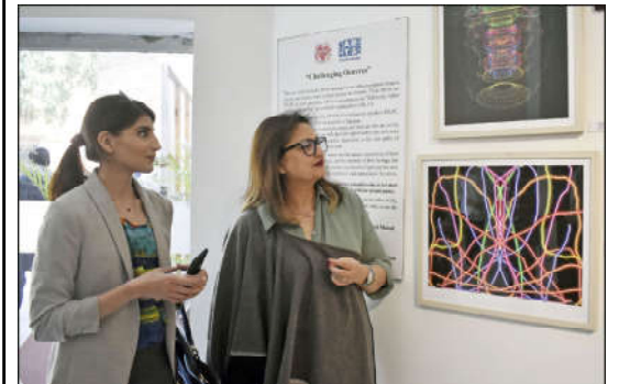
LAHORE: Visitors look at paintings in an exhibition at Al Hamra Art Council in the Provincial Capital.