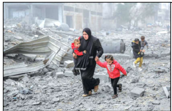
A Palestinian woman and children rush to safety after Israeli air strikes in Gaza City.