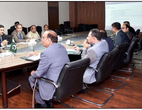
ISLAMABAD: Federal Minister for Science and Technology, Dr. Khalid Maqbool Siddiqui chairing a meeting.

made by the brave sons of Pakistan, according to police spokesman. More than just a song, "Jannat Se Bulawa" stands as a powerful testament to the resilience and commitment of the Islamabad Police in ensuring the safety and security of Pakistan. In commemorating March 23, the anthem embodies the essence of unity and strength, rallying all citizens to stand together in the face of challenges and uphold the values of peace, progress, and prosperity.