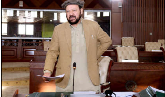
GILGIT: Chief Minister Gilgit-Baltistan Haji Gulbar Khan addressing during the 18th sitting of 18th Assembly session of Gilgit-Baltistan Assembly under the chair of Speaker Gilgit-Baltistan Assembly Nazir Ahmad Advocate.

forty people. Punjab Governor Muhammad Balighur Rahman said that we have to increase the number of trees and green areas in cities to eliminate the effects of environmental pollution. He said that I also ask the people of the province and especially the children to do your part in this campaign and do your part to make the country greener by planting more trees and focus on their growth along with planting to achieve the objectives of the plantation drive.