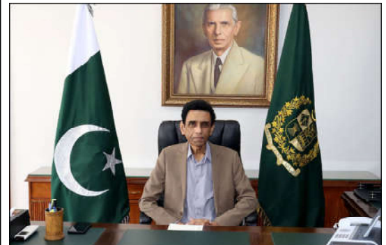
ISLAMABAD: Federal Minister for Education and Professional Training Dr. Khalid Maqbool Siddique officially assumed charge.

This distribution represents just one facet of Qatar Charity's broader commitment to humanitarian assistance and community development in the country and around the world.