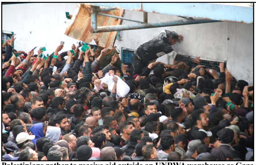
Palestinians gather to receive aid outside an UNRWA warehouse as Gaza residents face crisis levels of hunger, in Gaza City.