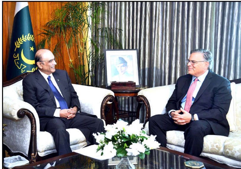
ISLAMABAD: The Ambassador of the United States of America to Pakistan, Donald Blome, calls on President Asif Ali Zardari, at Aiwan-e-Sadr.

rethink the policy of siding with Khwarij terrorists shedding the blood of innocent Pakistanis and to make a clear choice to stand with the people of Pakistan." "Terrorist groups like TTP are a collective threat to regional peace and security. We fully realize the challenge Afghan authorities face in combating the threat posed by TTP. Pakistan would therefore continue to work towards finding joint solutions in countering terrorism and to prevent any terrorist organization from sabotaging bilateral relations with Afghanistan," she added.