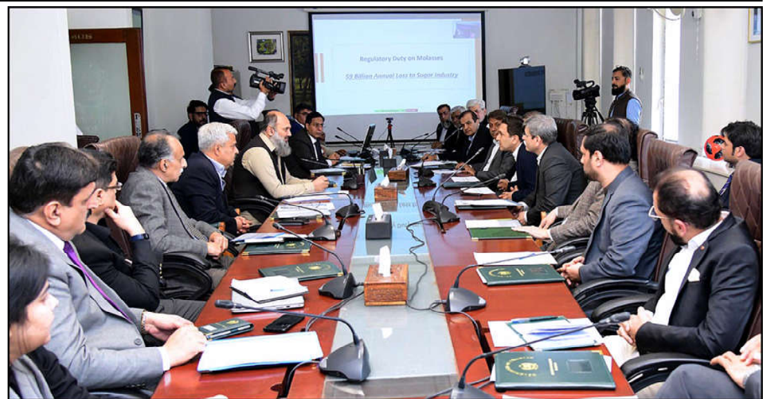
ISLAMABAD: Federal Minister for Commerce, Jam Kamal Khan, chairs significant meetings with representatives from the Sugar Mills Association and Ethanol Manufacturer Association to address pressing concerns affecting their industries.

terminal capacity, facilitating greater access to international markets. Conversely, representatives of the Ethanol Manufacturer Association emphasized the necessity of long-term policy measures to sustain the domestic ethanol industry. They advocated against allowing excessive Molasses exports, citing the adverse impact on local production.