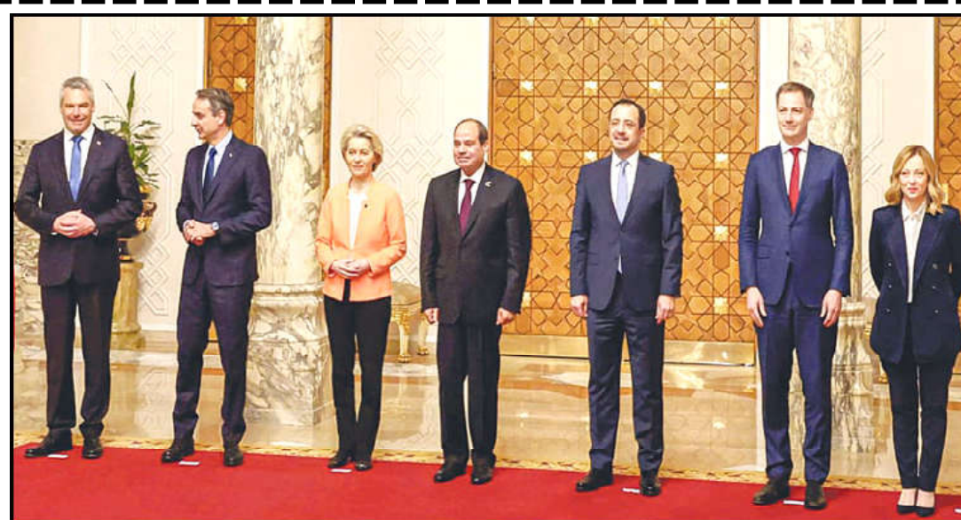
CAIRO: Austria's Chancellor Karl Nehammer, Greece's Prime Minister Kyriakos Mitsotakis, European Commission President Ursula von der Leyen, Egypt's President Abdel Fattah al-Sisi, Cyprus' President Nikos Christodoulides, Belgium's Prime Minister Alexander De Croo, and Italy's Prime Minister Giorgia Meloni posing for a photograph during their summit.

consolidated — no matter who wants to intimidate us, suppress us — nobody has ever succeeded in history, they have not succeeded now, and they will not succeed ever in the future," said Putin. Supporters chanted "Putin, Putin, Putin" when he appeared on stage and "Russia, Russia, Russia" after he had delivered his acceptance speech. Inspired by opposition leader Alexei Navalny, who died in an Arctic prison last month, thousands of opponents protested at noon against Putin at polling stations inside Russia and abroad.