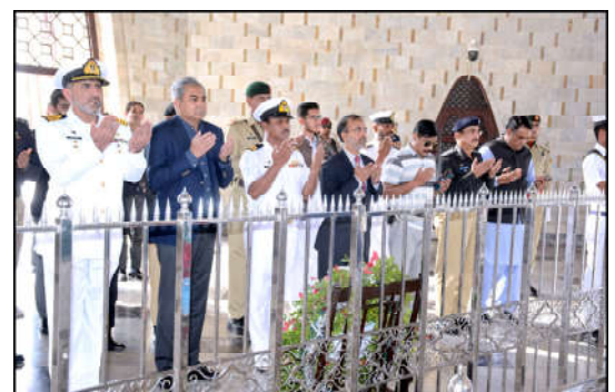
KARACHI: The Federal Minister for Interior Syed Mohsin Raza Naqvi offering Fateha at the mausoleum of father of the nation Quaid-e-Azam Mohammed Ali Jinnah during his first visit to the city.