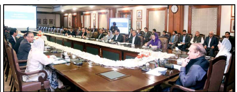
LAHORE: Punjab Chief Minister Maryam Nawaz Sharif and Quaid Muslim League-Nawaz Muhammad Nawaz Sharif chairing a meeting about transport