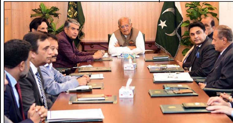
ISLAMABAD: Mian Riaz Hussain Pirzada, Federal Minister for Housing and Works, chaired a meeting of Federal Government Employees Housing Authority (FGEHA). Dr. Shahzad Khan Bangash, Secretary Housing and Works, was also present during the meeting.

As per federal legislative list parliament had no powers to determine prices of food items.