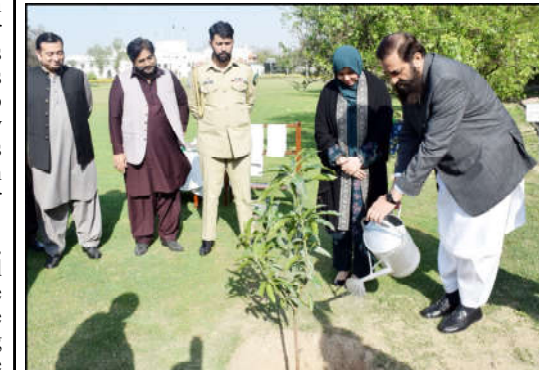
LAHORE: Punjab Governor Muhammad Balighur-Rehman along with his wife sapling a tree to inaugurate plantation campaign.