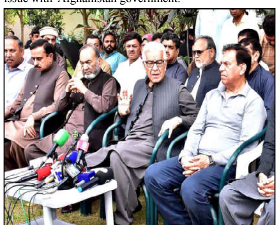
SIALKOT: Defense Minister Khawaja Muhammad Asif is addressing to the media at his residence.

To a question, he regretted that Afghanistan's soil is being used for terrorism in Pakistan. He said that some facilitators have been traced, and Pakistan has raised the issue with Afghanistan government.