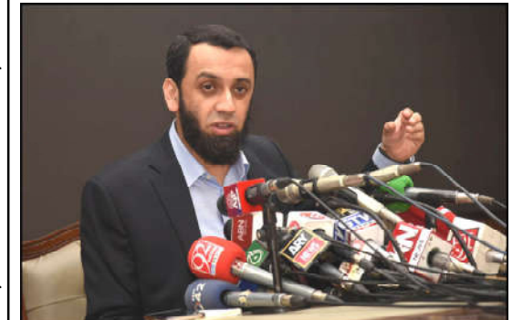
LAHORE: Federal Minister for Information and Broadcasting, Attaullah Tarar addressing a press conference at 180 h Model Town.

He said how painful and tragic it was for his family. "Law enforcement agencies, the people of Pakistan, politicians and almost every segment of society have rendered a lot of sacrifices in the war against terrorism," he added.