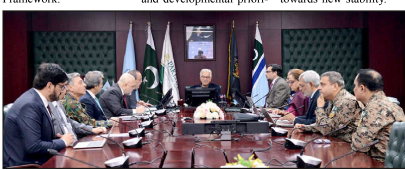
ISLAMABAD: Federal Minister Khawaja Muhammed Asif presided over meeting wherein he was given detailed briefing on role of Ministry of Aviation and it's attached entities.

He said the principles of development have drastically changed worldwide as artificial intelligence, big data, and automation are to determine the economic taking the entire system towards new stability.