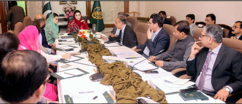
LAHORE: Chief Minister Punjab Maryam Nawaz presiding over a meeting meet dietary needs of comprehensive plan to regarding School Education.

schools across Punjab adding that it is the CEO. Maryam Nawaz right of every child studying in the government schools to possible steps for the acquire education revival of better and according to the quality education in international standard.