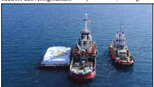
Aid ship sails, amidst a test to launch a new sea route from a port in Cyprus to deliver aid to residents of the Gaza Strip who are on the brink of famine, at sea.

"I do not want Emmanuel Macron to have free rein," RN chief Jordan Bardella said, accusing Macron of leading France onto an "irresponsible, dangerous path." Macron has pushed for the vote in a bid to try and alienate the far-right and far-left ahead of European parliamentary elections in June over their perceived less supportive positioning towards Ukraine.