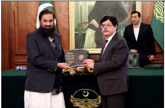
LAHORE: Ombudsman Punjab Major Azam Suleman Khan (R) Presented Annual Report 2023 to Governor Punjab.

emphasized that the Ramadan package includes a separate allocation for delivery costs. She stated that 75% of identified beneficiaries have been verified, ensuring efficient distribution. An hourly updated dashboard has been created for ration distribution, with over 55,853 packages already distributed. This initiative began with a pilot project due to the massive target of reaching 6.4 million people. The provincial minister highlighted that over 1.5 million families in Punjab have already received rations.