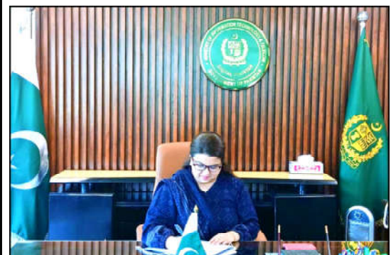
ISLAMABAD: Ms. Shaza Fatima Khawaja assumes charge as Minister of State for IT and Telecommunication.

On the occasion, she warned that the district administration would never compromise on the health of the citizens and strict action would be taken against those who were involved in making unhygienic or sub-standard food.