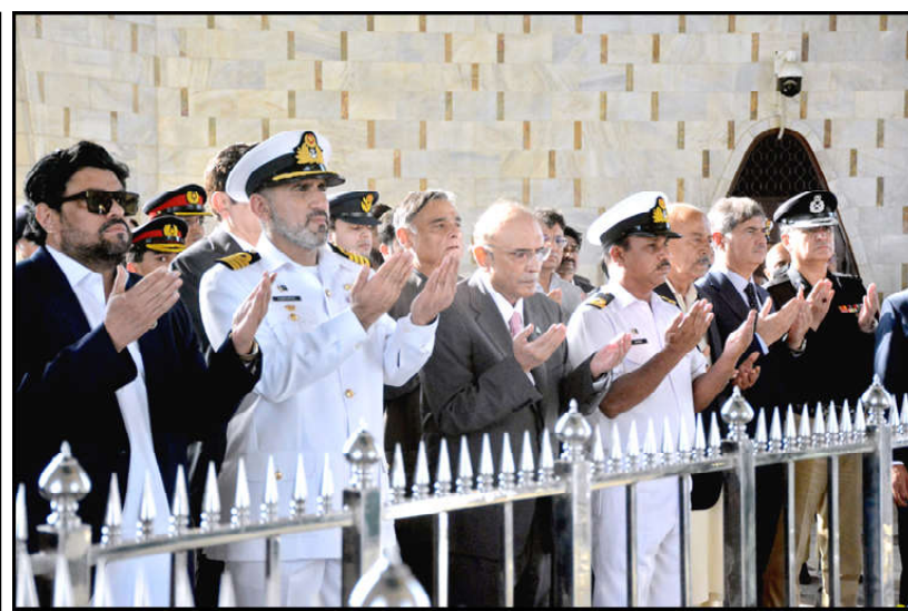
KARACHI: President Asif Ali Zardari offering Dua at the grave of Quaid-e-Azam Muhammad Ali Jinnah. Sindh Governor Kamran Khan Tessori and Sindh CM Syed Murad Ali Shah are also accompanied him.

ISLAMABAD (INP): Pakistan and International Monetary Fund (IMF) talks under the $3 billion Stand-By Arrangement (SBA) are likely to commence from March 15. According to media reports, the country's newly sworn-in Finance Minister Mohammad Aurangzeb has given the green signal for talks with the IMF for the SBA and a new loan programme. Islamabad will hold talks with the international lender about the last tranche of $1.1 billion under the SBA programme. Pakistan has already achieved the targets set by the IMF for the second review, the sources said. They further said Pakistan is likely to request IMF for a $6 to 8 billion fresh loan programme. Finance ministry sources said Islamabad will engage the IMF on the economic targets for the fresh loan programme. On March 8, the International Monetary Fund (IMF) said it is ready to send mission to Islamabad for the second economic review after the formation of PM Shehbaz Sharif's cabinet.