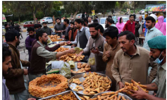
ISLAMABAD: Citizens purchasing snacks for fast-breaking in Federal Capital.

that the ministry accomplishes its mandate effectively.