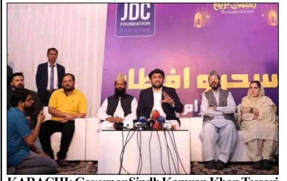
KARACHI: Governor Sindh Kamran Khan Tessori addressing the media persons during his visit to JDC Sehri Dastar Khawan.

He said that Sehat Card has been revived despite arrears of Rs. 18 billion on the system. He said that government would resolve the challenges to continue Sehat Card facility for betterment of people.