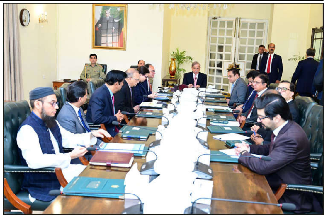
Prime Minister Muhammad Shehbaz Sharif chairs a meeting regarding IT and Telecom Sector in Islamabad.

The meeting was informed that during the previous year, an investment of $400 million was made in Pakistani startups.