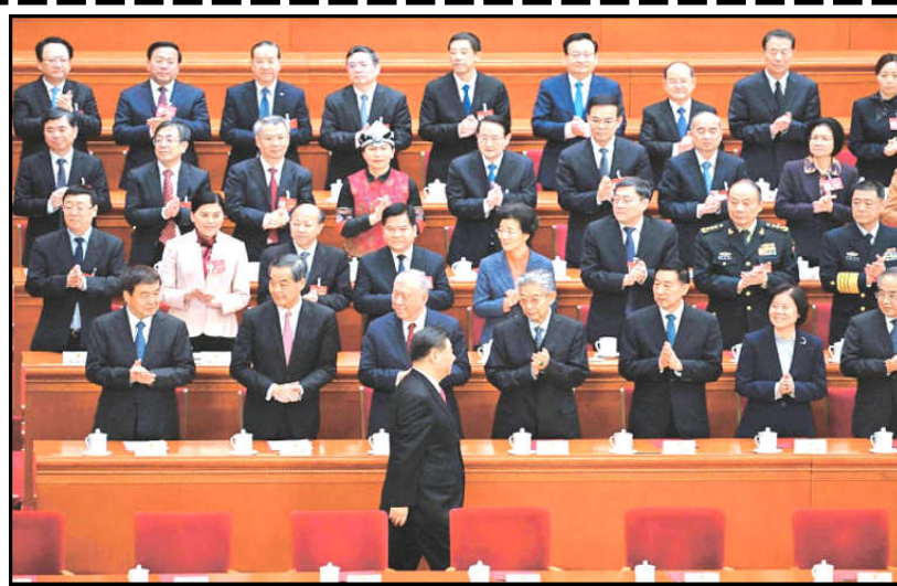
BEIJING: Delegates applaud as President Xi Jinping (centre) arrives for the closing session of the National Peoples Congress at the Great Hall of the People.

The UN chief recalled heartfelt pleas from families affected by the conflict, quoting a family member who said, "We are not here for condolences. We are not here for apologies. We are here for immediate action."