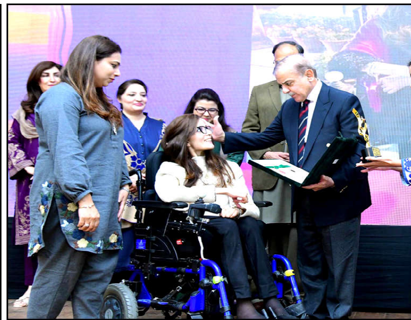
ISLAMABAD: Prime Minister Muhammad Shehbaz Sharif distributing Khatoon-e-Pakistan Awards among the high achievers women in their respective fields on the eve of International Women Day.

that their previous government passed the law for the inheritance of women, launched Zewar e Taleem programme to retain girl students in schools by giving them scholarships, adding the programme was a great success story and helped in spreading education. Similarly, Punjab Education Endowment Fund distributed Rs 20 billion among brilliant students who achieved distinction in their education, he said. He said now the government would establish the Pakistan Education Endowment Fund to support students who excel in their studies but have limited resources to continue further. His previous government in Punjab also trained youth through vocational programmes in different areas with the cooperation of United Kingdom's Department for International Development, he recalled. "We have to take forward these programmes so that the nation can move ahead and achieve prosperity."