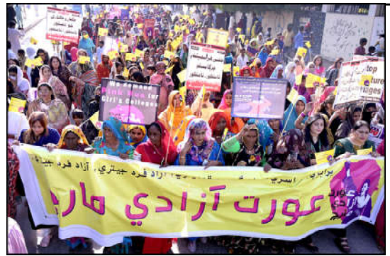
HYDERABAD: Large number of women participating in a rally in connection of International Women's Day at Thandi Sarak.