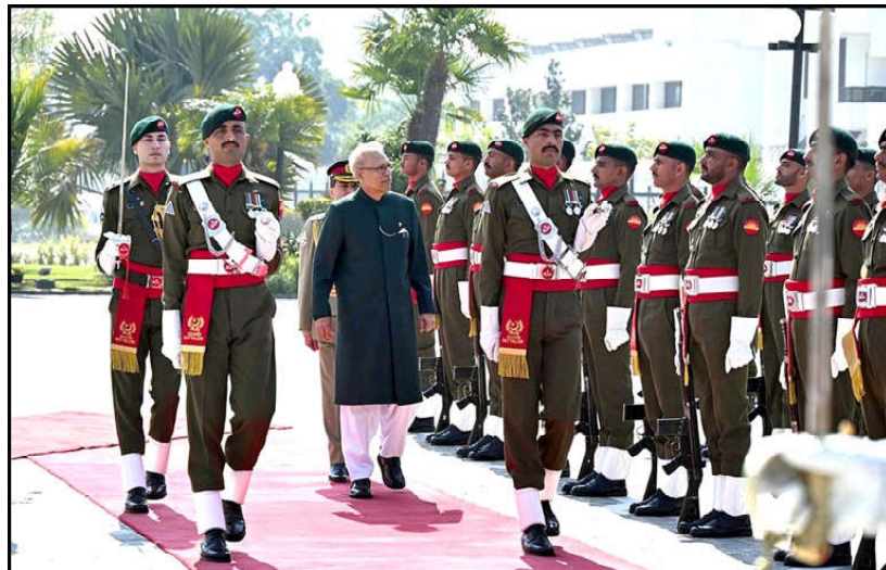
ISLAMABAD: President Dr Arif Alvi being presented with the farewell Guard of Honour, at Aiwan-e-Sadr.

He advised the opposition to realise importance of the matter and instead of opposing for the sake of opposition, should add its voice for the promotion, protection and well-being of the women of Pakistan.