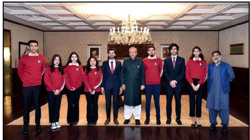
ISLAMABAD: President Dr. Arif Alvi in a group photo with a delegation of students from the Lahore University of Management Sciences (LUMS), who won the Best Small Delegation Award for Pakistan at the Harvard National Model United Nations USA, at Aiwan-e-Sadr.

Pak Secretariat and Minister Enclave, located in the high security zone. The senior police officers directed the officers and officials to ensure the security of important government offices, and superior courts, located in the high-security zone, he said and added, they further directed them to perform their duties with utmost dedication to uphold peace and security, with no room for negligence or complacency during duty hours. The Islamabad Police, he said is taking all possible measures to protect the life and property of the citizens.