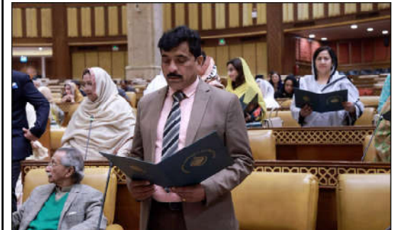
LAHORE: MPAs elected on minority special seats taking oath during Punjab Assembly Session.

She announced to evolve zero tolerance policy against harassment