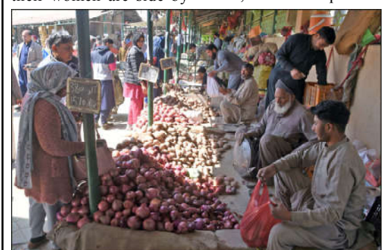
ISLAMABAD: People are busy buying vegetables in Friday Weekly Bazaar.

"SBP considers it imperative to support the career progression of the women employees and encourage them to aim for leadership position with the hope that in the coming years women in leadership position should become the norm, not the exception".