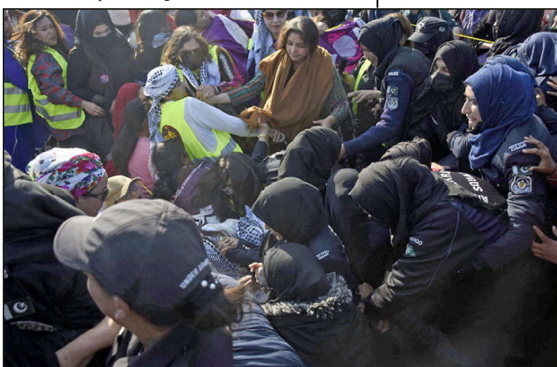
ISLAMABAD: Women activists scuffle with police personnel during Aurat March, a demonstration rally, to mark the International Women's Day, in the Federal Capital.

He further said several members of SJC demanded for initiating premature proceedings against me before registering complaints against me. How can SJC change the resignation into dismissal from service.