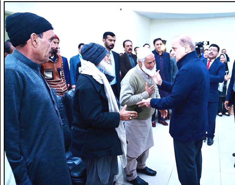
MUZAFFARABAD: Prime Minister Muhammad Shehbaz Sharif interacting with the families of the deceased and injured in the wake of recent torrential rains and heavy snowfall.

"As yet no one was elected on those reserved seats and without nominations and proper election on these seats, if the presidential election is conducted as per the schedule that would be denial of their votes, which otherwise is against the fundamental rights, law and constitution," stated the letter. "Under the above circumstances, it is submitted that the proposed election to the office of the President of Pakistan is clearly impossible, therefore the same may kindly be postponed or delayed till completion of electoral college accordingly in the best interest of justice, fair play and equity."