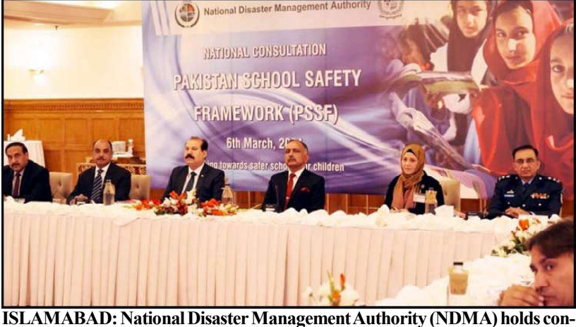
sultation session on Pakistan School Safety Framework held at local hotel

release said. The reduction in sentence would not apply to the prisoners involved in murder, espionage, and anti-State