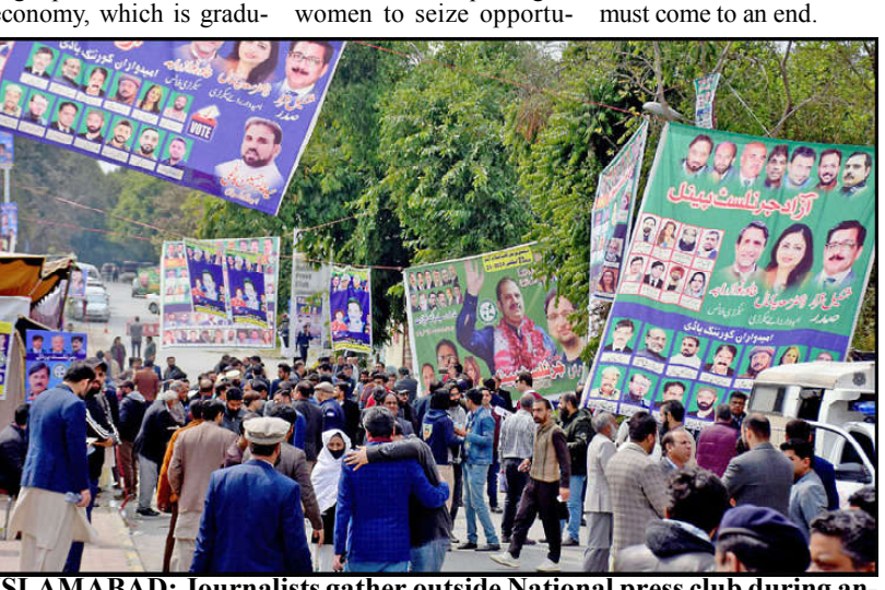
ISLAMABAD: Journalists gather outside National press club during annual election of NPC, in the Federal Capital.

Meanwhile, Farzana Bari, a renowned Gender Expert and Human Rights Activist, addressed the seminar shedding light on various critical issues faced by women in contemporary society. Highlighting the pervasive challenges confronting women, including domestic violence, early marriage, and nutritional deficiencies, she emphasized the systematic discrimination against women, characterizing their treatment as that of second-class citizens must come to an end