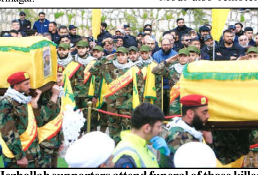
Hezbollah supporters attend funeral of those killed in Israeli bombardment.

police and paramilitary forces were deployed, and checkpoints set up across Modi also remotely