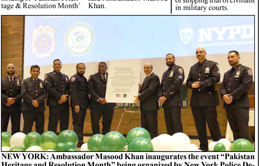
Heritage and Resolution Month" being organized by New York Police De-

They have endured widespread devastation and confronted obstacles that impede their access to essential needs and their ca-