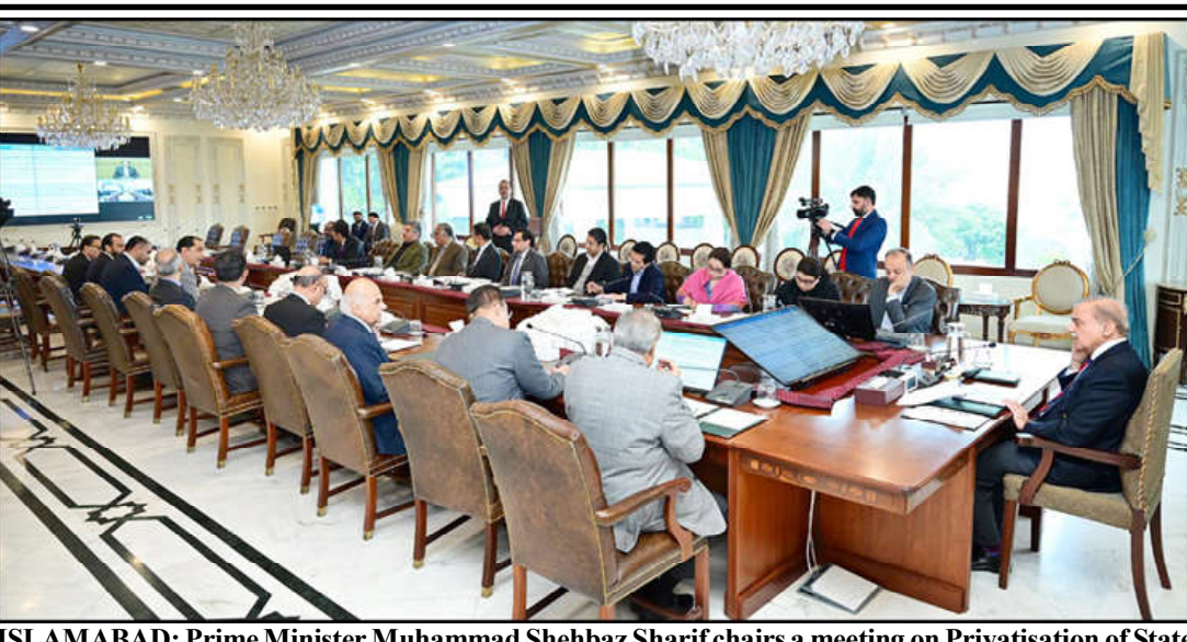
ISLAMABAD: Prime Minister Muhammad Shehbaz Sharif chairs a meeting on Privatisation of State Owned Enterprises.

He also stressed to ensure transparency of the privatisation process at the institutional level and to effective international standards of