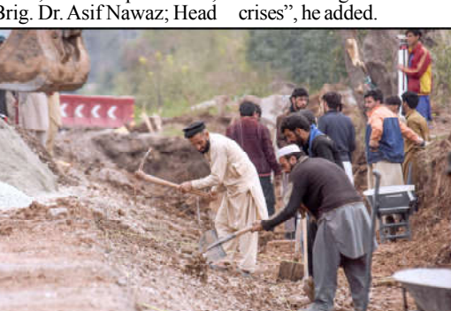
ISLAMABAD: Labourers working on expansion of Chak Shahzad Road in the Federal Capital.

the people of Gaza. He emphasized the urgent need to end the blockade in Rafah/ Gaza and establish safe humanitarian corridors for the seamless supply of medical aid, food, and the safe evacuation of the wounded We welcome the private sector's collaboration in providing much-needed medical assistance to Gaza, acknowledging the crucial role it plays in addressing humanitarian