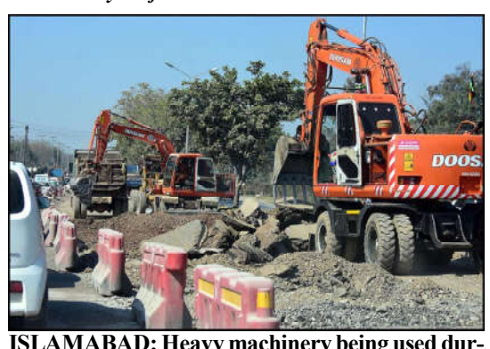
ISLAMABAD: Heavy machinery being used during the extension of Park road.