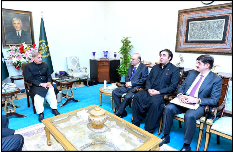
ISLAMABAD: Former President Asif Ali Zardari, Chairman Pakistan People's Party Bilawal Bhutto Zardari and Chief Minister Sindh Syed Murad Ali Shah call on Prime Minister Muhammad Shehbaz Sharif.

Vol. XIV No. 54 Reg. mails-B / ID-445 Wednesday March 06, 2024, Shaban 24, 1445 A.H. Ph: 2158688, 2158997 Pages 4: Rs. 12