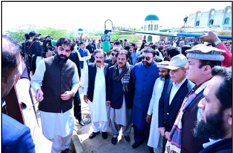
GWADAR: Prime Minister Muhammad Shehbaz Sharif being briefed regarding the damages caused by the recent torrential rains and the relief and rescue operations carried out by the local authorities