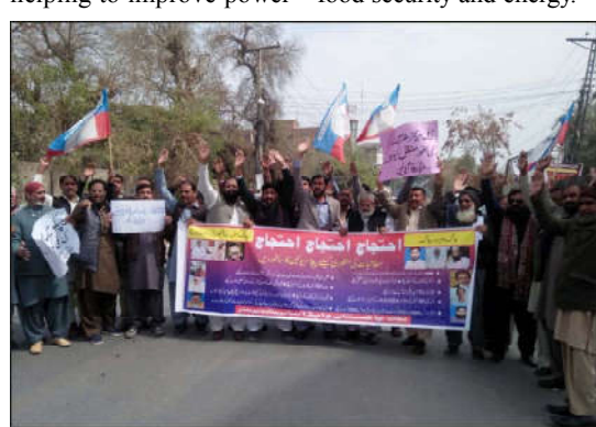
MULTAN: Members of Pakistan Wapda Employees Pegham Union are holding protest demonstration for acceptance of their demands, at Multan press club.

The Facilitation Centre has been established as part of the U.S. government's ongoing assistance in Pakistan's energy sector. Since 2014, the United States has supported Mepeco in deploying more than 40,000 smart meters, helping to improve power