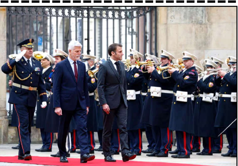
Czech Republic's President Petr Pavel and French President Emmanuel Macron walk past an honour guard at Prague Castle in Prague, Czech Republic.

In addition to trucks carrying aid through two border crossings in the south of Gaza, the US military, along with allied nations, has in recent days dropped aid packages into Gaza from aircraft, amid warnings much of the population is on the verge of famine. European Union members, the United States, Britain, Ukraine, Australia, Canada, New Zealand and