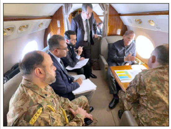
GWADAR: Prime Minister Muhammad Shehbaz Sharif being briefed regarding the damages caused by the recent torrential rains and the relief and rescue operations carried out by the local authorities in Gwadar.

monumental and unending sufferings imposed on the Palestinian people in Gaza," Ambassador Akram said. "This situation has resulted in the colossal loss of lives and wanton destruction of homes, schools, hospitals and religious sites in Gaza, due to the incessant attacks by the Israeli occupying power on the territory." At the same time, Ambassador Akram warned against the looming risk of widespread starvation in Gaza due to insufficient food supplies and essential services, as he reiterated the call for a ceasefire to allow humanitarian supplies into Gaza. "Notwithstanding the foregoing efforts by the various actors within the United Nations as well as members of the international community, there are ominous signs of even greater dangers ahead," he noted, referring to In UNRWA's report on the impact of Israel's recent calls to dismantle the agency and for donors to freeze their funding to it. In this regard, he said there was an imminent threat of mass starvation in the Gaza Strip, due to inadequate food supplies and essential services for the teeming number of Palestinian in the occupied Palestinian territory.