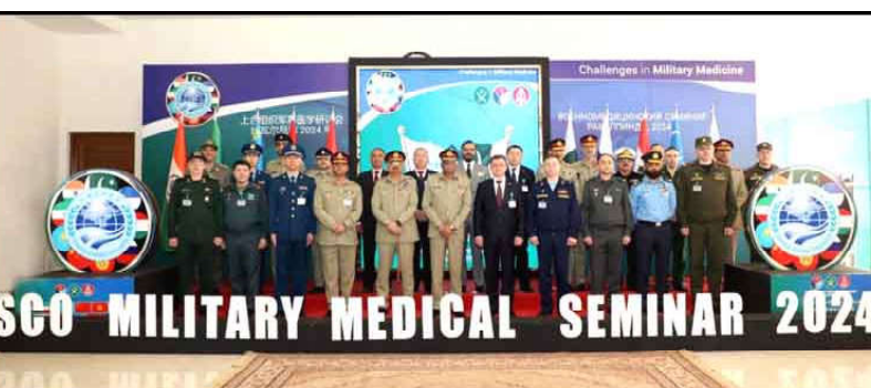
CJCS reiterated that both Pakistani nation and Pakistan Armed Forces take great pride in our partnership with SCO and are fully committed to further expand this cooperation.

RAWALPINDI (Online): General Sahir Shamshad Mirza, Chairman Joint Chiefs of Staff Committee (JCSC), Tuesday attended the opening session of SCO Members States Seminar being hosted by Pakistan at Rawalpindi on theme of "Challenges in Military Medicines". The Chairman JCSC in his address highlighted that emergence of new and complex healthcare challenges, Pandemics and humanitarian crisis merit crafting of collective preparedness, response strategies and more importantly strengthening of multilateral collaboration amongst SCO nations especially in field of military medicines.