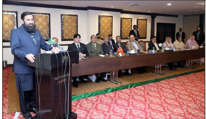
LAHORE: Governor Punjab Muhammad Balighur Rahman addressing a seminar on education and literature held at a local hotel.