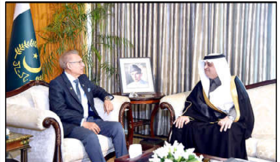
ISLAMABAD: The Kingdom of Saudi Arabia's Ambassador to Pakistan, Nawaf bin Said Al-Malki, call on President Dr Arif Alvi, at Aiwan-e-Sadr.

Terms Maryam's election as first woman CM Punjab a 'milestone' WASHINGTON (INP): The United States of America (USA) on Tuesday expressed willingness to collaborate with Pakistan's new Government. In a recent press briefing, United States Department of State Spokesperson Matthew Miller conveyed the US's readiness to engage with Pakistan's new government. Matthew Miller highlighted the US's willingness to work closely with the newly formed Pakistani government, emphasizing the importance of advancing mutual interests through collaboration with Prime Minister Shehbaz Sharif. The spokesperson further said that appointment of Maryam Nawaz Sharif as the Chief Minister of Punjab represents a significant development in Pakistani politics. The US looks forward to the full inclusion of women in political life and views it as a positive step for Pakistan's democratic progress.