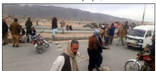
QUETTA: Residents of Sariab protesting against shortage of gas by blocking the Sariab Road.

"We ought to complete the work of assessing the impact of the bank's projects on the lives of the people," he underscored.