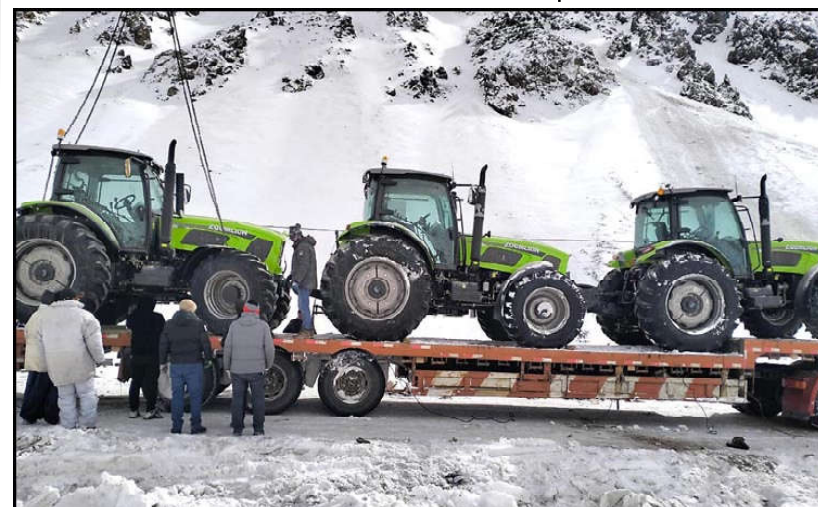
ISLAMABAD: National Logistics Corporation (NLC) in coordination with local administration recovered the last Chinese vehicle that overturned due to heavy snowfall at Khunjerab pass

Independent Report LAHORE: Punjab Chief Minister Maryam Nawaz Sharif reviewed the distribution and monitoring of Ramadan Nigahban Relief Programme, here on Tuesday. Presiding over a meeting, the CM said the process of delivering peoples' right to their doorsteps has begun, adding that distribution of big gifts to the people of Punjab on the occasion of Ramadan has commenced. The meeting was briefed by the authorities concerned that a fool-proof system has been developed to ensure transparent distribution of the largest Ramadan relief package to the beneficiaries. The distribution is being monitored with the help of a live dashboard and advanced technology. A helpline has been set up which will be formally launched tomorrow. Beneficiaries will be able to register complaints through the helpline. The chief minister was apprised that data of NADRA (National Database and Registration Authority) and BISP (Benazir Income Support Programme) beneficiaries is being used for the distribution of Ramadan Nigahban relief packages. It was further briefed that the distribution of Ramadan relief packages will officially start from 2nd of Ramadan, and will be completed by 10th of Ramadan. For the first time in the history of Punjab, Ramadan package is being delivered to every deserving person's home. The CM directed to ensure high quality of Ramadan package items. "I will not tolerate complaints about the quality of flour, ghee, sugar and other food items," she said.