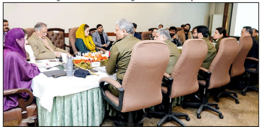
LAHORE: Chief Minister Punjab Maryam Nawaz presides over the meeting regarding Traffic Management.