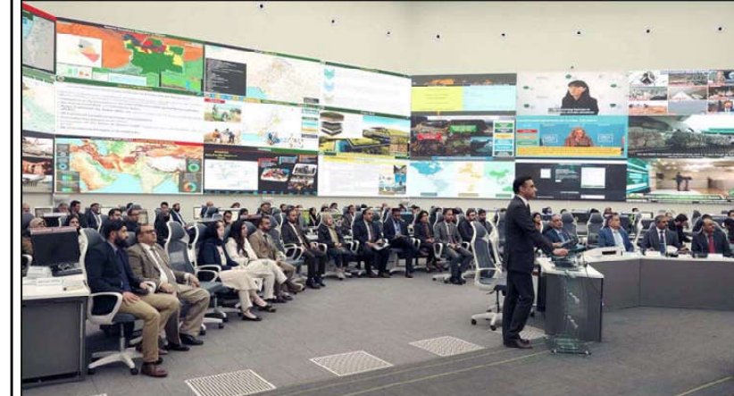
ISLAMABAD: Chairman NDMA Lt. Gen. Inam Haider Malik inaugurates "Spring Thaw 2024" National SimEx Conference at NDMA Headquarters.

ISLAMABAD (APP): The Utility Store Corporation (USC) is all set to launch Rs 7.5 billion Prime Minister's Ramazan Relief Package 2024 on Tuesday (March 5). The prime minister had announced a special subsidy of Rs 7.5 billion to provide edible items to the people subsidized prices during the holy month of Ramazan, a USC spokesman said on Monday. Under the package, he said, the USC would give subsidy on 19 basic food items, including flour, ghee, edible oil, sugar, pulse gram, white gram, besan, dates, rice, tea, spices, milk and beverages.