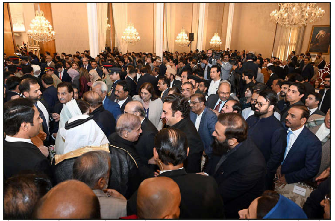
ISLAMABAD: Chairman Pakistan People's Party Bilawal Bhutto Zardari, shake hand with, Prime Minister Mian Muhaamad Shabbaz Sharif after the oath taking ceremony, at President House in the Federal Capital.

said that Zulfiqar Ali Bhutto decided to use our resources for the betterment of Muslim countries and he united the Muslim countries but unfortunately, he was hanged. He urged the government and masses to stay within your resources to get rid of foreign loans, adding that only this way we can get honor in the world. Senator Mohsin Aziz said that we should probe the issues within the Muslim Ummah as without resolving these issues, we cannot make progress and stand at the international level with honor. Senator Mohammad Humayun Mohmand said that Palestinian-injured Children were being operated on without anesthesia which is so painful that a human cannot bear it.