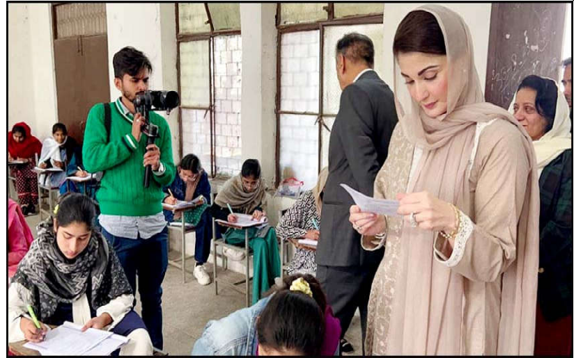
LAHORE: Punjab Chief Minister Maryam Nawaz visiting a Primary School