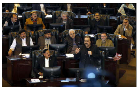
PESHAWAR: Ali Amin Gandapur speaks on the assembly floor after being elected as Chief Minister of Khyber Pakhtunkhwa, at KP Assembly in Peshawar.

will be made for bringing reforms in system of justice and accountability in the province. He said laws will be enacted from this assembly for curbing corruption in society. He said terrorism has badly affected the province and efforts will be made for lasting peace. Ali Amin Gandapur said the new provincial government would expand the tax base to increase revenue collection. He said tourism and mining will be promoted for the development of the province. Ali Amin Gandapur said job opportunities will be created for the youth. Speaking on this occasion, opposition leader Ibadullah Khan said all out cooperation will be extended to the government for welfare of the people.