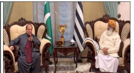
ISLAMABAD: PML-N Quaid Mian Muhammad Nawaz Sharif held a meeting with JUI-F Chief Maulana Fazl-ur-Rehman and discuss political situation of country.