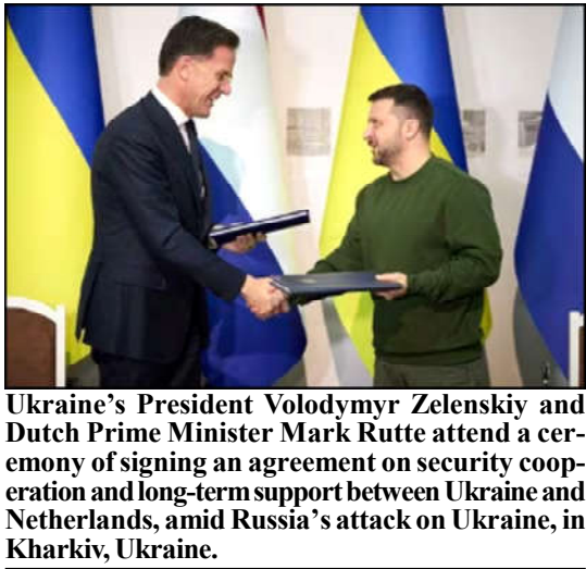
Ukraine's President Volodymyr Zelenskyy and Dutch Prime Minister Mark Rutte attend a ceremony of signing an agreement on security cooperation and long-term support between Ukraine and Netherlands, amid Russia's attack on Ukraine, in Kharkiv, Ukraine.

Monitoring Desk DHAKA: A massive fire in Bangladesh that raged through a six-storey building home to restaurants where many families with children were dining has killed at least 46 people and injured dozens, the health minister said on Friday. Fire authorities said a gas leak or a stove could have caused Thursday's blaze in the capital, which spread quickly after breaking out in a biryani restaurant, and was only brought under control following two hours of effort by 13 units of firefighters. Hospitals were treating 22 people with burns, Health Minister Samanta Lal Sen told reporters. "All 22 people [...] are in critical condition," Sen, himself a well-known physician, said after a visit to the Dhaka Medical College Hospital. "We are trying our best to save their lives," he said. Prime Minister Sheikh Hasina expressed shock and sorrow at the incident, ordering swift treatment for the injured. She urged adherence to construction rules and regulations, including requirements for essential safety features such as fire exits and ventilation systems to prevent such tragedies in the future. One survivor, Mohammad Altaf, recounted his narrow escape from the blaze that killed two colleagues. "I went to the kitchen, broke a window and jumped to save myself," he told reporters, adding that a cashier and server who urged people to leave during the first moments had died later.