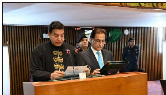
ISLAMABAD: Raja Pervaiz Ashraf administered the oath to Sardar Ayaz Sadiq as Speaker National Assembly.

the speaker. Sadiq had served as the speaker from 2013-2018 in the 14 th National Assembly. The polling for the election of the National Assembly speaker has been completed and the counting of votes is underway in the session that has been marred by protests of the Sunni Ittehad Council (SIC) lawmakers. Sadiq will now be administered oath by outgoing Speaker Raja Pervaiz Ashraf. After the oath-taking, the new speaker will then take charge of the house forthwith. Ashraf will, subsequently, step down from his position. As the first order of business Sadiq will now hold elections for his deputy. Pakistan Peoples Party's (PPP) Syed