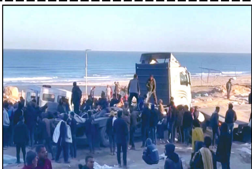
Palestinians transport casualties following Israeli fire on people waiting for aid in Gaza City.

Monitoring Desk CAIRO: Gaza health authorities said Israeli forces on Thursday (Feb 29) shot dead more than 100 Palestinians as they waited for an aid delivery, but Israel blamed the deaths on crowds that surrounded aid trucks, saying victims had been trampled or run over. At least 112 people were killed and more than 280 wounded in the incident near Gaza City, Palestinian health officials said. The loss of civilian lives was the biggest in weeks. Hamas said the trucks were operated by private contractors as part of an aid operation that it had been overseeing for the past four nights. One Israeli official said there had been two incidents, hundreds of metres apart, in the first of which dozens were killed or injured as they tried to take aid from the trucks and were trampled or run over. He said there was a second, subsequent incident as the trucks moved off. Some people in the crowd approached troops who felt under threat and opened fire, killing an unknown number in a "limited response", he said. He dismissed the casualty toll given by Gaza authorities but gave no figure himself. In a later briefing, Israel Defense Forces spokesman Rear Admiral Daniel Hagari also said dozens had been trampled to death or injured in a fight to take supplies off the trucks.