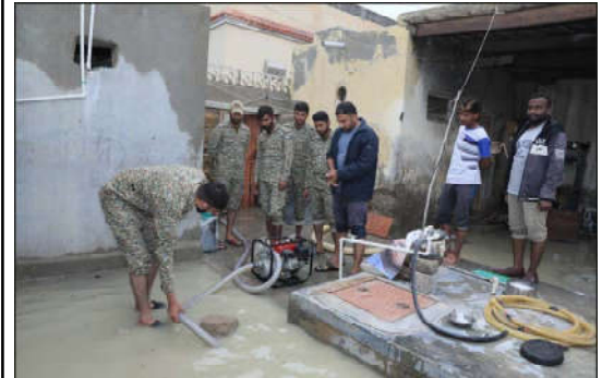
Pakistan Navy Workers during Rescue efforts at flood affected areas of Gwadar.