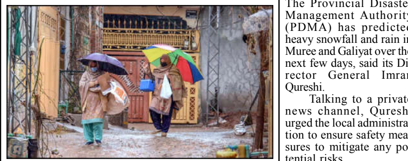
ISLAMABAD: Lady Health Workers on the way under cover of umbrella to protect from rain while visiting home to home to administer polio drops to children at Tarlahi during anti polio campaign.

ISLAMABAD (APP): The Capital Development Authority (CDA) and Punjab Information Technology Board (PITB) Friday signed an agreement to digitise all office working of the authority. Under the agreement, a modern property management system will be introduced to computerise the property record of the citizens. According to the details, the e-office will be established as per the agreement between the Capital Development Authority and PITB. In order to ensure transparency in all information related to the property, it is possible to get rid of record tampering, including record missing or record leaking and the land or property record can also be saved in a modern way, an official of the CDA said. "Besides, the aim of this initiative is to empower the Capital Development Authority (CDA) by equipping it with modern tools and technology in the realm of 'smart governance', the official said. He said that by using the latest tools, the Capital Development Authority aims to enhance its decision-making process and ultimately achieve e-empowerment for the authority so that all citizens and applicants can be facilitated for speedy processing of their allotment.