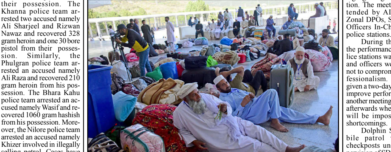
ISLAMABAD: Peoples along with their belongings waiting for a security check at the grand Faisal Mosque on Sundy, to start Itikaf during the holy month of Ramadan in Federal Capital.

ticularly in Neelum valley heavy rainfall occurred overnight. Snowfall persisted in tourist destinations such as Upper Neelam, Luwat, Sharda, and Arang Kel.