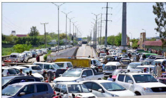
ISLAMABAD: A view of traffic jam at due to wrongly parked vehicles alongside of a road the Federal Capital.

The Ministry of Overseas Pakistani and Human Resource Development reiterates its commitment to spearheading initiatives that fortify global employment prospects for Pakistanis.