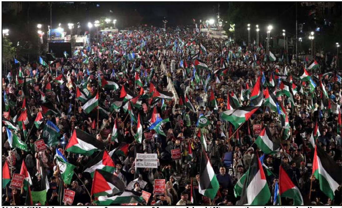
KARACHI: A large number of supporters of Jamat-e-Islami (JI) are gathered to attend rally against Israeli cruel and inhumane acts and express unity with the innocent people of Palestine, at Shahrah-e-Ouaideen in Karachi.