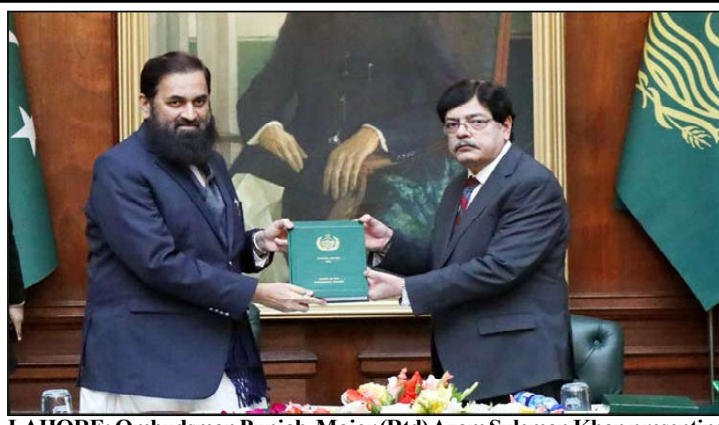
LAHORE: Ombudsman Punjab, Major (Rtd) Azam Suleman Khan presenting annual performance report of the Office to Governor Punjab Muhammad Balighur Rehman during a ceremony.

initiatives like complete digitalization of the Ombudsman Punjab office. He said that extending the offices of the Punjab Ombudsman to various districts and providing maximum relief to the people was commendable. Governor Punjab said that the decisions of the provincial ombudsman are written in Urdu which is easy for people to understand and they do not need to hire any lawyer for it. Governor Punjab further said,