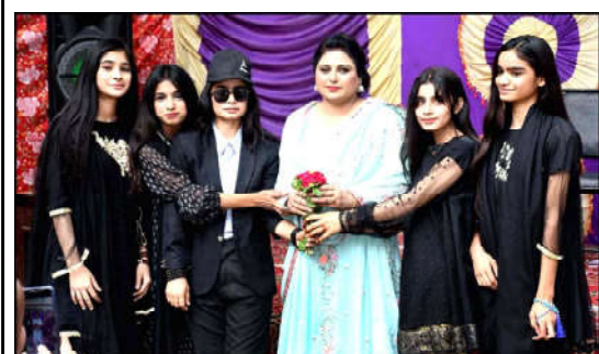
LARKANA: Student presents a bouquet to her teacher during a function at Govt little folks Girls High School Jinnah Bagh.