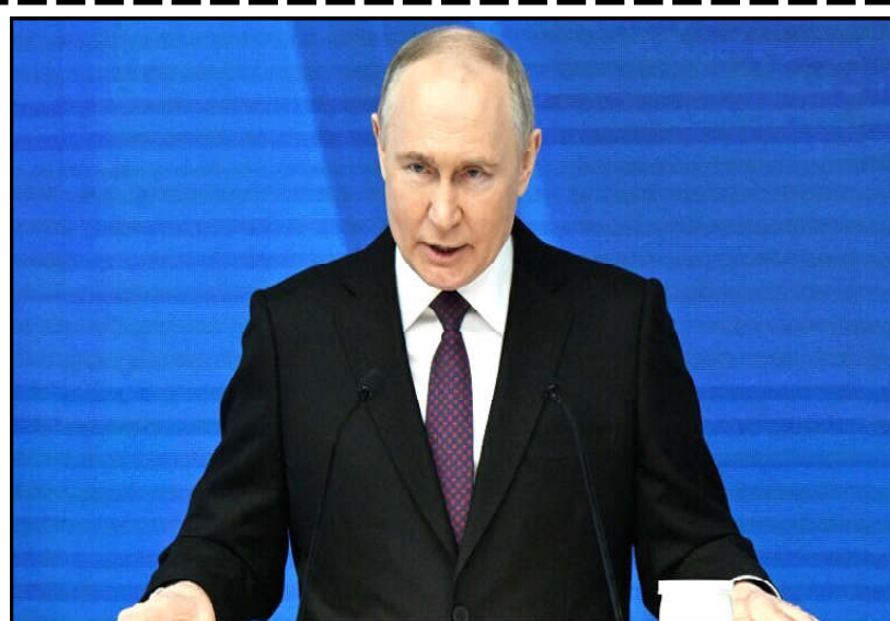
Russian President Vladimir Putin delivers his annual address to the Federal Assembly, in Moscow, Russia.