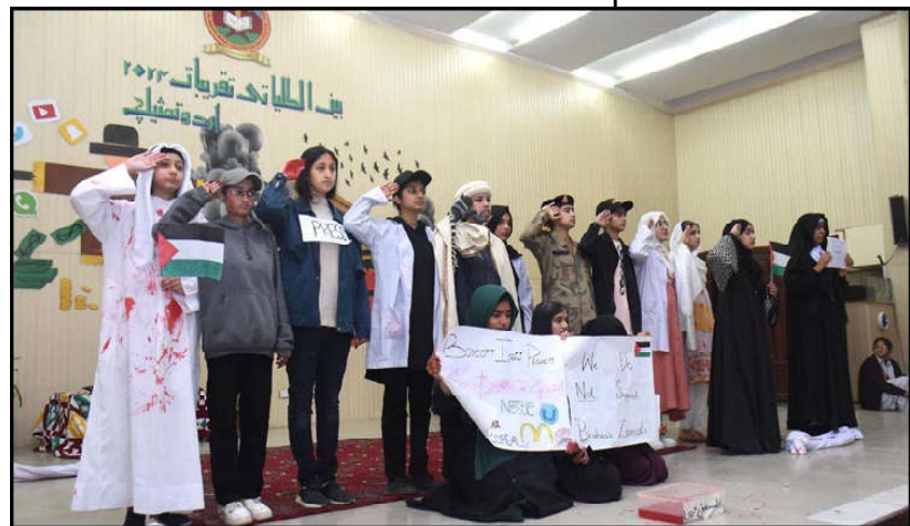
ISLAMABAD: Students of Model College F-7/2 performing in Annual Drama competition.

terial and personnel entering the area. Moreover, no politi-