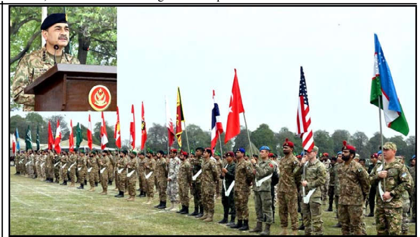
Chief of the Army Staff, General Syed Asim Munir addressing the closing ceremony of the Seventh Pakistan Army Team Spirit Exercise-2024 at Kharian.