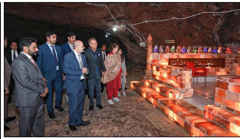
KHEWRA: President Dr Arif Alvi being briefed about salt mining during his visit to Khehra Salt Mine.

He went on to say distribution of posts is not acceptable to people.