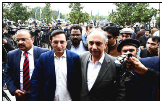
ISLAMABAD: Newly elected Members of National Assembly Omar Ayub Khan and Barrister Gohar Khan arrives to attend 1st session of 16th National Assembly at Parliament House.

KARACHI (APP): The total liquid foreign reserves of Pakistan stood at US$ 13,038.5 million in the week ended on February 23, 2024 while foreign reserves held by State Bank reached $ 7,949.6 million. The State Bank of Pakistan, in a statement issued here on Thursday, informed that foreign exchange reserves held by the central bank decreased by $ 63 million to $ 7,949.6 million due to debt repayments during the week under review. Meanwhile net foreign reserves held by commercial banks stood at $ 5,088.9 million.