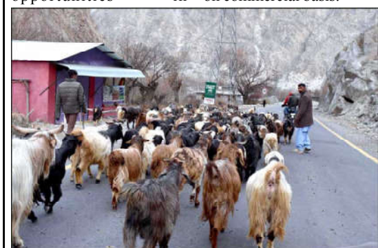
GILGIT: A shepherd guiding herd of goats heading towards grazing field near Nomal area.

The SUGS Project is a critical initiative designed to establish storage facilities for surplus gas, particularly during off-peak seasons when demand is low relative to supply in the Pakistani market. Through the SUGS Project, OGDCL and ISGS aim to mitigate these challenges by creating storage capacity and facilitating gas-swapping arrangements with other stakeholders in the industry on commercial basis.