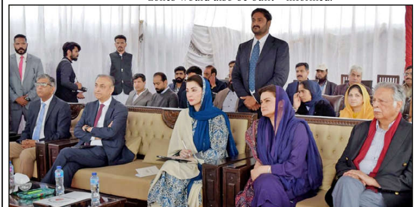
LAHORE: Punjab Chief Minister Maryam Nawaz being briefed about the Rawalpindi Ring Road Project.