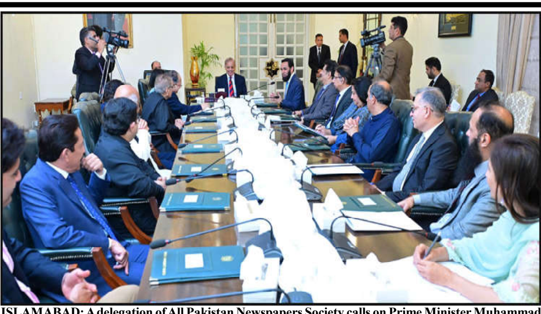
ISLAMABAD: A delegation of All Pakistan Newspapers Society calls on Prime Minister Muhammad

He said a committee had been formed to bring down the expenditure of the government and it would soon present its recommen-