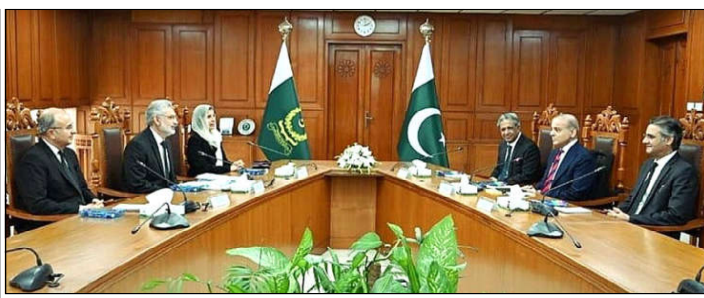
ISLAMABAD: Prime Minister Muhammad Shahbaz Sharif meeting with Chief Justice of Pakistan Justice Qazi Faez Issa at Supreme Court of Pakistan

He also assured that its response to meet the Pakistan Navy with Allah's help would continue to defend the country's sea fronwas especially apprised tiers and maritime interests about the capability re- and would shoulder the quirements of Pakistan responsibilities with Navy to meet the current honour both during peace