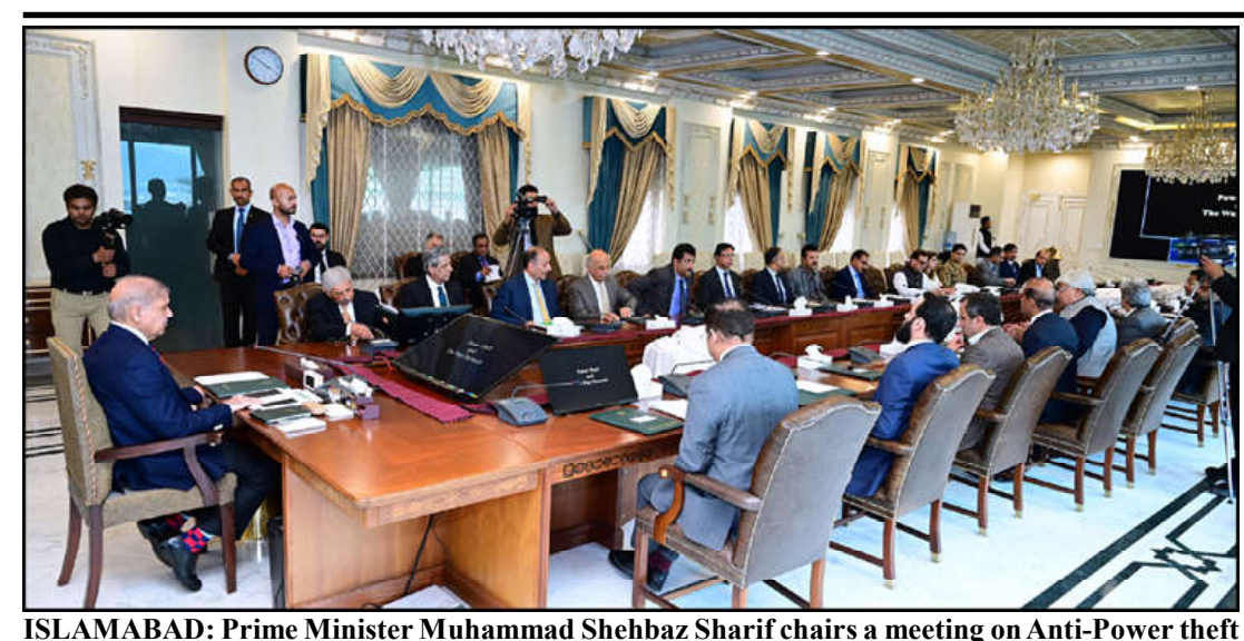
campaign. NCA approves revised first

the pulse of the economy important crops, which