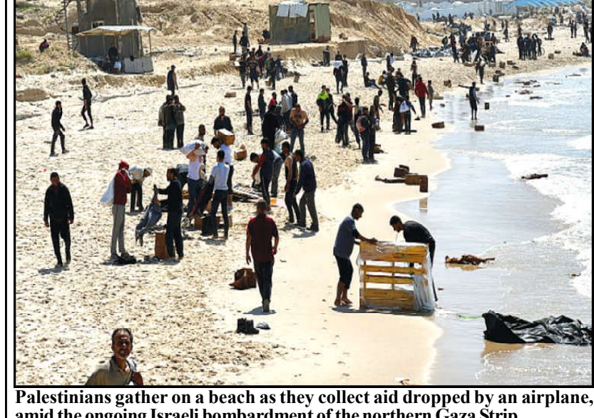
amid the ongoing Israeli bombardment of the northern Gaza Strip.