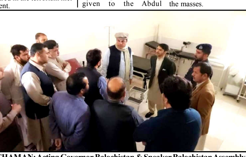
CHAMAN: Acting Governor Balochistan & Speaker Balochistan Assembly Captain (retd) Abdul Khaliq Achakzai visiting new DHQ Hospital

The election on 11 seats of Senate is scheduled to be held on April 2, 2024.