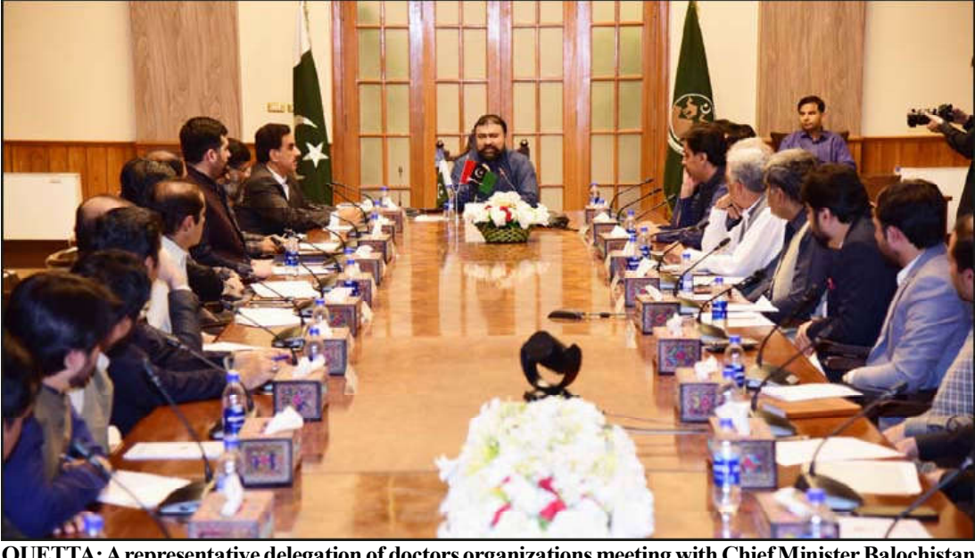
QUETTA: A representative delegation of doctors organizations meeting with Chief Minister Balochistan

He said besides, the month gave a powerful message of harmony, peace and tolerance, adding these qualities were required most in a world grappled with diverse challenges and