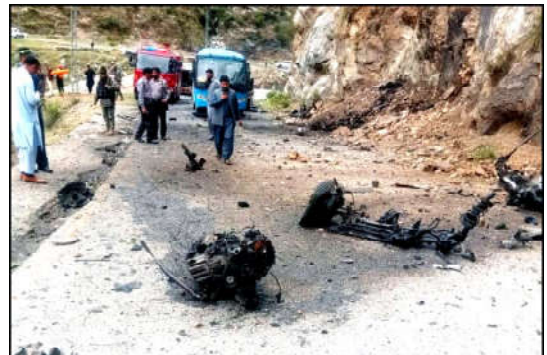
SHANGLA: View of site after targeted suicide bomb blast while rescue operation and investigation is underway, in Shangla.

However, due to unavailability of essential data and information with the Federal Ministry of Health, their names could not be included for civil awards ceremonies held at the federal and provincial levels this March 23rd.