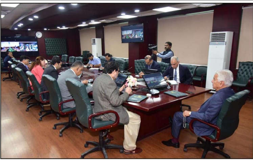
ISLAMABAD: Federal minister for Aviation Khawaja Muhammad Asif chairs a meeting on outsourcing of airports and privatisation of PIA at aviation division.