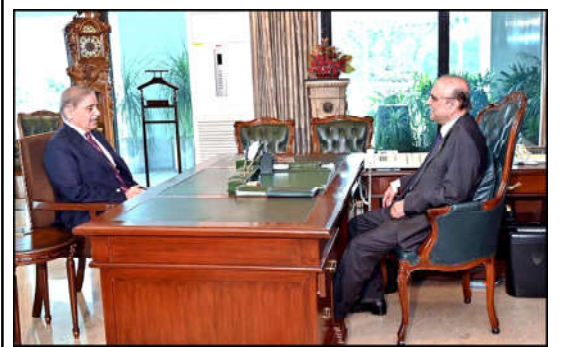
President, PM discuss overall political, economic situation

He said efforts are being made that candidates elect unopposed in Senate elections and all political parties in the province have been taken on board.