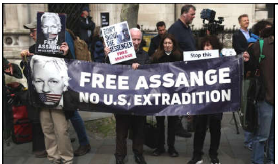
Supporters of Wikileaks founder Julian Assange hold a banner and placards outside The Royal Courts of Justice, Britain's High Court, in central London, UK.