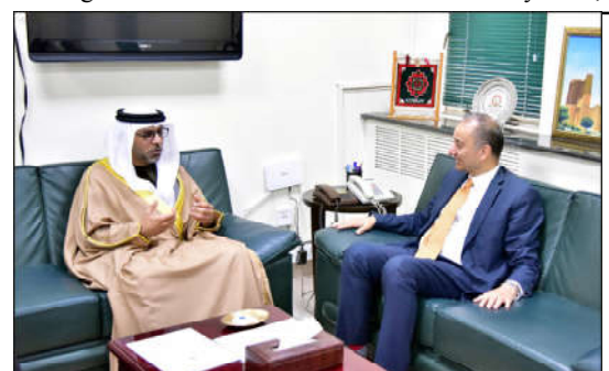
ISLAMABAD: Ambassador of UAE Hamad Obaid Al-Zaabi calls on Federal Minister for Petroleum Dr Musadik Malik.

Vocational Training Authority) institutions and laboratories would be aligned with global requirements. He added that laboratories should be upgraded with the cooperation of universities like UMT (University of Management and Technology), while biometric attendance of students and staff should also be arranged in TEVTA institutes, besides paying special attention towards the future of microchip manufacturing. Language courses including Arabic, German, Korean, Japanese and Spanish.