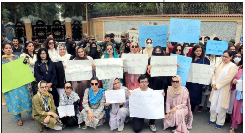
LAHORE: Teachers and parents of students of Aitchison College are holding protest demonstration for acceptance of their demands, outside Punjab Governor House building in Lahore.