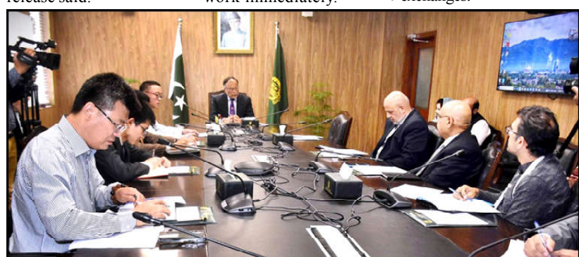
ISLAMABAD: Federal Minister for Planning, Development and Special Initiatives, Ahsan Iqbal chairing a meeting on progress of Gwadar Power Plant with Chinese company.

ISLAMABAD (Online): Prime Minister Muhammad Shehbaz Sharif has welcomed the UN Security Council resolution for a ceasefire in Gaza. In a statement, he urged the international community to ensure the implementation of the Security Council's resolution for an immediate ceasefire in Gaza. He said the ongoing Zionist oppression against innocent Palestinians in Gaza must be stopped permanently. The Prime Minister said thousands of women and children have been martyred in Israel's barbaric attacks.