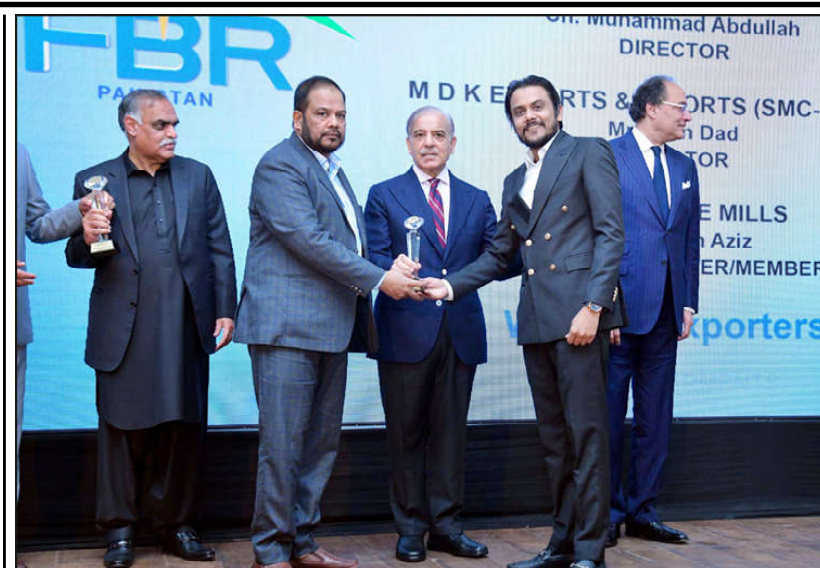
ISLAMABAD: Prime Minister Muhammad Shehbaz Sharif presents awards to the highest taxpayers and exporters of the country at the Tax Excellence Awards 2024.

The minister warned that the import-led and subsidy-supported businesses were not sustainable anymore and the country would have to accelerate export led-growth to achieve the trajectory of sustainable growth.