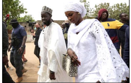
Presidential candidate Bassirou Diomaye Faye, who is backed by Senegalese opposition leader Ousmane Sonko, walks with one of his wives after casting his vote at the polling station at Ndiagianio in Mbour, Senegal.

building about 100 meters from the hospital, said he huddled in the kitchen for days while explosions sometimes caused the building to shake. Early Saturday, Israeli troops stormed the building and forced dozens of residents to leave. He said men were forced to strip to their underwear and four were detained. The rest were blindfolded and ordered to follow a tank south as blasts thundered around them. "From time to time, the tank would fire a shell," he told the Associated Press. "It was to terrorize us." Israeli jets on Sunday launched several strikes near Shifa Hospital, which largely stopped functioning following the November raid. After claiming that Hamas maintained an elaborate command center there, Israeli forces months ago exposed a single tunnel leading to a few underground rooms.