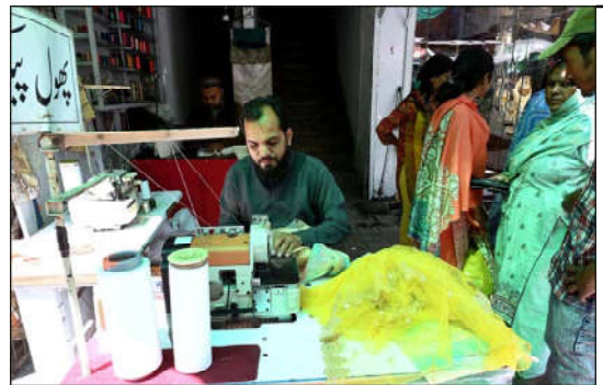
ISLAMABAD: Tailors busy stitching clothes for upcoming Eid ul Fitr festival at Aabpara.

Subsequent payments will be due on the 15th of each following month, facilitating convenient payments through a dedicated computerized system using a Payment Slip ID (PSID) generated by the Tajir Dost module or the FBR's online portal a private news channel reported. Traders and shopkeepers participating in the scheme will be required to make monthly advance tax payments.