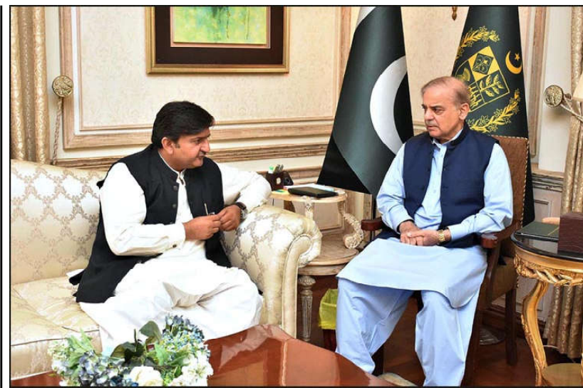
LAHORE: Speaker of the Punjab Assembly Malik Muhammad Ahmad Khan calls on Prime Minister Muhammad Shehbaz Sharif.

briefed that the work of our institution is registration, regulation and supervision of private schools. Fees are determined by classifying the schools on the basis of various facilities in the schools. They briefed that a total of 10,907 schools are registered with us in which more than 3,100,000 male and female students were getting education. Provincial Education Minister Faisal Khan Tarakai