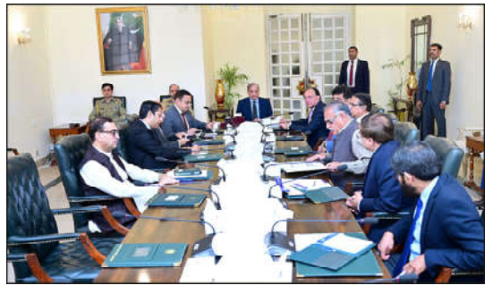
ISLAMABAD: Prime Minister Muhammad Shehbaz Sharif chairs a meeting regarding implementation of Track and Trace System.

He further directed that all those factories that resisted the implementation of track and trace system should be immediately sealed.