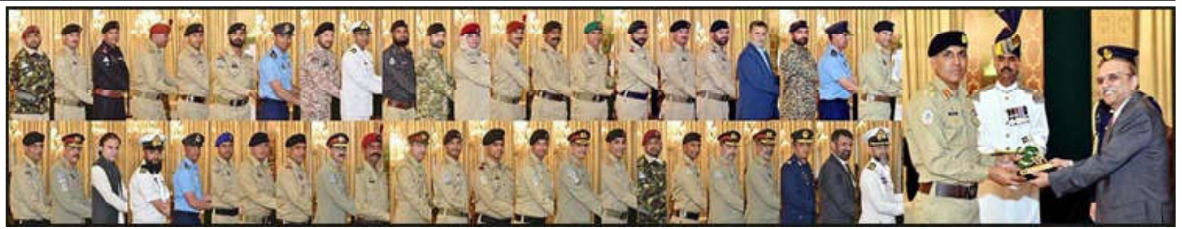
ISLAMABAD: President Asif Ali Zardari distributing commendation shields among military and civil officers who successfully organized Pakistan Day Parade, in a shield distribution ceremony held at Aiwan-i-Sadr.

They also directed to carry the original permit and documents along with them. Otherwise, they would be charged heavy fine, it was warned.