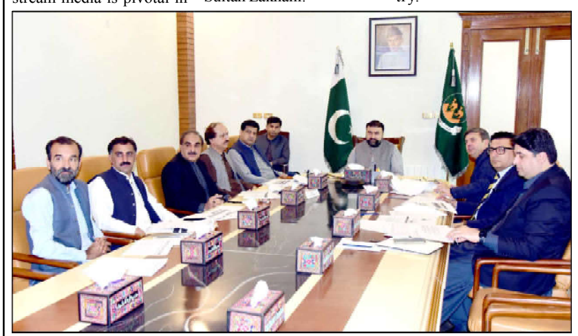
QUETTA: Chief Minister Balochistan Mir Sarfraz Ahmed Bugti presiding over a high level meeting of Education Department

He also promised to provide more vehicles and equipment to the district administration to maintain law and order and cope with challenges in this regard. In addition to this, Abdul Khaliq Achakzai also assured every possible cooperation to meet the requirements and resolve issues of Chaman. He said that it is important for all departments to be on one page for resolving the issues.