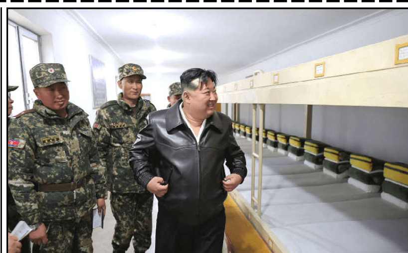
North Korean leader Kim Jong Un (C) inspecting the First Tank Armored Infantry Regiment, which is under the direct control of the Seoul Ryu Kyong Su Guards 105th Tank Division of the Korean People's Army (KPA) at an undisclosed location in North Korea.

spokeswoman Maria Zakharova called into question US assertions that IS, which once sought control over swathes of Iraq and Syria, was behind the attack. In an article for the Komsomolskaya Pravda newspaper, she said the US was evoking the "bogymen" of IS to convert "wards" in Kyiv and reminded readers that Washington had supported the mujahideen fighters who fought Soviet forces in the 1980s. Two US officials said on Friday that the US had intelligence confirming IS's claim of responsibility. Kremlin spokesman Dmitry Peskov later told reporters that Russia could not comment on the IS claim while the investigation was ongoing and would not comment on US intelligence, saying it was sensitive information.