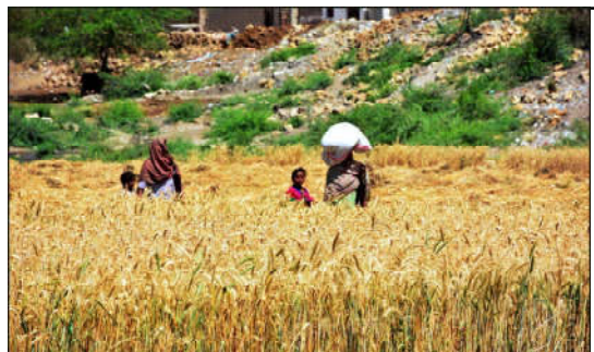
HYDERABAD: Wheat crop is ready for harvesting at Latifabad.