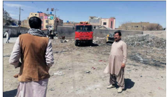
QUETTA: Heavy machinery removes garbage at garbage dump during cleanliness drive under the supervision of Metropolitan Corporation, at Spinnery road Quetta.

LAHORE (INP): The Pakistan Railways will run four special trains to facilitate passengers on Eid-ul-Fitr. According to official sources Pakistan Railways runs special Eid trains every year to facilitate passengers heading to or coming from Lahore, Karachi, Peshawar, Rawalpindi and Quetta. A majority of those working in other cities, travel to hometowns before Eid and return to workplaces after holidays on these special trains. Railways high-ups have directed making necessary arrangements to give maximum benefits.