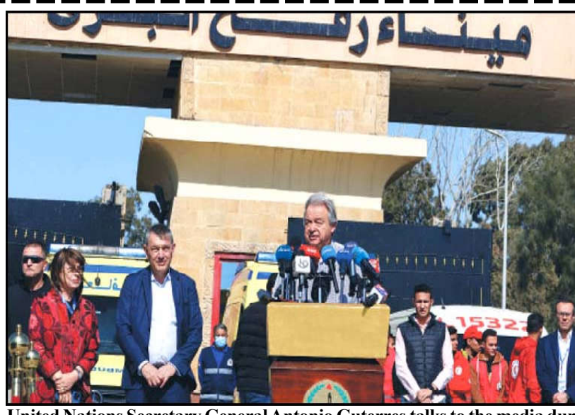
United Nations Secretary General Antonio Guterres talks to the media during a visit to the Rafah border crossing.