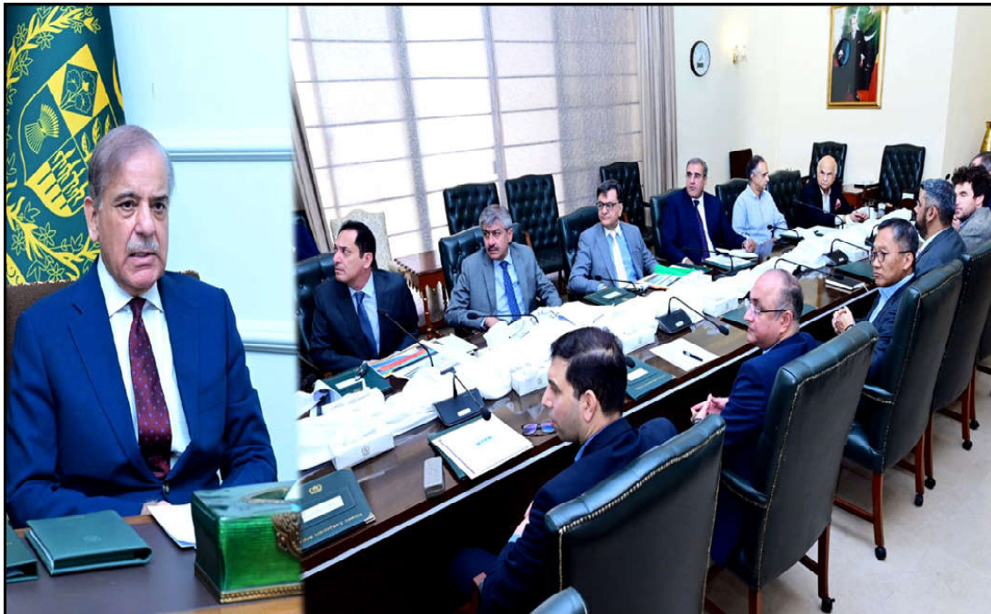
LAHORE: Prime Minister Muhammad Shehbaz Sharif chairs a meeting on Mines and Minerals of Balochistan with special context to Reko Diq Project.

Ph: 2841470/2841473 Vol: XIX No. 53, Ramzan 14, 1445 AH Monday March 25, 2024, Pages 04, Price Rs.15