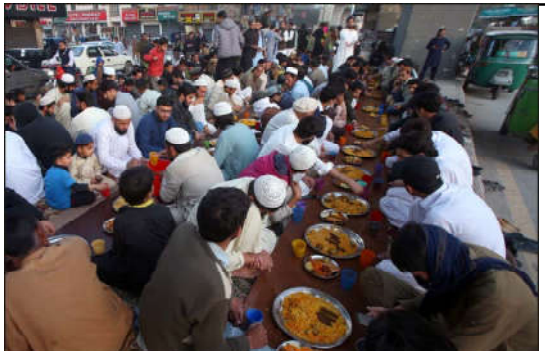
PESHAWAR: Faithful Muslims are breaking the fast (Iftar) under the supervision of charitable organization during the Holy month of Ramadan-Mubarak, at Stadium Chowk in Peshawar.

LAHORE: At least five persons were killed and 1223 injured in 1103 road accidents in all 37 districts of Punjab during the last 24 hours. Out of these, 568 people with serious injuries were shifted to different hospitals, while 655 victims with minor injuries were treated at the incident site by Rescue Medical Teams thus reducing the burden of Hospitals. Furthermore, the analysis showed those 649 drivers, 41 underage drivers, 144 pedestrians, and 435 passengers were among the victims of road traffic crashes.