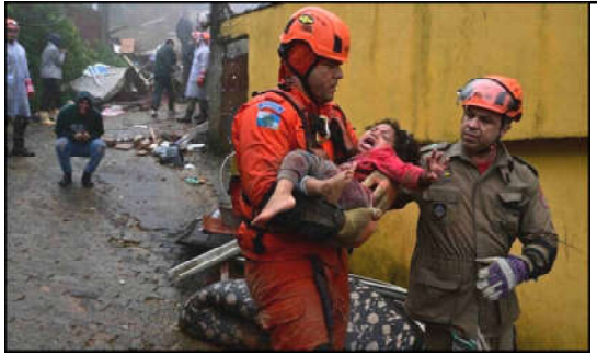
Members of the Civil Defense carry a girl, who remained more than 12 hours under the rubble of her house, which was destroyed by the heavy rains in Petropolis, Brazil.

Russian officials expect the death toll to rise further, with more than 100 wounded in hospital. Russia's Investigative Committee, which probes major crimes, said rescue workers were still pulling bodies from the burnt-out building on Saturday.