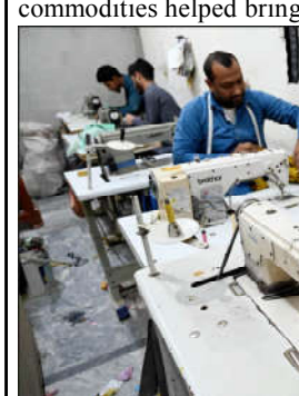
ISLAMABAD: Tailors busy stitching clothes for upcoming Eid ul Fitr festival.

Bilal Yasin said that good quality food items at fixed prices were available to citizens in Ramadan bazaars. Increasing the supply of essential commodities helped bring