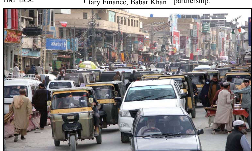
QUETTA: A large number of vehicles stuck in traffic jam before Iftar time due to negligence of traffic police staffs and illegal parking, need attention of concerned department

QUETTA: The Chief Minister Balochistan, Mir Sarfraz Ahmed Bugti has extended heartiest congratulations to the Hindu community on their Holi festival being observed today (Monday). In a felicitation message issued here on Sunday, the Chief Minister said that the Muslims also share the joys of Holi with the Hindu community.