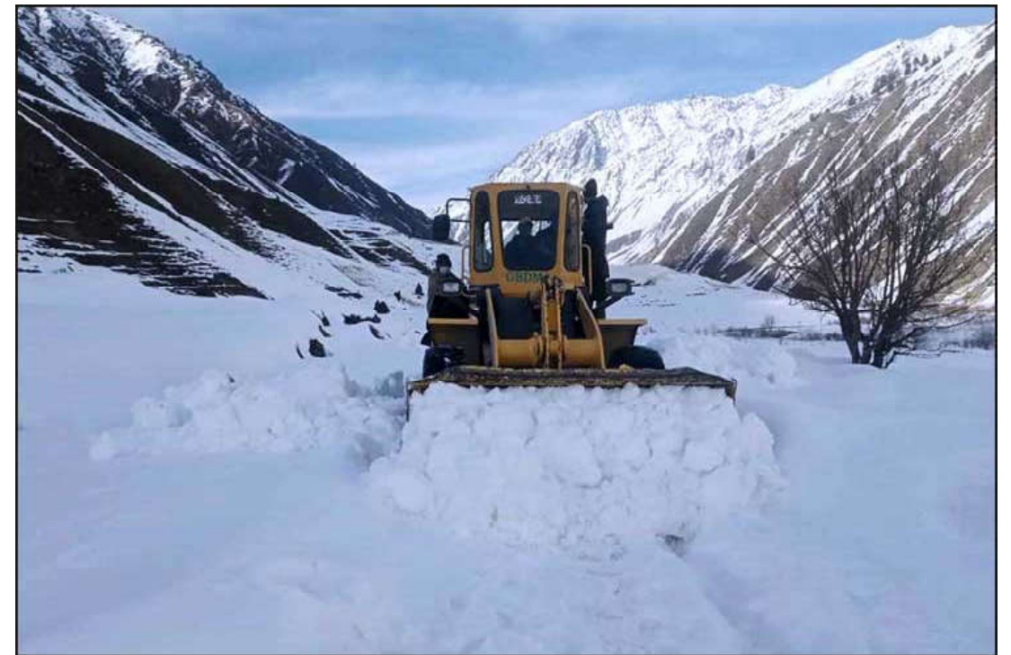
GILGIT: Heavy machinery being used to remove snow from the blocked road of Mir Malik area Astore Valley.