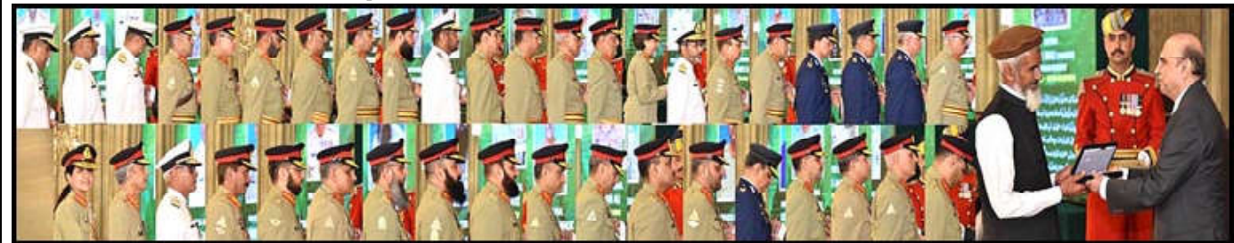
ISLAMABAD: President Asif Ali Zardari conferring the insignias of Hilal-i-Imtiaz (Military) upon officers of the Pakistan Armed Forces, at Aiwan-e-Sadr.

He also conveyed the greetings of Saudi leadership.