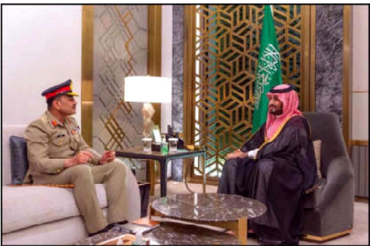
RIYADH: Chief of the Army Staff (COAS), General Asim Munir exchanging views with Prince Mohammed Bin Salman Bin Abdulaziz Al Saud, The Crown Prince and Prime Minister of Kingdom of Saudi Arabia during meeting held in Riyadh.