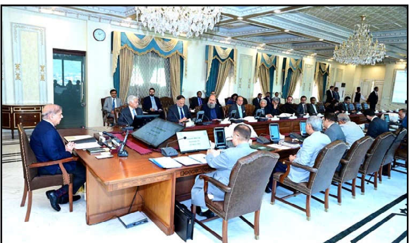
ISLAMABAD: Prime Minister Muhammad Shehbaz Sharif chairs a meeting of the Federal Cabinet.

The military said in a statement issued later in the evening that a group of eight terrorists attempted to enter Port Authority Colony in Gwadar, which was successfully thwarted by the security forces personnel.