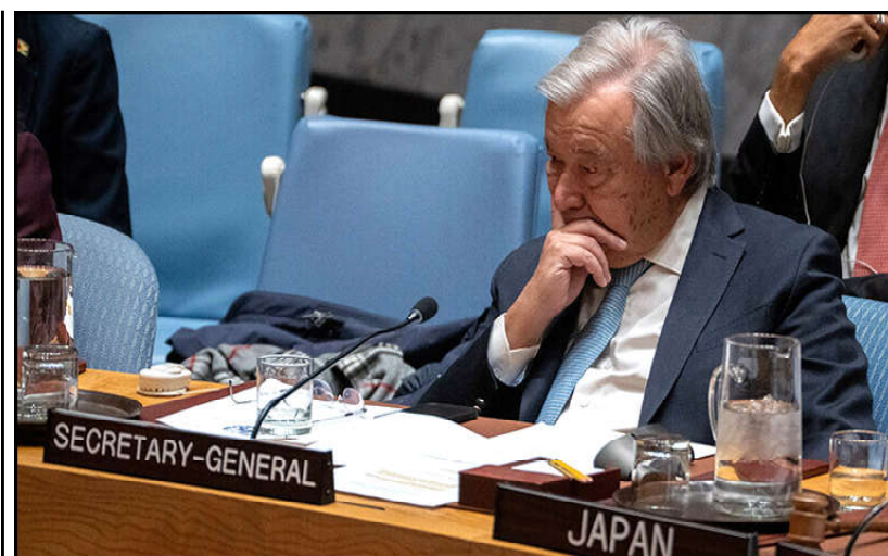
Secretary-General of the United Nations Antonio Guterres looks on during a meeting of the United Nations Security Council at U.N. headquarters on the maintenance of International Peace and Security Nuclear disarmament and non-proliferation in New York City, US.

the Ukraine defence contact group (UDCG), held at Ramstein Air Base in Germany, of about 50 allies that have been militarily supporting Ukraine. "Ukraine's survival is in danger," Austin said in a press conference after the meeting. "Our allies and partners continue to step up, the United States must also," he added. Austin, who is traveling for the first time this year since prostate cancer treatment, did not say how Washington would support Ukraine without additional funding. Officials say the lack of funding available is already having an impact on the ground in Ukraine and Ukrainian forces are having to manage scarce resources. "I think our allies are