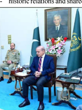
Shaza, PTA chairman discuss 5G spectrum auction