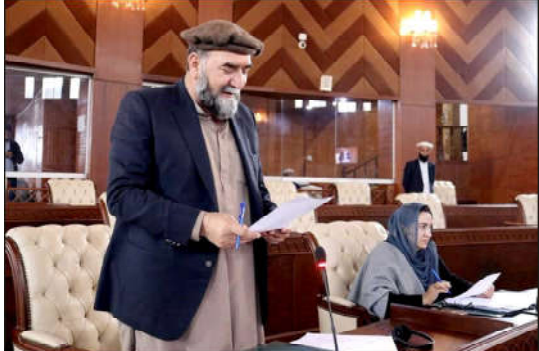
GILGIT: Minister Agriculture Gilgit-Baltistan Engineer Anwar speaks during the 3rd sitting of 18th Session of Gilgit-Baltistan Assembly under the chair of Speaker Gilgit-Baltistan Assembly Nazir Ahmad Advocate.

brought in excise an taxation system for facilitation of people. He also directed steps to resolve technical problems in Motor Vehicle Software Database and its implementation all over the province. He directed to complete database in 25 districts of the province and added that integrated system would soon be developed for online verification of property and motorcar taxation. Excise minister said that citizen service.