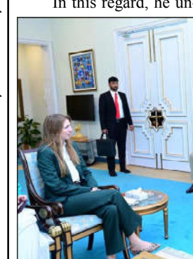
ISLAMABAD: British High Commissioner H.E. Jane Marriott called on Prime Minister Muhammad Shehbaz Sharif.

PM grieved over deaths in Harnai coal mine blast ISLAMABAD (APP): Prime Minister Shehbaz Sharif on Wednesday expressed grief over the loss of lives consequent to an explosion inside a coal mine in Harnai district of Balochistan. He prayed to Allah Almighty for peace for the departed souls and sympathised with the bereaved family members. PM instructed the authorities concerned to accelerate the rescue operation for the trapped miners and extend all possible medical treatment to those injured.