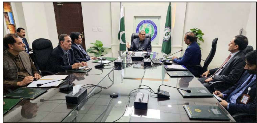
ISLAMABAD: Federal Minister for Interior, Mohsin Naqvi chairing a high level meeting, at NACTA Headquarters in Islamabad.