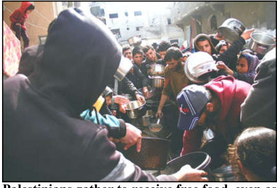
Palestinians gather to receive free food, even as Gaza residents face alarming levels of hunger during the month of Ramazan.

Monitoring Desk UNITED NATIONS: UN Secretary General Antonio Guterres invoked Oscar-winning film Oppenheimer on Monday as he warned that the world faced the highest risk of nuclear war in decades. At a Security Council session called by Japan, Guterres said that the biopic about the morally conflicted father of the atomic bomb "brought the harsh reality of nuclear doomsday to vivid life for millions around the world." "Humanity cannot survive a sequel to Oppenheimer," Guterres said. "We meet at a time when geopolitical tensions and mistrust have escalated the risk of nuclear warfare to its highest point in decades," he said. Russian President Vladimir Putin has made thinly veiled threats to use nuclear weapons as he