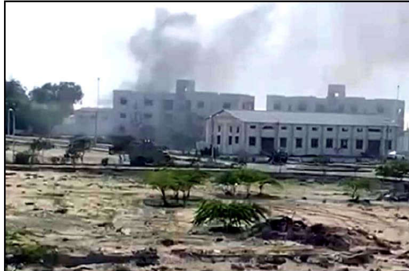
GWADAR: View of site after unidentified gunmen opened fire at Gwadar Port Authority (GPA) Complex in Gwadar.

Nathan Porter recognized the new government's commitment to continue the policy efforts that started under the current SBA to entrench economic and financial stability for the remainder of this year.