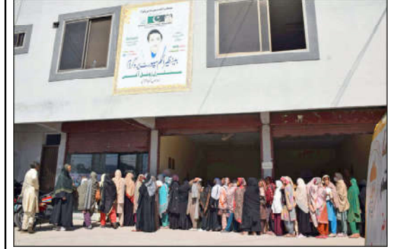
MUZAFFARABAD: Women from far-flung rural areas queue up outside the Benazir Income Support Program (BISP) office to receive money in the warm, sunny month of Ramadan, waiting for their turn.