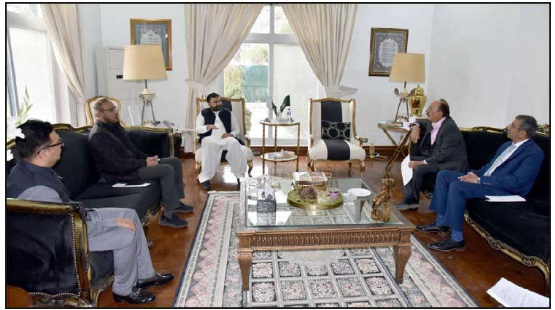
QUETTA: Chairman OGRA Masroor Khan meeting with Chief Minister Balochistan Mir Sarfraz Ahmed Bugti.

immense political goodwill while cooperating closely over a wide range of areas. The prime minister called for the early resumption of PIA flights between Pakistan and the UK to help strengthen linkages between the two countries and assuage concerns of the 1.6 million strong Pakistani diaspora in the UK. He requested the high commissioner to convey his best wishes to King Charles III and prayed for his early recovery to full health. The prime minister also expressed the hope that the King would visit Pakistan, as soon as his health permitted him to travel.