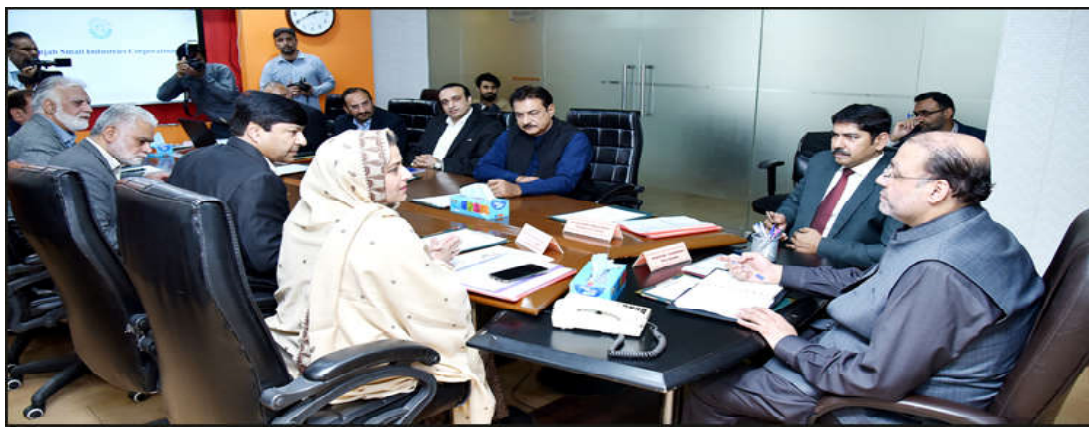
LAHORE: Provincial Minister for Trade and Industry presiding over a meeting of Punjab Small Industries Corporation.

LAHORE (Online): Lahore High Court (LHC) has rejected the plea seeking immediate removal of Nawaz Sharif picture from Ramazan ration bags. Justice Shahid Karim of LHC took up the petition for hearing Wednesday. Counsel Salma Riaz gave arguments on behalf of the petitioner. The court rejected the plea for removing Nawaz Sharif picture from ration bags related to Ramazan package forthwith. The court while issuing notice to Punjab government sought reply.