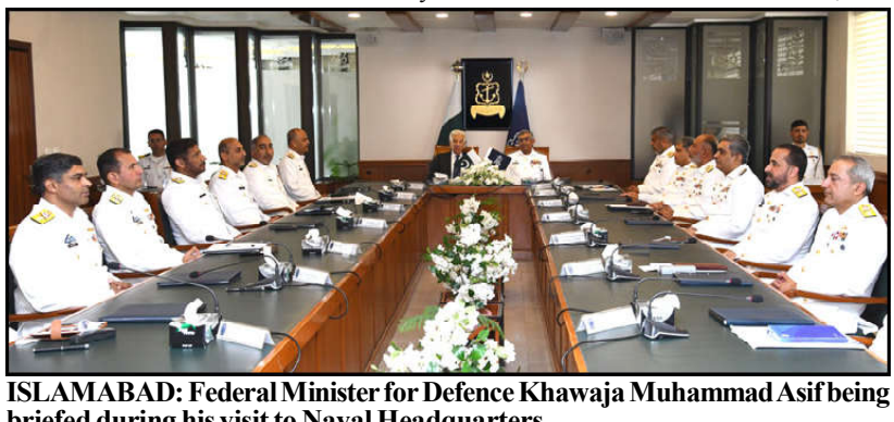
briefed during his visit to Naval Headquarters.

Nomination papers of 28 candidates accepted: Scrutiny of nomination papers of all 38 candidates contesting Senate polls completed