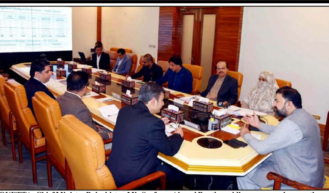
QUETTA: Chief Minister Balochistan Mir Sarfaraz Ahmed Bugti presiding over a review meeting of Health Department.

He on the occasion observed that the buildings of basic health units are used for personal sittings and gatherings in interior parts of the province.