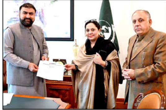
QUETTA: Balochistan Chief Minister Mir Sarfraz Bugti hands over party ticket to Kiran Baloch for general election of Senate on behalf of PPP.

'And we urge both sides to address any differences. We remain committed to ensuring that Afghanistan never again becomes a safe haven for terrorists who wish to harm the United States and our partners and allies," he