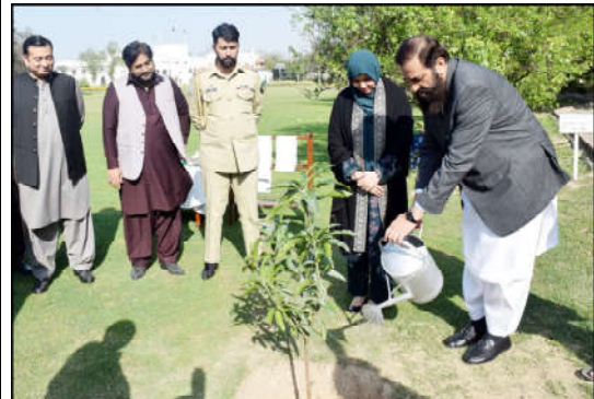
LAHORE: Punjab Governor Muhammad Balighur-Rehman along with his wife sapling a tree to inaugurate plantation campaign.

The minister directed to improve waste management systems in government hospitals and ordered the timely completion of ongoing developmental projects aimed at improving healthcare infrastructure.