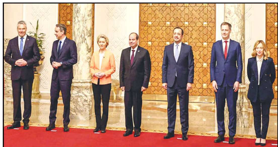
CAIRO: Austria's Chancellor Karl Nehammer, Greece's Prime Minister Kyriakos Mitsotakis, European Commission President Ursula von der Leyen, Egypt's President Abdel Fattah al-Sisi, Cyprus' President Nikos Christodoulides, Belgium's Prime Minister Alexander De Croo, and Italy's Prime Minister Giorgia Meloni posing for a photograph during their summit.

Inspired by opposition leader Alexei Navalny, who died in an Arctic prison last month, thousands of opponents protested at noon against Putin at polling stations inside Russia and abroad.