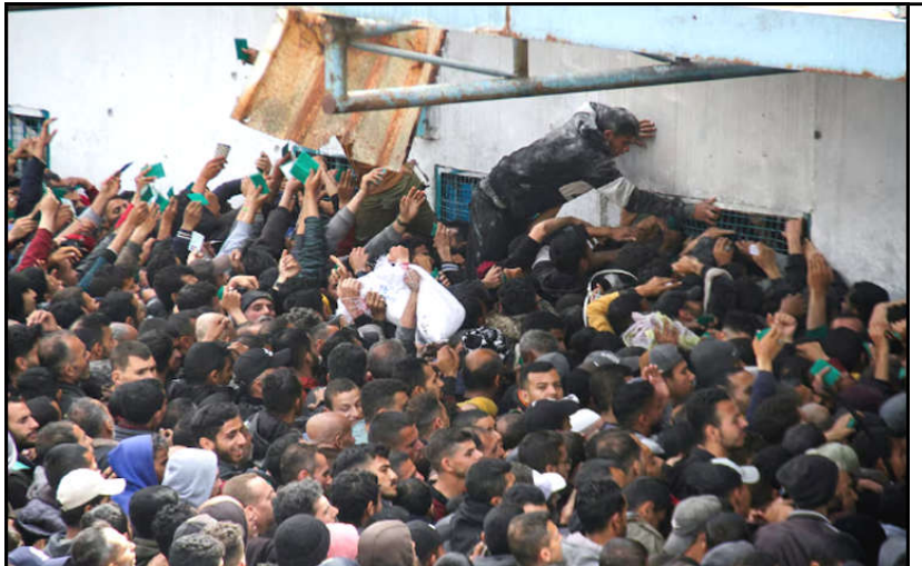
Palestinians gather to receive aid outside an UNRWA warehouse as Gaza residents face crisis levels of hunger, in Gaza City.