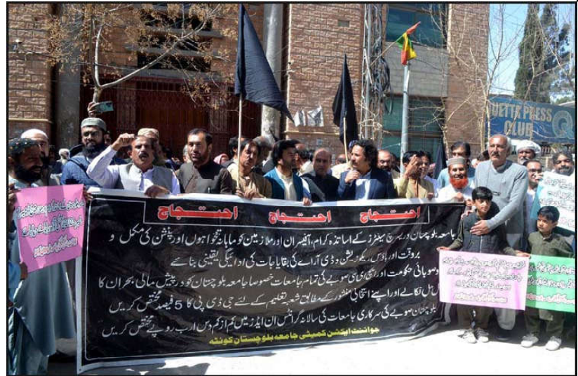
QUETTA: Members of Joint Action Committee University of Balochistan are holding protest demonstration against non-payment of their salaries.