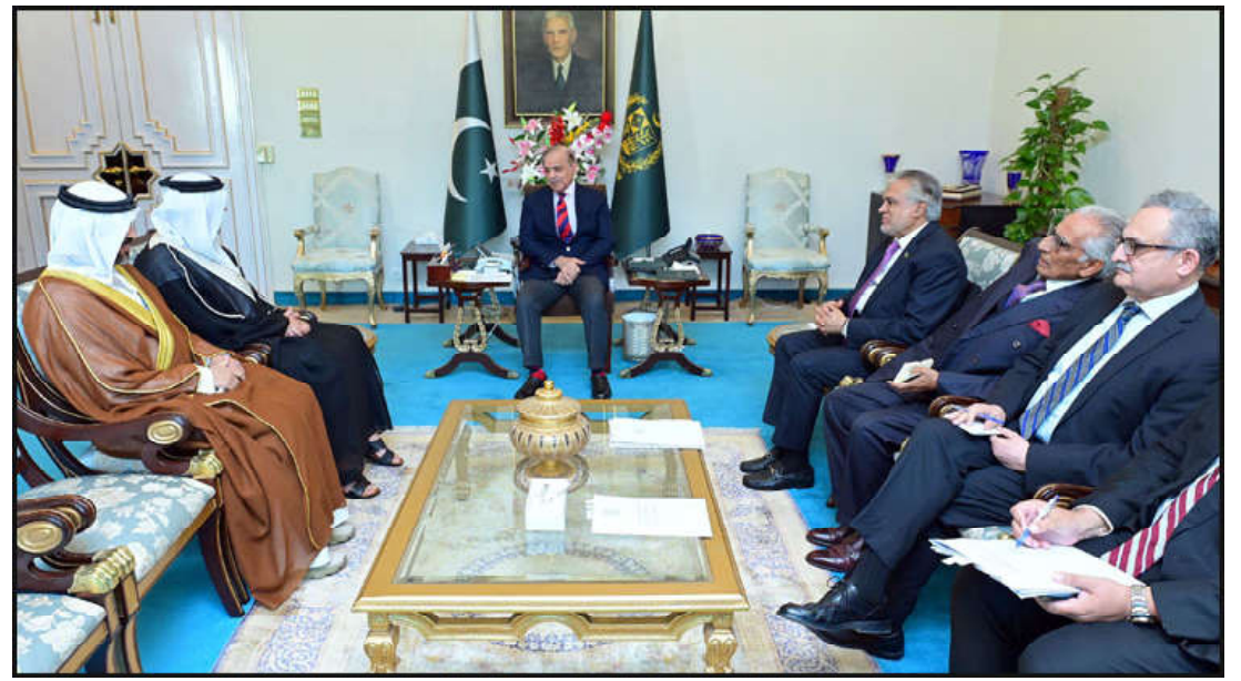
ISLAMABAD: Ambassador of the United Arab Emirates Amb. Hamad Obaid Ibrahim Salem Al-Zaabi calls on Prime Minister Muhammad Shehbaz Sharif, in the Provincial Capital.

efficient mechanism to attract foreign investment into priority sectors including agriculture, minerals & mining, I.T., renewable energy and industry. On the multilateral side, the Prime Minister congratulated the U.A.E. for successfully hosting COP 28 meeting on climate change last year as well as its efforts to bring peace in Gaza while serving as a non-permanent member of the United Nations Security Council. He also appreciated the U.A.E. for hosting nearly 1.8 million Pakistanis who were a bridge between the two countries.