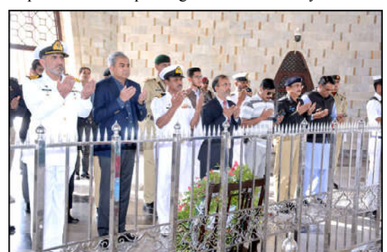
KARACHI: The Federal Minister for Interior Syed Mohsin Raza Naqvi offering Fateha at the mausoleum of father of the nation Quaid-e-Azam Mohammed Ali Jinnah during his first visit to the city.