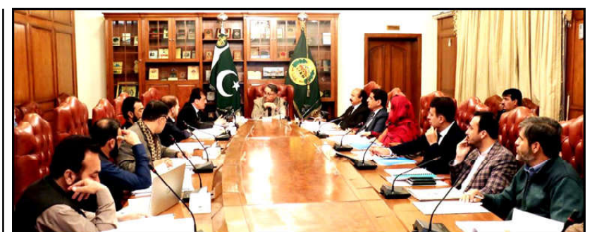
QUETTA: Governor Balochistan Malik Abdul Wali Khan Kakar presiding over 4th meeting of Senate of Bolan University of Medical & Health Science