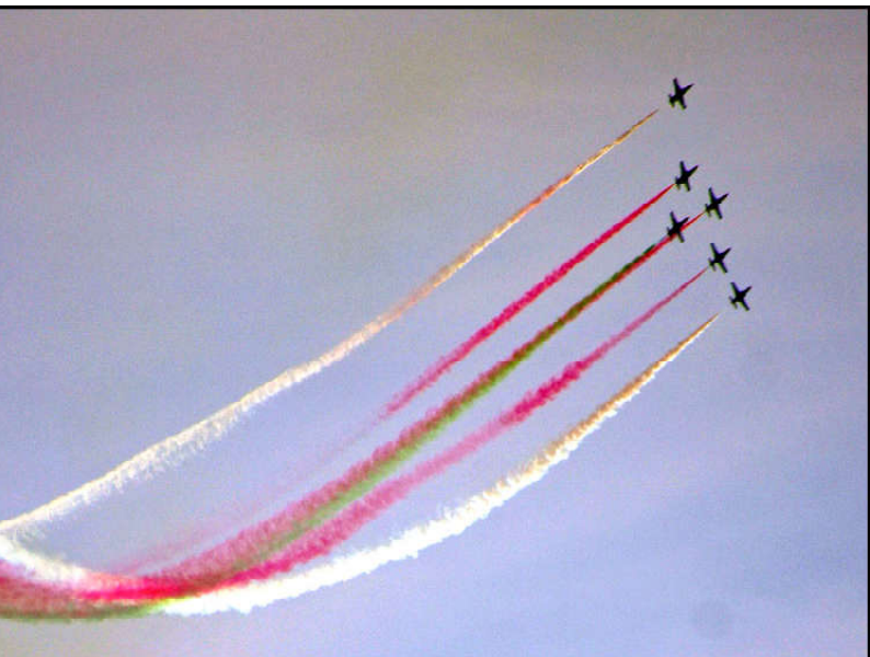
ISLAMABAD: Pakistan Air Force (PAF) jet demonstrating different skills during rehearsal ahead of the Pakistan Day parade on 23<sup>rd</sup> March in the Federal Capital.