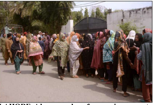
LAHORE: A large number of women in a queue to get flour bag on subsidies rate.