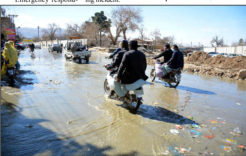
QUETTA: Vehicles passing through sewerage water accumulated on the Jinnah road need the attention of concern authorities.

restoration of the social media platform 'X' from