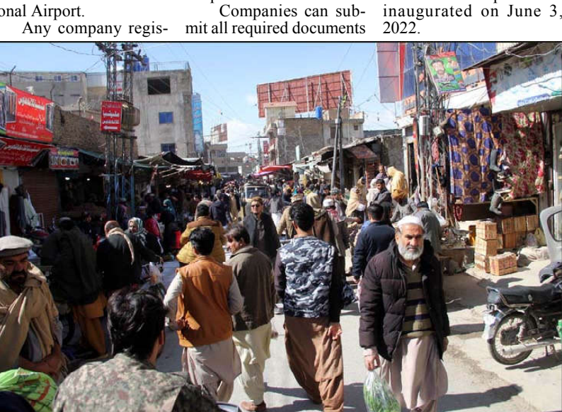
QUETTA: People are busy in buying food items before Iftar times as demands of food items increased in city during the Holy Month of Ramadan-ul-Mubarak, in Quetta.