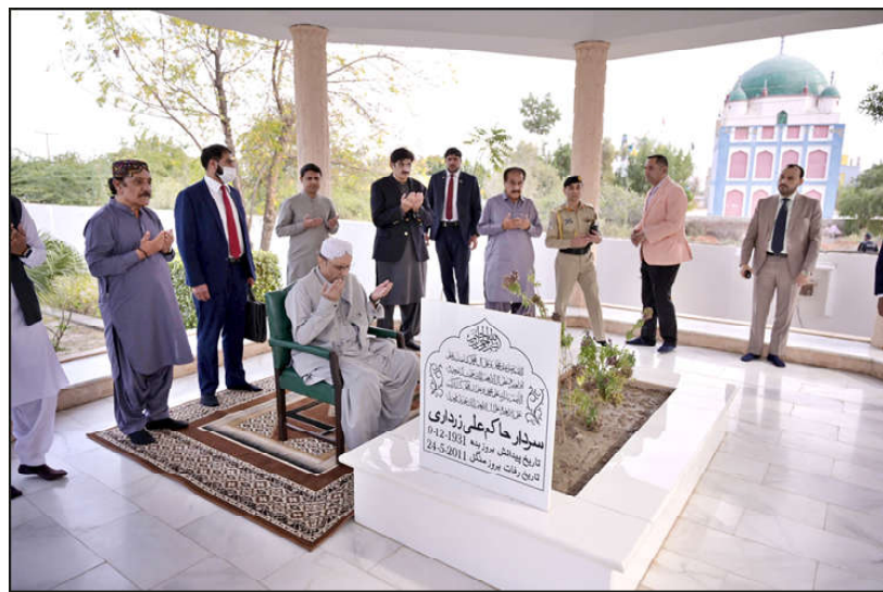
NAWABSHAH: President Asif Ali Zardari offers Fatcha on his father Hakim Ali Zardari's grave.

to the people and promoting self-employment among our talented youth are the priority areas of his government. Apart from this, he said the government also plans to initiate a program for renovation of all major cities in the province. He further stated that Khyber Pakhtunkhwa Cities Improvement Project assisted by ADB was an important project of the provincial government; we need special cooperation for implementing Phase-II of this project as well. "The provincial government has a lot to do in different sectors specially in tourism, health, education, PHE and others," he remarked and said that the government would like to work in a partnership with ADB for providing basic facilities in the sectors of social services.