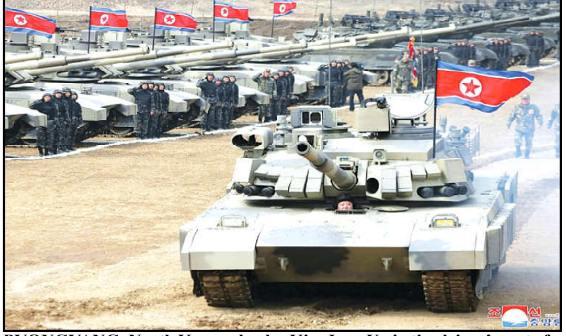
PYONGYANG: North Korean leader Kim Jong Un in the driver's seat of a new main battle tank after a training exercise for tank crews at an undisclosed location.