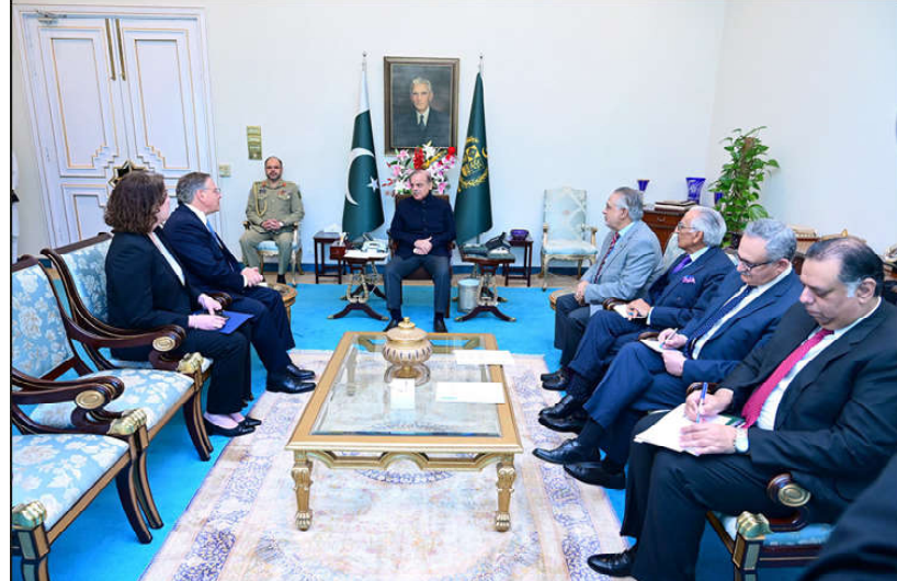
ISLAMABAD: Ambassador Donald Blome, Ambassador of the United States of America to Pakistan calls on Prime Minister Muhammad Shehbaz Sharif.