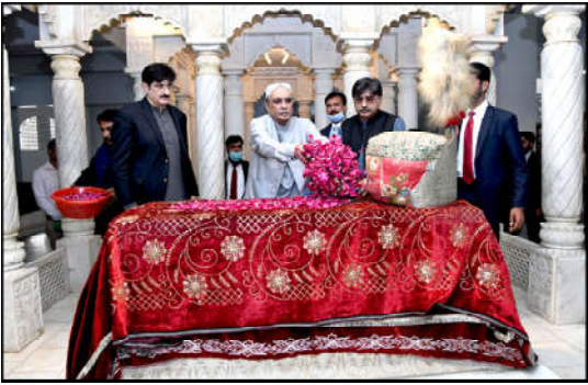
LARKANA: President Asif Ali Zardari showering flowers on the grave of Shaheed Zulfikar Ali Bhutto at his mausoleum in Garhi Khuda Bakhsh Bhutto.