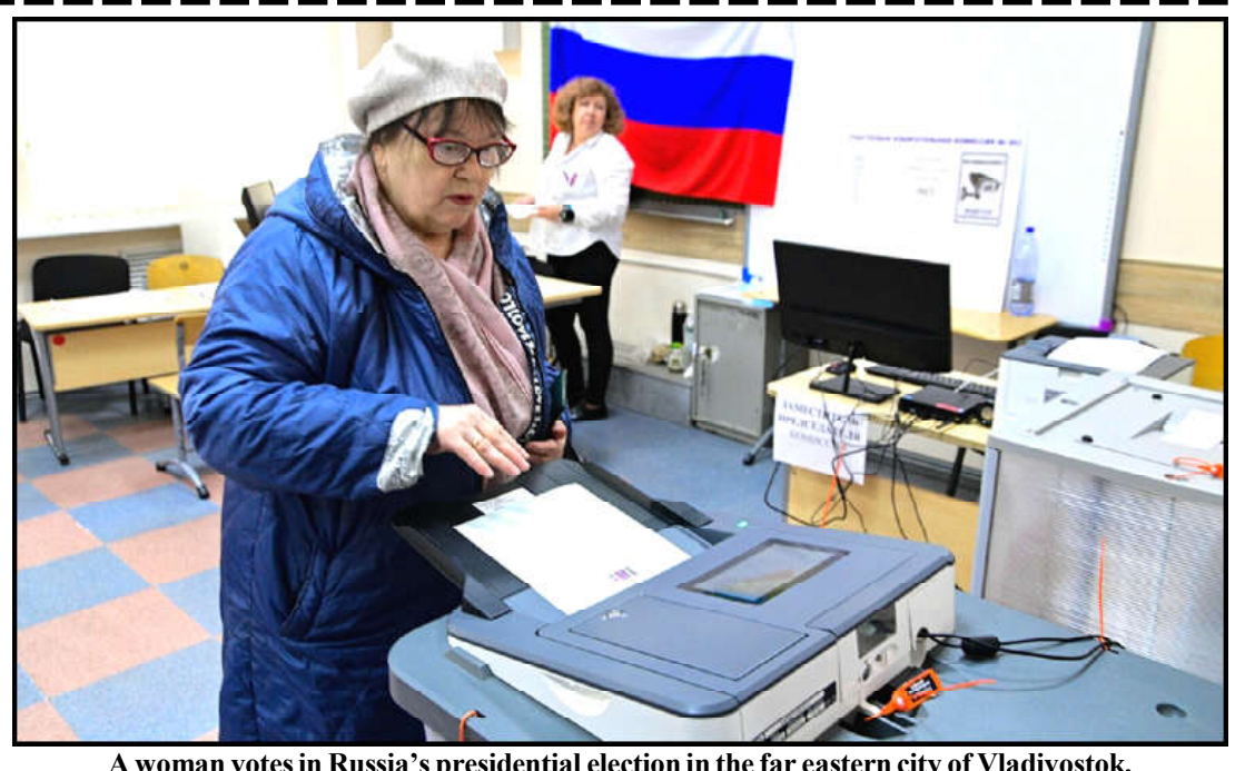
A woman votes in Russia's presidential election in the far eastern city of Vladivostok.

exercise your right to vote." Putin, 71 and in power as president or prime minister since 2000, faces three challengers in three days of voting beginning on Friday. None of the challengers has criticised him. Opinion polls show he is supported by a majority of Russians, with one survey last month giving him 75% support. Two candidates who had hoped to run on a platform of calling for an end to the war in Ukraine, officially described by Russia as a "special military operation," were ruled ineligible.