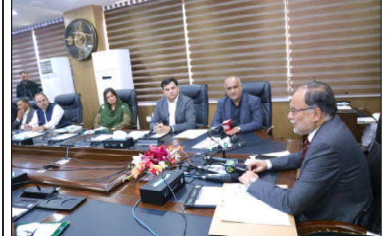
ISLAMABAD: Federal Minister for Planning Development & Special Initiatives Ahsan Iqbal, receives comprehensive briefing at Pakistan Bureau of Statistics.

regard, he also highlighted the role of the Special Investment Facilitation Council (SIFC) that has been established to fast-track foreign investments in priority sectors in Pakistan. A number of issues of bilateral and regional significance were also discussed during the meeting, including the situation in Gaza and the Red Sea, developments in Afghanistan, as well as the case of Dr Aafia Siddiqui, which was raised forcefully by the prime minister. While congratulating the prime minister on his re-election, ambassador Blome said that the U.S. considered Pakistan an important partner and hoped to work with the government to build stronger ties between the two countries.