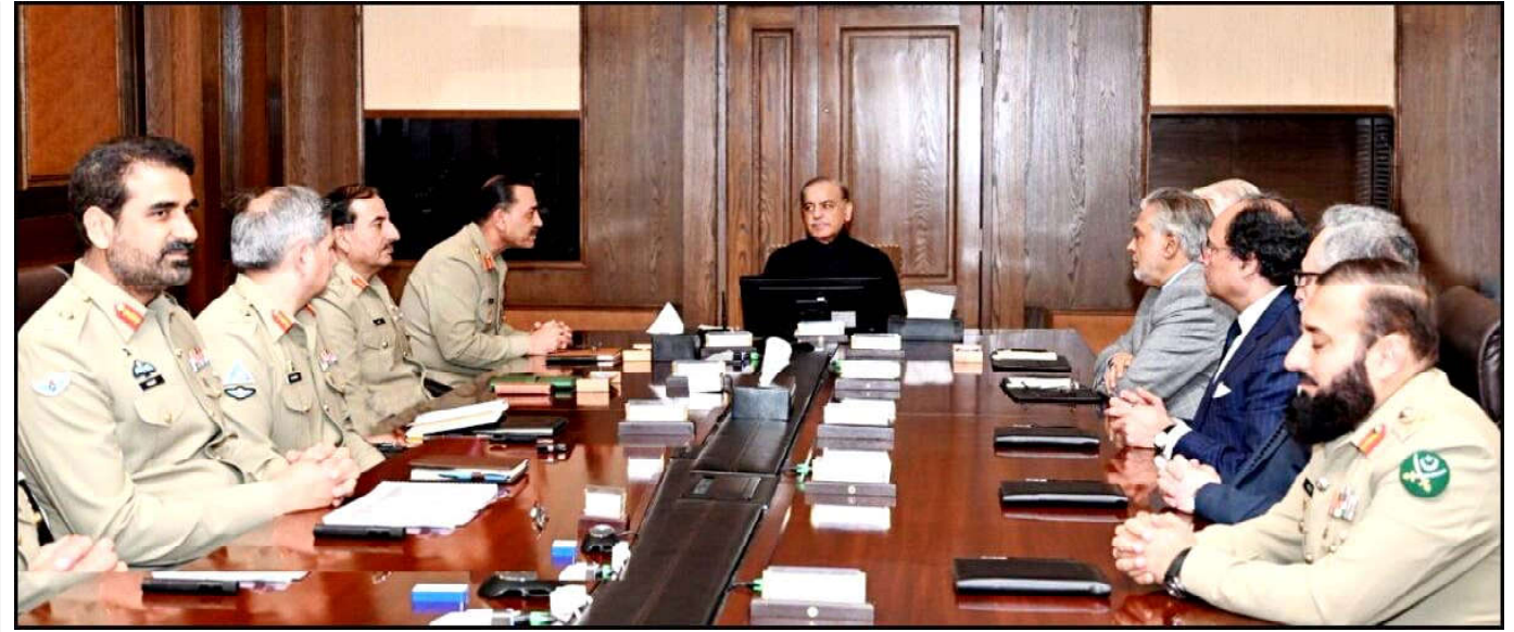
RAWALPINDI: Prime Minister Shehbaz Sharif presiding over a meeting during his visit to GHQ

He also prayed for the development and prosperity of the country.