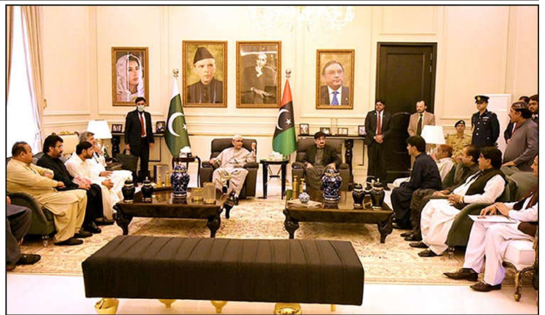
Nawabshah: President Asif Ali Zardari meets with elected representative at Zardari House.