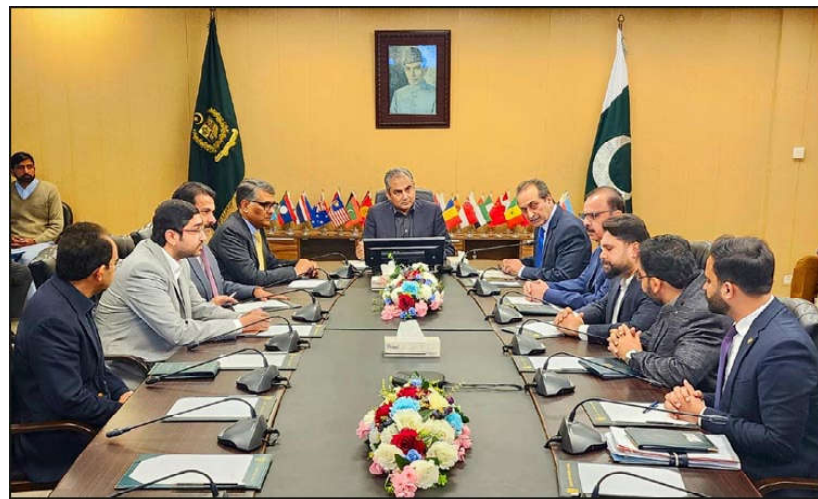
Federal Minister for Interior & Narcotics Control, Mohsin Naqvi chairing a meeting at Ministry of Narcotics Control in Islamabad.

Mohtarma Benazir Bhutto, and the Pakistan People's Party workers who sacrificed their lives to establish this truth. It appreciated the determination with which President Asif Ali Zardari filed a presidential reference to reopen the case 12 years ago, and Bilawal Bhutto Zardari, who single-mindedly pursued it. The resolution lauded the Supreme Court of Pakistan for finally acknowledging and accepting the glaring injustice meted out to Shaheed Zulfikar Bhutto 44 years ago in its judgment. In light of the historic judgment of the court, the resolution demanded that the unjust verdict given in the Shaheed Zulfikar Ali Bhutto case must be overturned. It also called for conferring the highest civil award, Nishan-e-Pakistan, upon Zulfikar Ali Bhutto. Furthermore, the resolution demanded the establishment of the Nishan-e-Zulfikar Ali Bhutto Award for workers and activists who have fought and sacrificed their lives for true democracy in Pakistan.