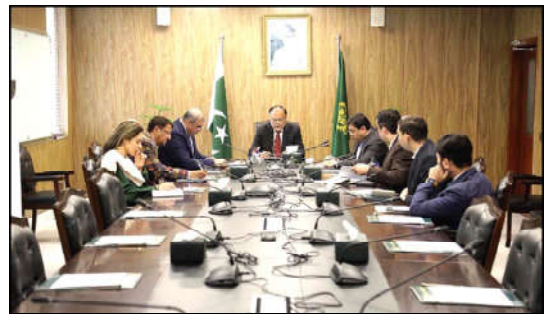
ISLAMABAD: Federal Minister for Planning Development & Special Initiatives Professor Ahsan Iqbal chaired a meeting to bring major reforms in Planning Commission on March 13. The meeting was attended by the Secretary Planning Ministry and Members Planning Commission.

unique honor of being the first Pakistani to receive the Senior Fellow in Public Service Award at the National University of Singapore's Lee Kuan Yew School of Public Policy, along with holding a position as a Senior Executive Fellow at Harvard Kennedy University in the United States.