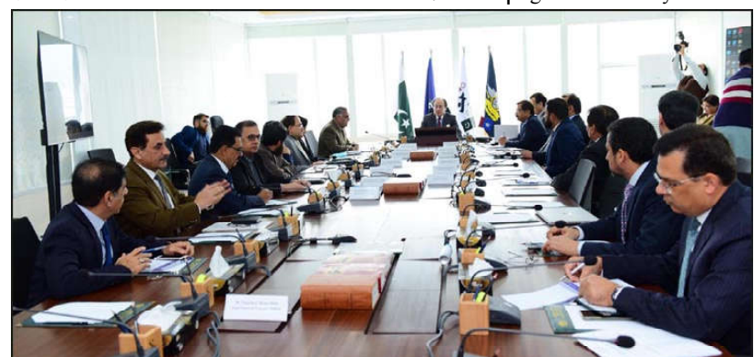
Federal Minister for Finance & Revenue Mr. Muhammad Aurangzeb chairing a meeting during his visit to FBR Headquarters.

ISLAMABAD (APP): The per tola price of 24 karat gold in the local market decreased by Rs.1,800 and was traded at Rs.228,300 on Wednesday as against its sale at Rs.230,100 on the last trading day. The price of 10 grams 24 karat gold also decreased by Rs.1,544 to Rs.195,730 from Rs.197,274 whereas that 10 gram 22 karat gold decreased to Rs.179,420 from Rs.180,834, the All Sindh Sarafa Jewellers Association reported. The price of per tola and ten gram silver witnessed no change and was traded at Rs.2,600 and Rs.2,229.08 respectively.