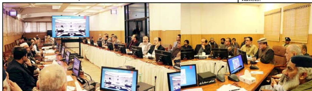
QUETTA: Speaker Balochistan Assembly Captain (retd) Abdul Khaliq Achakzai presiding over a meeting regarding repair and renovation of Balochistan Assembly

ISLAMABAD (APP): By-elections for 23 constituencies, comprising six national and 17 provincial assembly constituencies, would be held on April 21, said the Election Commission of Pakistan (ECP). The by-elections for many of these National and Provincial constituencies were postponed from February 8 due to various reasons, including the death of contesting candidates and candidates running for multiple seats. Additionally, some constituencies were vacated by winners of dual seats. According to the schedule released by the Election Commission of Pakistan, by-elections will be held in six National Assembly constituencies, 12 in Punjab, two in Khyber Pakhtunkhwa, two in Balochistan, and one in the Sindh Assembly constituencies. Polling is being held in NA-08 Bajaur, NA-44 Dera Ismael Khan-I, NA-119 Lahore-III, NA-132 Kasur-II, NA-196 Kamber Shahdadkot-I, and NA-207 Shaheed Benazirabad-I constituencies. The Khyber Pakhtunkhwa Assembly comprises PK-22 Bajaur-IV and PK-91 Kohat-II constituencies, while the Balochistan Assembly includes PB-20 Khuzdar-III and PB-22 Lasbela constituencies. A by-election will be held in the Sindh constituency PS-80 Dadu-I. The elections are being held in various Punjab Assembly constituencies, including PP-22 Chakwal-Cum-Falagang, PP-32 Gujrat VI, PP-36 Wazirabad-II, PP-54 Narawal-I, PP-93 Bhakkar-V, PP-139 Sheikhupura-IV, PP-147 Lahore-III, PP-149 Lahore-V, PP-158 Lahore XIV, PP-164 Lahore-XX.