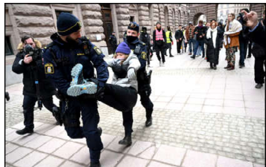
Greta Thunberg is removed by police officers as she demonstrates outside the Swedish parliament building together with a group of climate activists in Stockholm, Sweden.

warnings that Russia's aggression will not stop at Ukraine. "This ammunition will keep Ukraine's guns firing for a period, but only a short period," White House National Security Advisor Jake Sullivan told reporters as he announced the aid package. Sullivan added that the aid may only last a couple of weeks, leaving Ukraine outgunned in the face of a Russian war machine that is churning out arms and throwing troops at stalemated towns to force a breakthrough. "It is nowhere near enough to meet Ukraine's battlefield needs and it will not prevent Ukraine from running out of ammunition in the weeks to come." The shipment would include long-range US-made HIMARS rocket systems, anti-aircraft and anti-tank weapons, artillery shells and small arms ammunition, the Pentagon said.