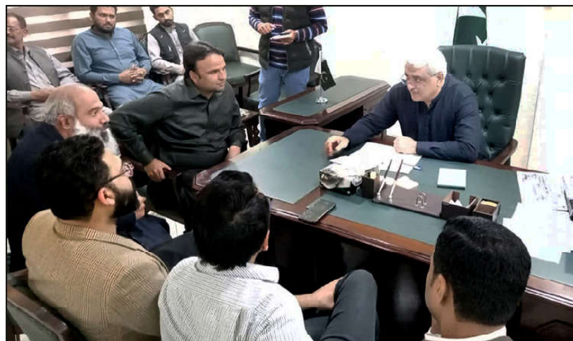
LAHORE: A delegation from different walk of life meeting with Provincial Minister Specialized Health Care and Medical Education Khawaja Salman Rafique.

The meeting also deliberated on issues related to the establishment of a security division within the police for the security of important personalities and installations.