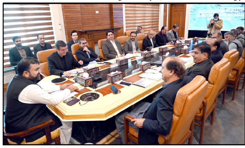
QUETTA: Chief Minister Balochistan Mir Safaraz Ahmed Bugti presiding over a review meeting about Communication and Works Department