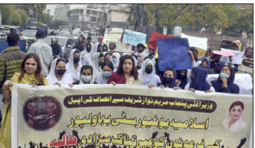
LAHORE: Teachers and students of Islamia University Bahawalpur are protesting against the alleged sexual harassment in front of Press Club in the Provincial Capital.