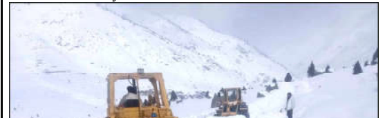
ASTORE: Heavy machinery being used to remove snow and boulders from the blocked road of Astore Valley by the staffer of Gilgit-Baltistan Disaster Management authority and Works Department after heavy snow fall and rain in area caused land sliding in diffident area.

ISLAMABAD (APP): The Supreme Court of Pakistan on Wednesday issued written order regarding hearing of a case pertaining to the FIA's notices to journalists on alleged anti-judiciary campaign. The four pages order issued by the top court said that the reports of FIA and police regarding attacks on journalists are not satisfactory. It directed the FIA and police to submit detailed reports again. It said that the Supreme Court or the Registrar Office did not ask for any action against any journalist. The name of the judiciary was wrongly used in the notices issued to journalists.