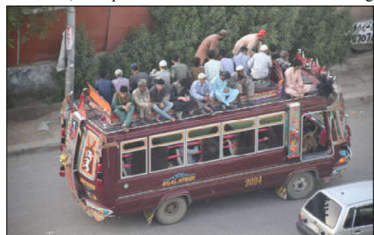
KARACHI: Passengers sit on the roof of a bus on MA Jinnah Road in Provincial Capital. Pakistan has one of the world's worst records for fatal traffic accidents, blamed on poor roads, badly maintained vehicles and reckless driving.