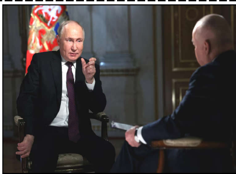
Vladimir Putin speaks during an interview in Moscow.

"We can confirm that the Indian troop withdrawal is underway," the MND said in a statement. President Mohamed Muizzu came to power in September on a pledge to kick out Indian security personnel deployed in the Maldives to patrol its vast maritime border. The two sides had agreed to complete a withdrawal of 89 Indian troops and their support staff in the Maldives by May 10.