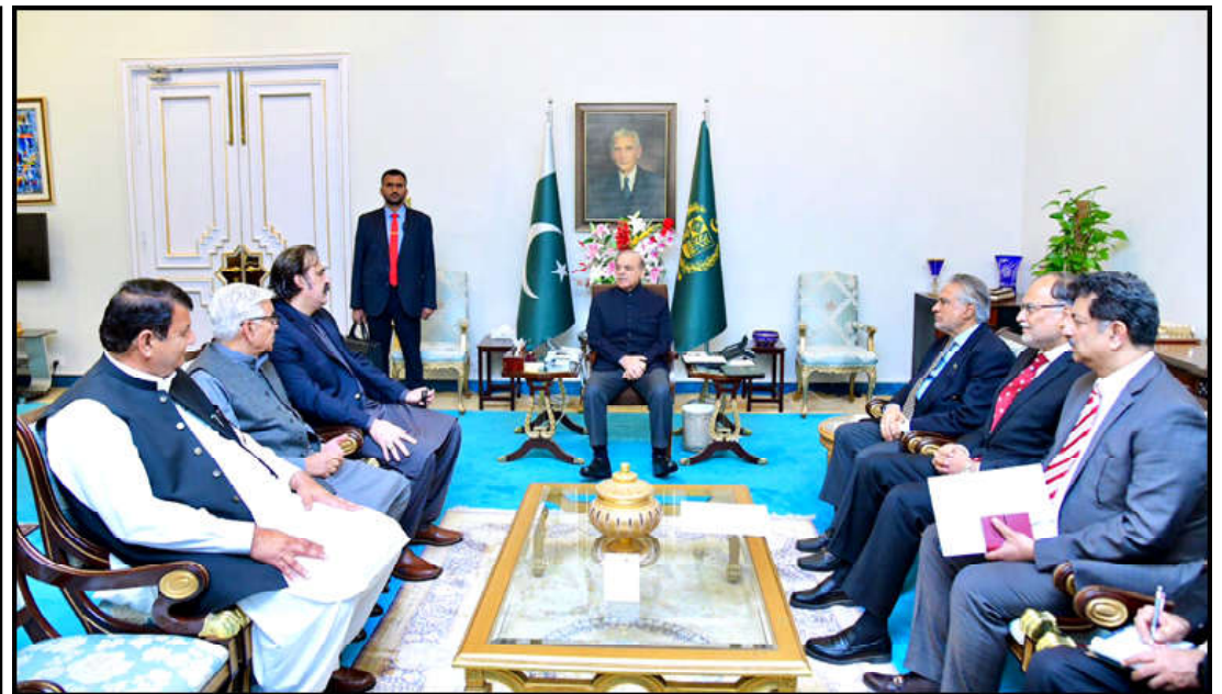
ISLAMABAD: Chief Minister Khyber Pakhtunkhwa, Ali Amin Khan Gandapur calls on Prime Minister Muhammad Shehbaz Sharif.

Meanwhile Chief Minister Khyber Pakhtunkhwa Ali Amin Gandapur on Wednesday expressed satisfaction following his first meeting with Prime Minister Muhammad Shehbaz Sharif, highlighting its positive tone and focus on addressing public and provincial concerns.