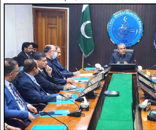
ISLAMABAD: Federal Minister for Interior, Mohsin Naqvi chairing a meeting at FIA headquarters.

He reciprocated the warm sentiments expressed by the Chinese leadership and lauded their contribution and commitment to the strengthening of the iron-clad friendship between Pakistan and China.