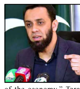
of the economy," Tarar maintained.

"Protecting the state of Pakistan and the national interest is our first responsibility. Strategies and steps are being taken for revival