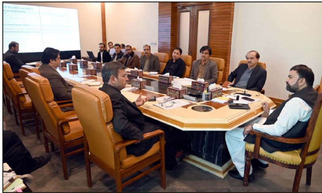
QUETTA: Chief Minister Balochistan Mir Safaraz Ahmed Bugti presiding over a meeting to review affairs of Health Department.

ISLAMABAD (APP): Deputy Speaker, National Assembly Ghulam Mustafa Shah on Wednesday while exercising his powers directed to initiate a probe into the allegations leveled by the Opposition Leader pertaining to the breach of privilege of the members of the House committed by the Islamabad Capital Territory Police. The Deputy Speaker while chairing the National Assembly initiated the proceedings by administering oath to the new members of the House including Dr Ramesh Kumar Vankwani of Pakistan Peoples Party Parliamentarians (PPPP) and Tankeen Akhtar Niazi of Pakistan Muslim League-Nawaz (PML-N). Fataha prayer was also offered for the 14 drowned sailors of fishing village Ibrahim Haideri in Karachi.