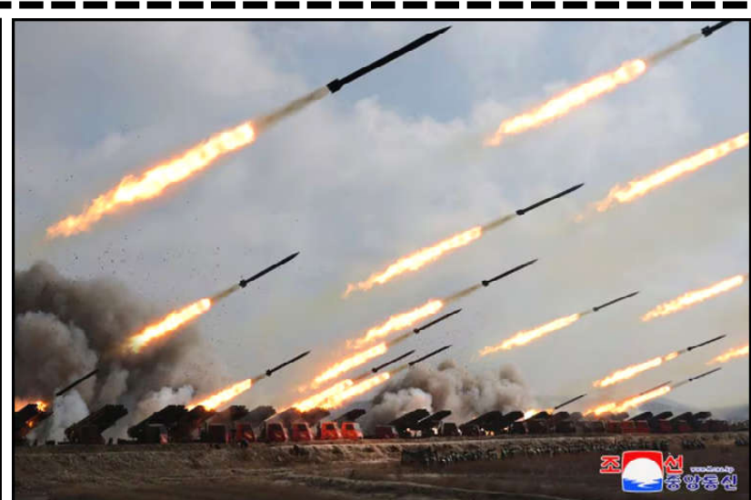
The Korean People's Army conducts an artillery firing drill, KCNA news agency reported, in North Korea in this picture released by the Korean Central News Agency.

number of troops joining compared to last year. Earlier this week, the North Korean state media said Kim inspected field training of troops at a major military operations base in the western region of the country. The drill involved units that are in firing range of "the enemy's capital," the state media said, referring to Seoul, the South Korean capital and added it "fulfilled important military missions for war deterrence." Thursday's artillery drill was aimed at increasing combat readiness posture and actual war capability, KCNA said. Earlier this week, the North Korean state media said Kim inspected field training of troops at a major military operations base in the western region of the country.