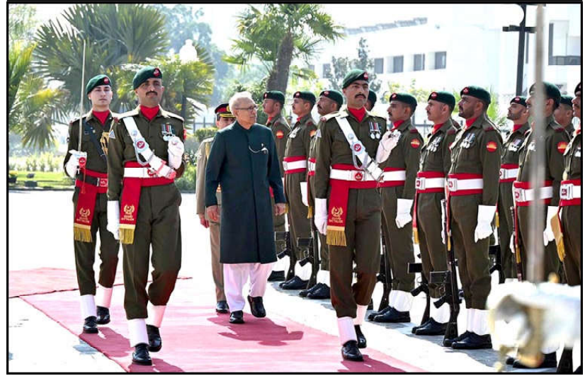
ISLAMABAD: President Dr. Arif Alvi being presented with the farewell Guard of Honour, at Aiwan-e-Sadr.

The joint resolution was presented on behalf of the Chief Minister Mir Sarfraz Ahmed Bugti,