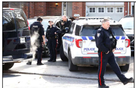
Ottawa Police Service officers surround a home after four children and two adults were found dead inside a neighbouring house in the Ottawa suburb of Barrhaven, Ontario, Canada.