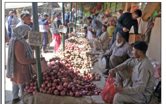
ISLAMABAD: People are busy buying vegetables in Friday Weekly Bazaar.

"SBP considers it imperative to support the career progression of the women employees and encourage them to aim for leadership position with the hope that in the coming years women in leadership position should become the norm, not the exception".