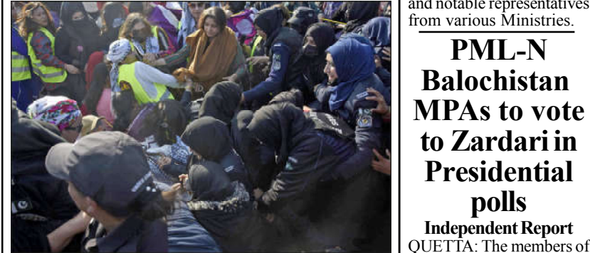
ISLAMABAD: Women activists scuffle with police personnel during Aurat March, a demonstration rally, to mark the International Women's Day, in the Federal Capital.