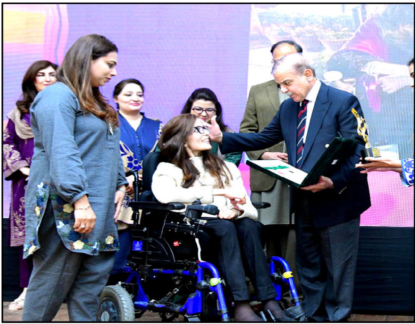
ISLAMABAD: Prime Minister Muhammad Shehbaz Sharif distributing Khatoo-e-Pakistan Awards among the high achievers women in their respective fields on the eve of International Women Day.