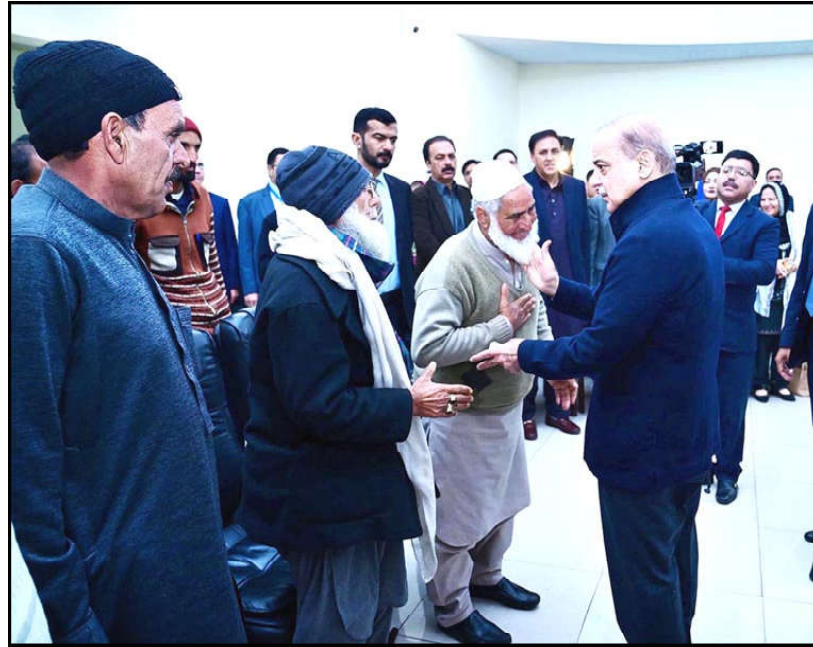
MUZAFFARABAD: Prime Minister Muhammad Shehbaz Sharif interacting with the families of the deceased and injured in the wake of recent torrential rains and heavy snowfall.

"As yet no one was elected on those reserved seats and without nominations and proper election on these seats, if the presidential election is conducted as per the schedule that would be denial of their votes, which otherwise is against the fundamental rights, law and constitution," stated the letter. "Under the above circumstances, it is submitted that the proposed election to the office of the President of Pakistan is clearly impossible, therefore the same may kindly be postponed or delayed till completion of electoral college accordingly in the best interest of justice, fair play and equity."