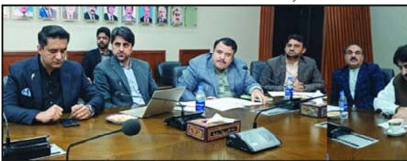
QUETTA: Balochistan Chief Secretary Shakeel Qadir Khan addressing Divisional Commissioners and Deputy Commissioners Conference.