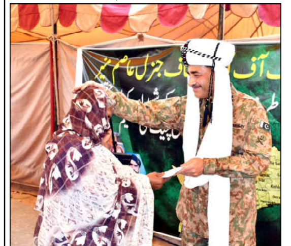
AWARAN: Chief of Army Staff (COAS) General Asim Munir giving a cheque to a relative of Shuhada during the visit at Awaran district

Earlier on arrival, COAS was received by Corps Commander Balochistan Corps.