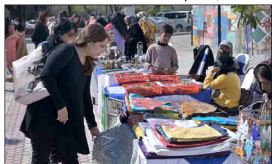
ISLAMABAD: Women visiting stalls at 10th National Women at Work commemorating International Women's Day organised by Lok Virsa with the collaboration of Devcom-Pakistan and dtn.

The seminar provided a platform for experts and stakeholders to explore the potential of Norwegian red cattle in enhancing genetic and domestic breed improvement in the dairy industry. PARC's institutions, the National Institute for Genomics and Advanced Biotechnology (NIGAB) and the Animal Sciences Institute (ASI).