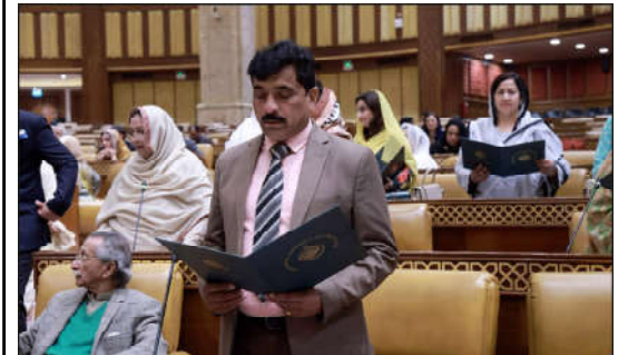
LAHORE: MPAs elected on minority special seats taking oath during Punjab Assembly Session.

She announced to evolve zero tolerance policy against harassment