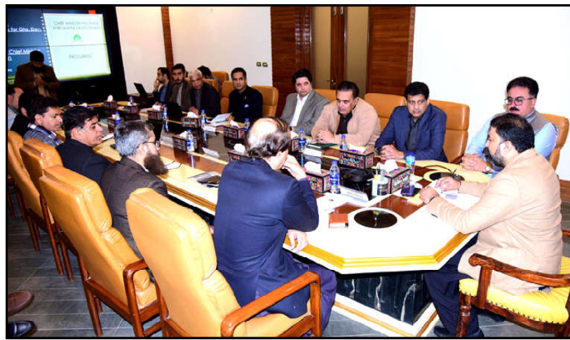
QUETTA: Chief Minister Balochistan Mir Sarfraz Ahmed Bugti presiding over a meeting regarding Quetta Development Package

The Pakistan Tehreek-e-Insaf (PTI), in the letter, asked the IMF to factor in the country's political stability in any further bailout talks.