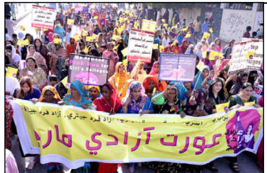
HYDERABAD: Large number of women participating in a rally in connection of International Women's Day at Thandi Sarak.