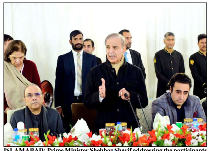
ISLAMABAD: Prime Minister Shehbaz Sharif addressing the participants of the dinner reception hosted by him

Ruling coalition endorses Zardari's nomination for presidency