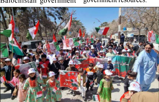
QUETTA: Students are holding demonstration in connection with the school admission campaign organized by the Pashtunkhwa Students Organization (PSO), at Quetta press club.

The Chief Minister asserted that no one would the use of vehicles of be allowed to misuse the government resources