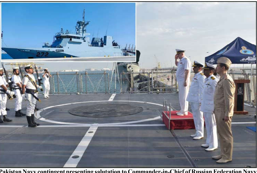
Pakistan Navy contingent presenting salutation to Commander-in-Chief of Russian Federation Navy onboard PNS TABUK during Doha International Maritime Defence Exhibition 2024. Pakistan Navy participates in