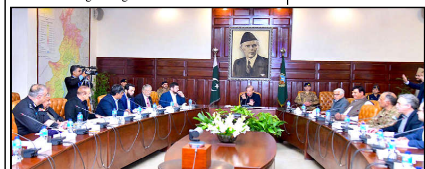
PESHAWAR: Prime Minister Muhammad Shehbaz Sharif chairs a meeting regarding recent torrential rains and heavy snowfall and the ongoing rescue and relief activities for the affected.

President Alvi also underscored the need of enhancing political, cultural and people to people contacts between Pakistan and Portugal, besides strengthening of exchanges at the political level.