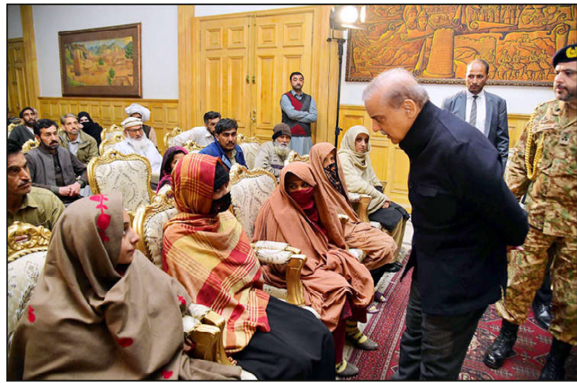
PESHAWAR: Prime Minister Muhammad Shehbaz Sharif interacting with the families of the deceased and injured in the wake of recent torrential rains and heavy snowfall.