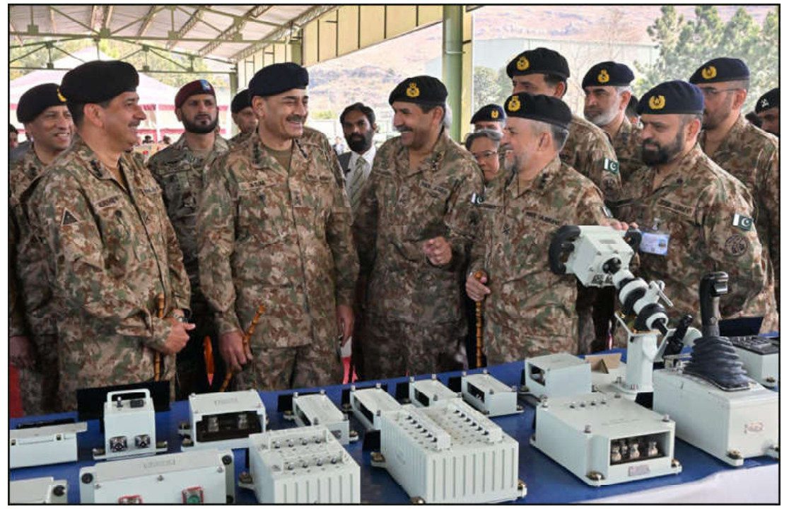
TAXILA: General Syed Asim Munir, NI (M), Chief of Army Staff (COAS), visited Heavy Industries Taxila (HIT) as chief guest at the rollout ceremony of HAIDER tank (Pilot Project).

itarian law in the OPT, including in East Jerusalem," he said. "We also call for reversal of all measures aimed at institutionalizing illegal occupation, apartheid and colonial settlement enterprise in OPT." The OIC also called on the Council to work towards securing justice and accountability for the Rohingya people, including through their safe, dignified, and voluntary return to their homes in Myanmar. The OIC, he said, reiterated its full solidarity with Bangladesh and supports calls for assistance to the country in efforts to achieve a durable solution.