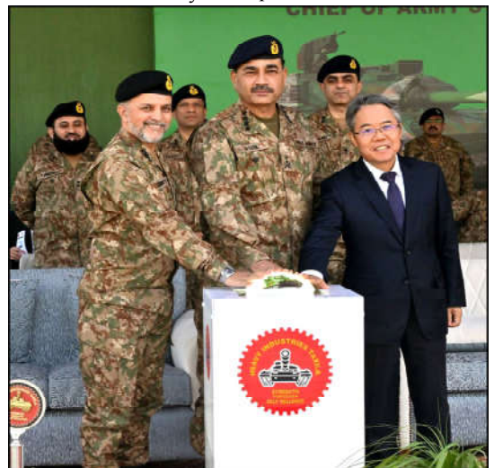
TAXILA: General Syed Asim Munir, NI (M), Chief of Army Staff (COAS), visited Heavy Industries Taxila (HIT) as chief guest at the rollout ceremony of HAIDER tank (Pilot Project).

Moreover, it is also necessary to make effective implementation on the accountability of all the concerned and making them answerable, he maintained.