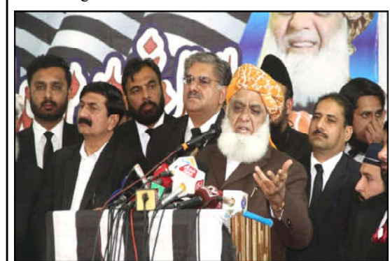
LAHORE: Amir JUI Maulana Fazlur Rehman addressing a ceremony with lawyers.

In a tweet from his official handle in May last year, the ex-PM said his party has "ample amount of evidence" to prove that agencies' men carried out arson and shootings during the protests to blame it on PTI. But he told journalists today: "Neither we are anti-army nor want a clash with forces."