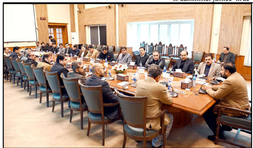
QUETTA: Chief Minister Balochistan Mir Safaraz Ahmed Bugti expressing his views during introductory meeting of Provincial Secretaries of departments

Shehbaz Sharif announced that Rs 700,000 would be provided for repair of each destroyed house and Rs 300,000 for each partially damaged house.