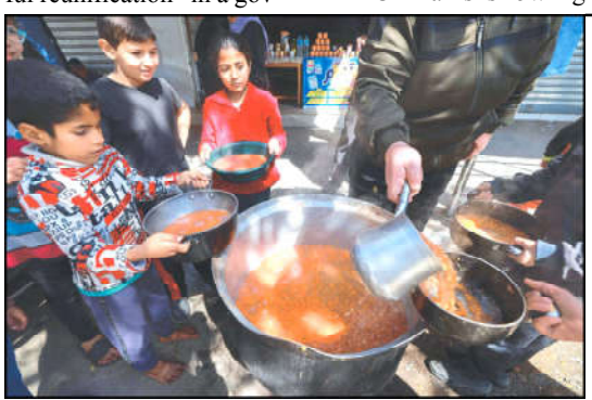
RAFAH: Palestinian children receive cooked food rations as part of a volunteer youth initiative in the southern Gaza Strip.

LONDON (Online): Children in the besieged Palestinian enclave of Gaza may not be able to survive a famine there, the head of the World Health Organization (WHO) said on Wednesday. "Children who survived bombardment but may not survive a famine," Tedros Adhanom Ghebreyesus wrote on X. He called for allowing more humanitarian aid into the Gaza Strip as well as a ceasefire there. Israel has waged a deadly military offensive on the Gaza Strip since an Oct. 7, 2023 attack by the Palestinian group Hamas, which Tel Aviv says killed nearly 1,200 people. More than 30,700 Palestinians have since been killed and 72,156 others injured amid mass destruction and shortages of necessities. Israel has also imposed a crippling blockade on the Gaza Strip, leaving its population, particularly residents of northern Gaza, on the verge of starvation. The Israeli war has pushed 85% of Gaza's population into internal displacement amid acute shortages of food, clean water, and medicine, while 60% of the enclave's infrastructure has been damaged or destroyed, according to the UN. Israel stands accused of genocide at the International Court of Justice. An interim ruling in January ordered Tel Aviv to stop genocidal acts and take measures to guarantee that humanitarian assistance is provided to civilians in Gaza.