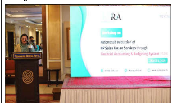
Accounting and Budgeting System (FABS) for the officials of Accountant General of Pakistan on Wednesday at Serena Hotel Peshawar.

Additionally, a thorough question-and-answer session was conducted during the presentation, where trainers and officials of KPRA addressed the queries of the participants