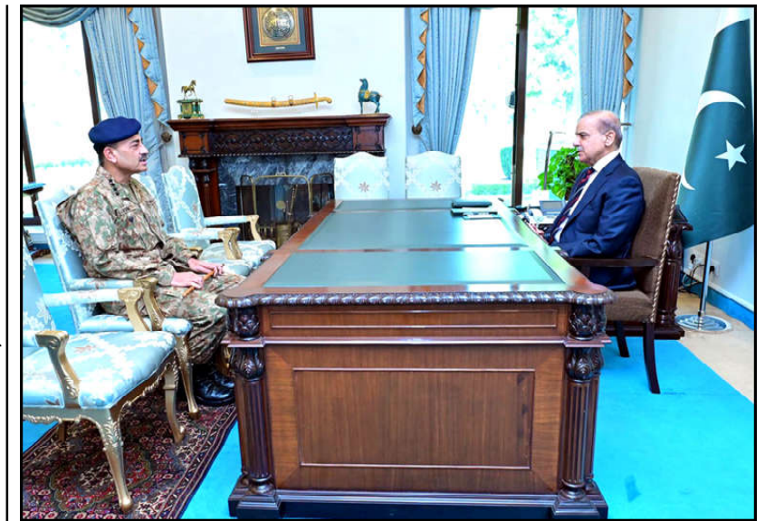
ISLAMABAD: Chief of Army Staff General Syed Asim Munir NI (M) calls on Prime Minister Muhammad Shehbaz Sharif.

"The unanimous opinion of the Supreme Court in the Bhutto reference will help understand the history at the national level through the right perspective.