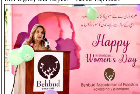
RAWALPINDI: First Lady Begum Samina Alvi addressing an event in connection with International Women's Day, at Behbud Association of Pakistan.

RAWALPINDI (APP): First Lady Begum Samina Alvi, On Wednesday while emphasizing the importance of women's role in the country's development, said that a progressive and inclusive society could not be possible without empowering women in every sector of life. Addressing an event organized in connection with International Women Day by the Behbud Association of Pakistan, Samina Alvi said it was the responsibility of everybody to ensure a conducive environment for girls and women to provide proper education and training, enabling them to live a life with dignity and respect. Appreciating the role of the association in empowering women, she said that since its inception, the Behbud Association has empowered around one million women by providing skills and training in various fields. She said women comprised half of the total population of the country, and their participation was very important to ensuring the economic development of the country. The first lady pointed out that the women's literacy rate in the country was much lower as compared to the men. She said Pakistan also needed to improve its current rating of 142 out of 147 countries in the Global Gender Gap Index.