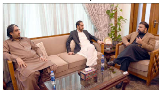
QUETTA: Leader of Pakistan Peoples Party, ex-Chief Minister Balochistan Abdul Quddus Bizenjo and Mir Abdul Wahab Bizenjo meeting with Chief Minister Balochistan Mir Sarfraz Ahmed Bugti.