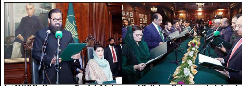
LAHORE: Governor Punjab Muhammad Balighur Rehman administering oath to 18-member new Provincial Cabinet. Chief Minister Maryam Nawaz is also present.

QUETTA: The Chief Minister Balochistan, Mir Sarfraz Ahmed Bugti has directed all administrative secretaries of provincial government departments here on Wednesday. Addressing the secretaries, Chief Minister said that we have to work for betterment of the province and its common men. He on the occasion pledged that we would take measures for prevention of corruption from the lower to higher level. He directed the secretaries to prepare comprehensive recommendations for increasing the resources of province. In addition to this, viable strategy should be prepared remaining in the province's own resources, he directed further. He asserted that we would give protection to the due tenure of appointment on any of the position. Moreover, the process of answerability would be made effective by making the anti-corruption department effective, he vowed.