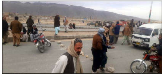
QUETTA: Residents of Sariab protesting against shortage of gas by blocking the Sariab Road.