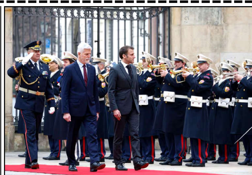
Czech Republic's President Petr Pavel and French President Emmanuel Macron walk past an honour guard at Prague Castle in Prague, Czech Republic.

Monitoring Desk WASHINGTON: The United States is working to get aid into Gaza through as many channels as possible to remedy the humanitarian disaster amid Israel's war with Hamas militants, State Department spokesperson Matthew Miller said on Monday (March 4), describing the situation as "simply intolerable." Washington was optimistic that a new maritime route to deliver aid to Gaza could supplement current efforts to get aid into the enclave, Miller said, adding that that route was "still in the development phase." In addition to trucks carrying aid through two border crossings in the south of Gaza, the US military, along with allied nations, has in recent days dropped aid packages into Gaza from aircraft, amid warnings much of the population is on the verge of famine.