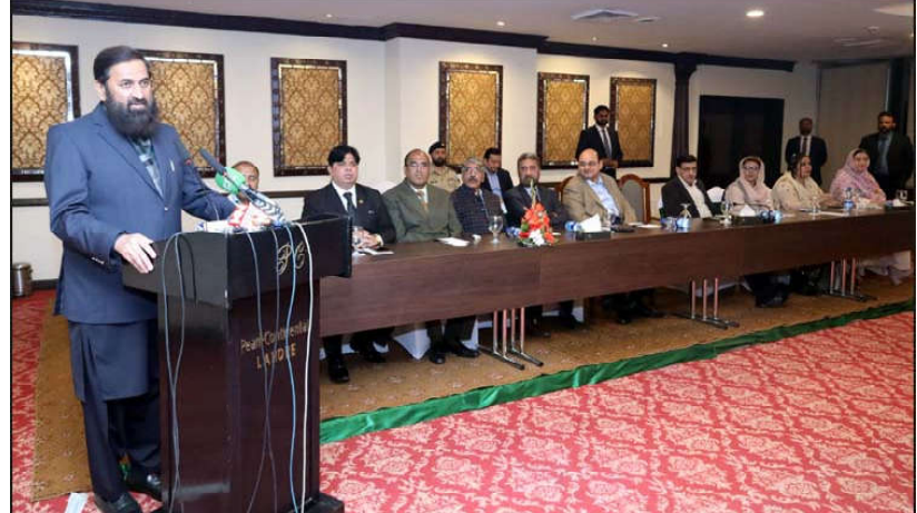
LAHORE: Governor Punjab Muhammad Balighur Rahman addressing a seminar on education and literature held at a local hotel.