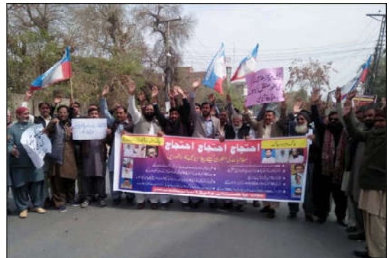
MULTAN: Members of Pakistan Wapda Employees Pegham Union are holding protest demonstration for acceptance of their demands, at Multan press club.