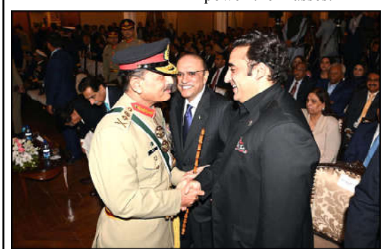
ISLAMABAD: Chief of Army Staff Syed Asim Munir shake hand with Chairman Pakistan People's Party Bilawal Bhutto Zardari during the oath taking ceremony of Prime Minister Mian Muhaamad Shahbaz Sharif at President House in the Federal Capital.

Bilawal Bhutto congratulated the newly elected Chief Ministers of all four provinces and emphasized the need for them to play their role in saving Pakistan's "democracy and economy." He said that people did not vote for anyone to create a ruckus but to save them from this economic crisis. Bilawal Bhutto stressed the need for discourse among all the lawmakers. He said the Parliament was the mother of all institutions, and if this institution was strengthened, it would ultimately empower the masses.