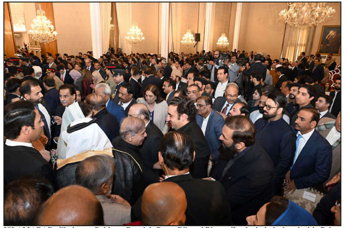
ISLAMABAD: Chairman Pakistan People's Party Bilawal Bhutto Zardari, shake hand with, Prime Minister Mian Muhaamad Shabbaz Sharif after the oath taking ceremony, at President House in the Federal Capital.