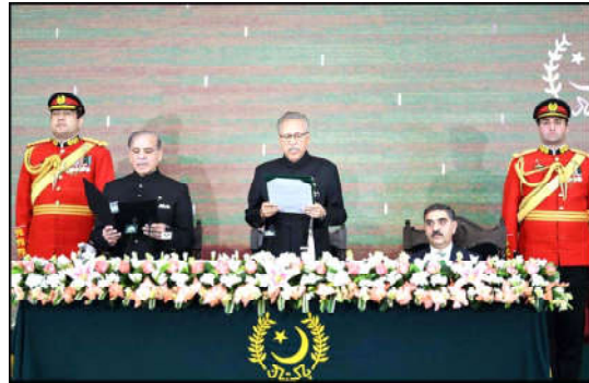
ISLAMABAD: Prime Minister Muhammad Shehbaz Sharif taking the oath of office.

Held at the Aiwan-e-Sadr, the swearing-in ceremony was attended by outgoing Caretaker Prime Minister Anwaar-ul-Haq Kakar and his cabinet members, parliamentarians, Chairman of Joint Chiefs of Staff Committee, services chiefs, governors, chief ministers and diplomats.