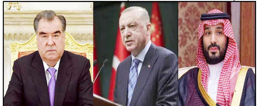
ISLAMABAD (APP): Different world leaders felicitated the newly elected Prime Minister Muhammad Shehbaz Sharif on assuming the office of the country's chief executive and wished progress and prosperity.

Gaza and reaffirmed their commitment for a just, comprehensive and lasting solution to the Palestinian question anchored in international law and in line with the relevant resolutions of the United Nations and Organisation of Islamic Cooperation. President of Tajikistan Emomali Rahmon on Monday congratulated newly-elected Prime Minister Shehbaz Sharif, emphasising that through joint efforts, both the countries would enhance and expand long-term bilateral partnership. "I wish you, dear friend and brother, good health and great new successes in the implementation of your plans for the sustainable social and economic development of Pakistan.