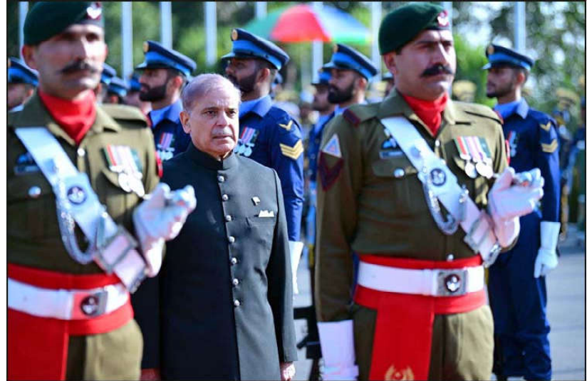
ISLAMABAD: Prime Minister Muhammad Shehbaz Sharif inspecting the Guard of Honor presented by a contingent of Pakistan's Armed Forces upon arrival at the Prime Minister House.