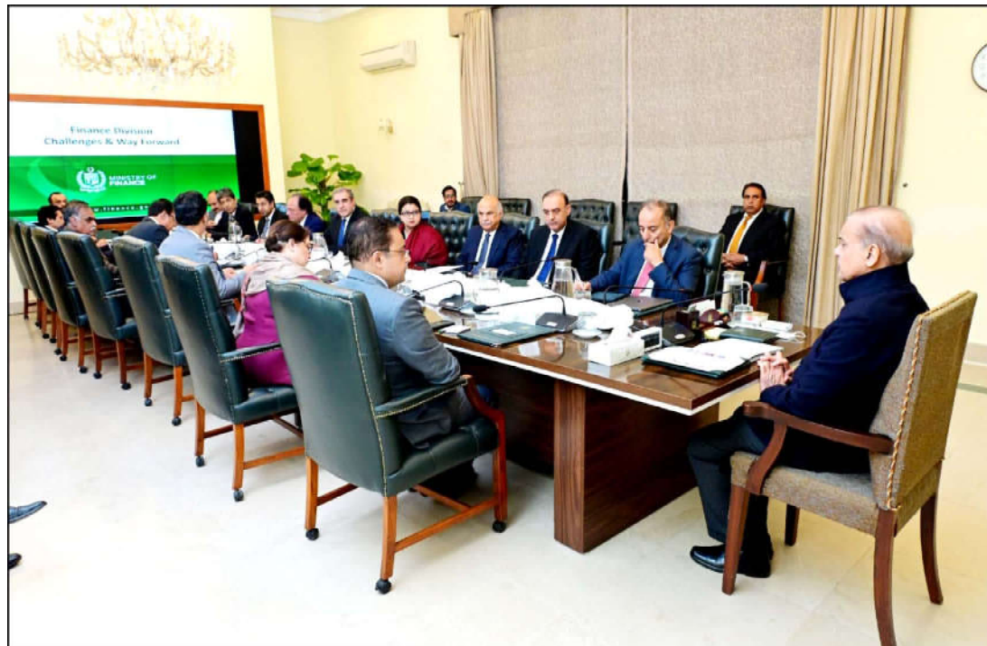
ISLAMABAD: Prime Minister Muhammad Shahbaz Sharif chairing a meeting on the matters related to economy

reached its decision with a 4-1 ratio, with member Punjab Babar Hasan Bharwana, submitting dissent in a note. The SIC submitted a plea in ECP claiming the allocation of seats based on inclusion of PTI-endorsed candidates within their party. This plea, conveyed by SIC Chairman Sahibzada Hamid Raza through a PTI representative, was submitted to the electoral watchdog. Following the Supreme Court's ruling declaring their intra-party polls "unconstitutional" and stripping them of the electoral symbol of the 'bat', PTI candidates participated in the elections as independents.