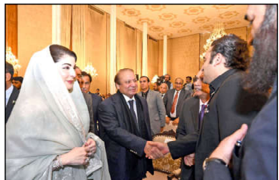
ISLAMABAD: Leader of Pakistan Muslim League (N) Mian Muhammad Nawaz Sharif shake hand with Chairman Pakistan People's Party Bilawal Bhutto Zardari after the oath taking ceremony of Prime Minister Mian Muhaamad Shahbaz Sharif at President House in the Federal Capital, Chief Minister of Punjab Maryam Nawaz Sharif also seen in the picture.

The IMF estimated that rationalizing GST rates could generate 1.3 percent of Gross Domestic Product (GDP) revenue, which equates to Rs1,300 billion in national exchequer. Overall, the IMF has called for the removal of all distortions tax policy changes related to compliance, including the abolition of minimum taxes and additional taxes, as well as the abolition of the Ninth and Tenth Schedules. Last month it emerged that Pakistan would seek a loan package from the International Monetary Fund plus 1.5 billion dollars in climate finance. The country is exploring the possibility of increasing the program to $7.5-8 billion, reportedly seeking the addition of climate finance in the next bailout package, sources said.