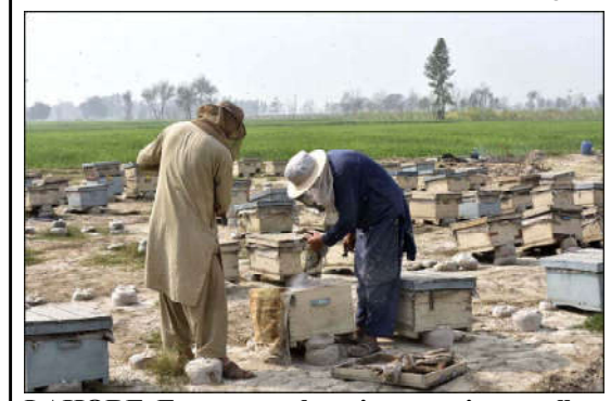
LAHORE: Farmers are busy in preparing to collect honey from boxes placed roadside fields in the Provincial Capital.

The campaign, he said had started from Dera Ghazi Khan in this regard.