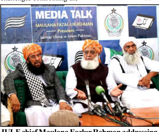
JUI-F chief Maulana Fazlur Rehman addressing a press conference in Karachi.