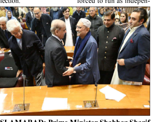
ISLAMABAD: Prime Minister Shahbaz Sharif hand shakes with PPP Leader Asif Ali Zardari after electing prime minister.

PTI candidates were forced to run as indepen-