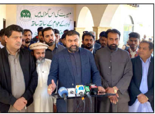
GWADAR: Chief Minister Balochistan Mir Sarfaraz Ahmed Bugti talking with mediamen

He said that the government of Balochistan are standing with its people in critical time. He said that our first priority is to rescue the affected people, then provide them and their rehabilitation. The Chief Minister mentioned that work is continued to drain out the rain water and restore routine life in the port city. He said that the dewatering process would be completed in Gwadar by Monday (today). He was highly appreciative of the role played by the Pak army, Provincial Disaster Management Authority, and other institutions for rescuing the affected people and providing them the re-