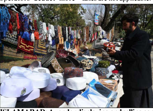
ISLAMABAD: Avendor displaying and selling caps to attract the customers at his roadside setup.

The Chairman PEW said that there were some underdeveloped areas in