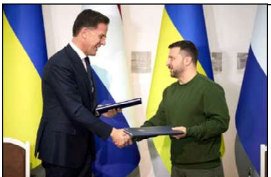
Ukraine's President Volodymyr Zelenskyy and Dutch Prime Minister Mark Rutte attend a ceremony of signing an agreement on security cooperation and long-term support between Ukraine and Netherlands, amid Russia's attack on Ukraine, in Kharkiv, Ukraine.