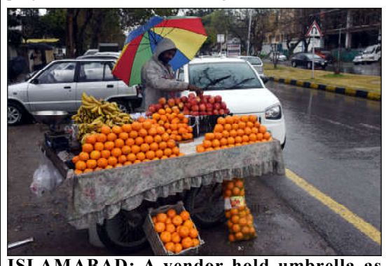
ISLAMABAD: A vendor hold umbrella as displaying fruits on his pushcart attraction for customers at a road during rain.

ISLAMABAD (APP): The Government of Pakistan has welcomed the recent announcement by the World Bank that, among other initiatives in support of the people of Afghanistan related to its "Approach 3.0", the Central Asia-South Asia Electricity Transmission and Trade Project ("CASA-1000") in Afghanistan will be resumed. The request was made in December by all three neighboring countries participating in the project. "This announcement marks a significant step forward in the region's commitment to energy collaboration," said a news release issued here on Friday. As a result, the Government of Pakistan is pleased to announce it has joined the other neighboring countries — the Kyrgyz Republic and the Republic of Tajikistan — in signing a Joint Declaration to thank the World Bank for its timely response in approving the "ring-fenced" resumption of construction in Afghanistan.