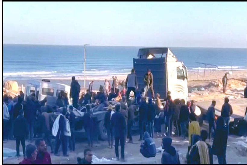
Palestinians transport casualties following Israeli fire on people waiting for aid in Gaza City.

metres apart, in the first of which dozens were killed or injured as they tried to take aid from the trucks and were trampled or run over. He said there was a second, subsequent incident as the trucks moved off. Some people in the crowd approached troops who felt under threat and opened fire, killing an unknown number in a "limited response", he said. He dismissed the casualty toll given by Gaza authorities but gave no figure himself. In a later briefing, Israel Defense Forces spokesman Rear Admiral Daniel Hagari also said dozens had been trampled to death or injured in a fight to take supplies off the trucks.