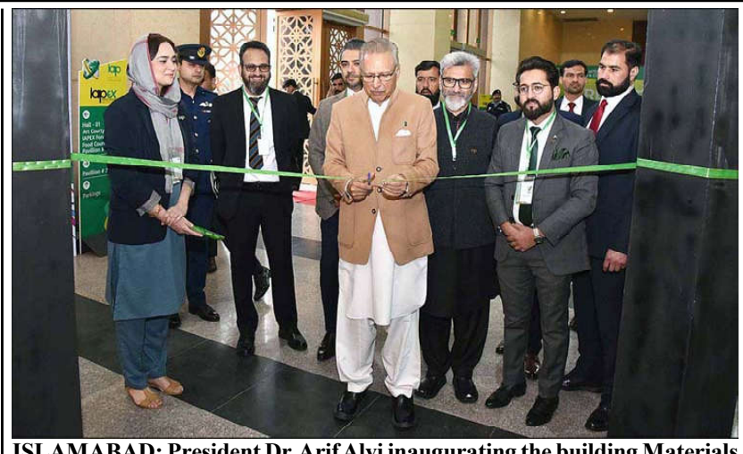
ISLAMABAD: President Dr. Arif Alvi inaugurating the building Materials Exhibition and Conference organized by the Institute of Architects Pakistan at Aiwan-e-Sadr.

The three top trading companies were Kohinoor Spinning with 71,357,500 shares at Rs.5.36 per share, K-Electric 194,237,56 shares with 4.87 per share and Treet Crop 17,473,574 shares at Rs 18.02 per share. Rafhan Maize Products witnessed a maximum increase of Rs 450.00 per share price, closing at Rs 8,850, whereas the runner-up was Mari Petroleum Company Limited with a Rs113.50 rise in its per share price to Rs2,462.05.