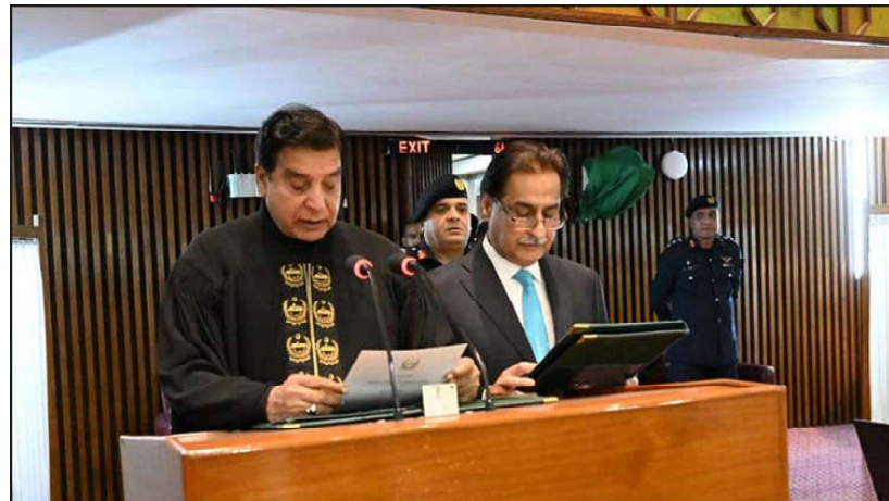
ISLAMABAD: Raja Pervez Ashraf administered the oath from Sardar Ayaz Sadiq as Speaker National Assembly.