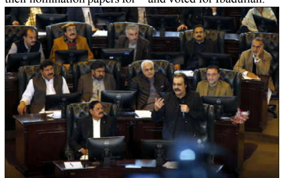
PESHAWAR: Ali Amin Gandapur speaks on the assembly floor after being elected as Chief Minister of Khyber Pakhtunkhwa, at KPK Assembly in Peshawar.