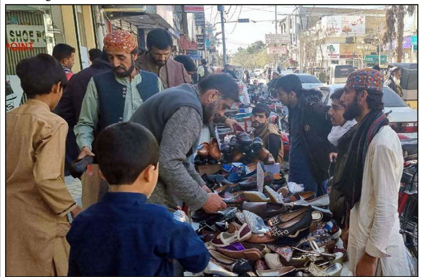
QUETTA: People are busy in Eid shopping ahead of Eid-ul-Fitar during the Holy Month of Ramadan-ul-Mubarak, in Quetta.

Irfan Siddique said, "Zulfikar Ali Bhutto, Asif Ali Zardari, Benazir Bhutto, Nawaz Sharif, Shehbaz Sharif, Maryam Nawaz, Yusuf Raza Gilani and other dozens of prominent political leaders have been in jails but there is no example of such a written agreement with any of them despite the fact that no one was convicted in such cases of serious nature as Imran Khan".