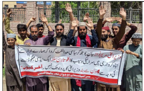
MULTAN: Members of Saraikistan Nowjawan Tehreek are holding protest demonstration against closure of Burn Unit since four days.