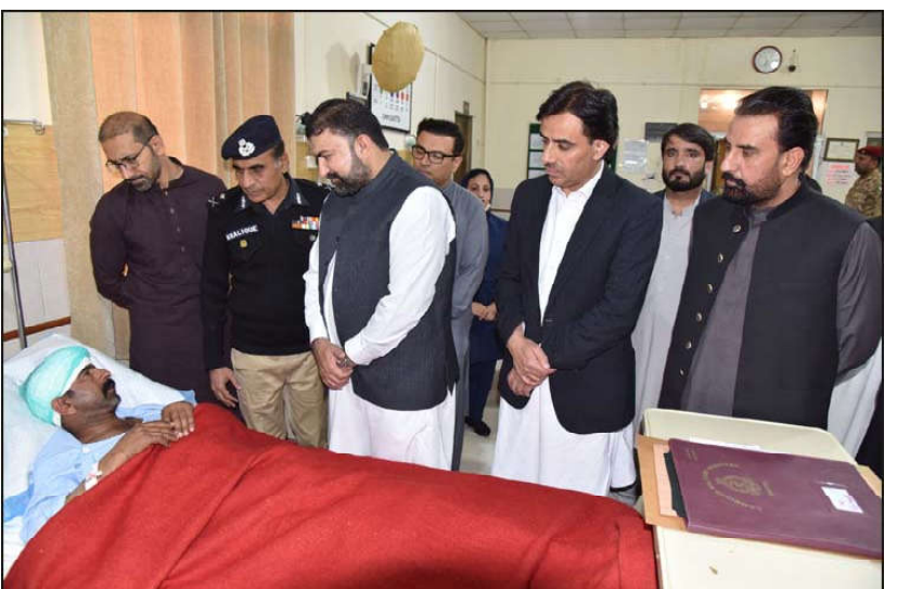
QUETTA: Balochistan Chief Minister Mir Sarfraz Ahmed Bugti enquiring about the health of Harnai blast victims.

Independent Report QUETTA: The Governor Balochistan, Malik Abdul Wali Khan Kakar has exhorted the philanthropists of the province to give their zakat and Sadqat to the poor orphans, widows, patients and those students who can't afford to pay their fees. In a statement issued here on Sunday, the Governor said that the Allah's appealment is in meeting the needs of people and in their service. Addressing to the philanthropists, the Governor said that they should provide financial assistance to the deserving relatives and neighbors not to those who are unknown to them or those unregistered institutions as this trend can be disastrous for us. While giving donations to the people, one should be careful as the