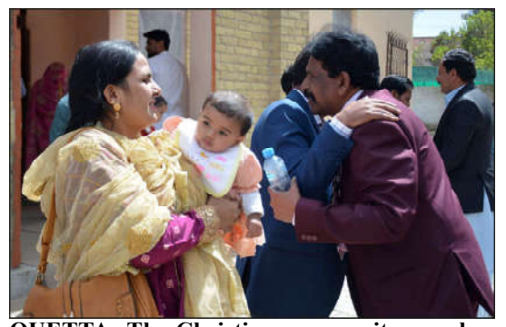
QUETTA: The Christian community member celebrated Easter with religious zest.

ISLAMABAD (INP): Just like other parts of the world, millions of Muslims in Pakistan also entered a state of seclusion known as "Itikaaf", following the Asr prayer on Sunday. During the final ten days of the holy month of Ramadan, people observe Itikaaf, a time to pray in private for the blessings of Allah Almighty and in accordance with the teachings of the Prophet Muhammad (Peace Be Upon Him).