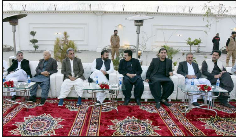
QUETTA: Balochistan Chief Minister Mir Sarfraz Ahmed Bugti, MPAs and others participating in the Iftaar Dinner hosted by former Chairman Senate and MPAMir Muhammad Sadiq Sanjrani.