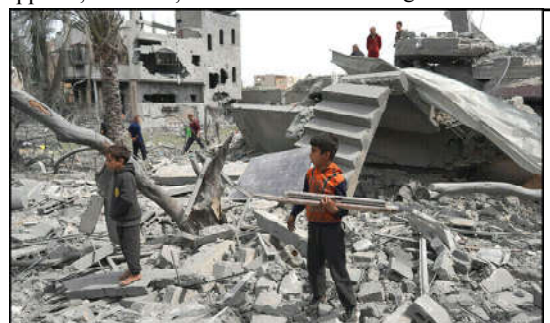
Palestinians inspect the damage to a building, following Israeli bombardment, in the Maghazi camp for Palestinian refugees in the central Gaza Strip.

Ukrainian energy company Centrengo announced Saturday that the Zmiiv Thermal Power Plant, one of the largest in the northeastern Kharkiv region, was completely destroyed following Russian shelling last week. Power outage schedules were still in place for around 120,000 people in the region, where 700,000 had lost electricity after the plant was hit on March 22.