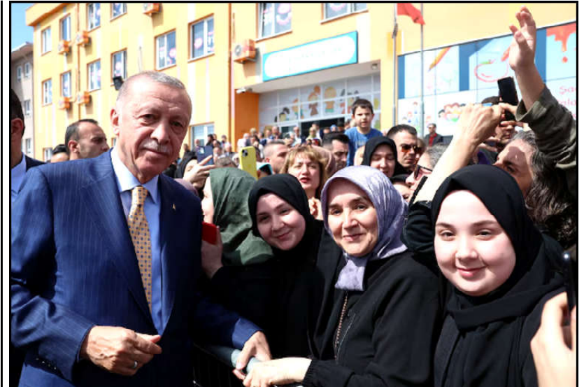
Turkish President Tayyip Erdogan poses with his supporters as he leaves a polling station during the local elections in Istanbul, Turkey.

Marcos increased the number of agencies supporting the council to 13 from nine, including the space agency and the University of the Philippines' Institute for Maritime Affairs and the Law of the Sea.