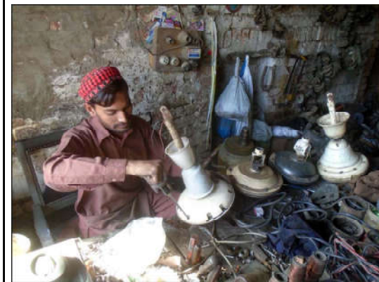
FAISALABAD: Workers cutting iron boilers on Maqbool Road, in the city.

Bilal Yasin said that providing all possible relief to the people was the first priority of the government.