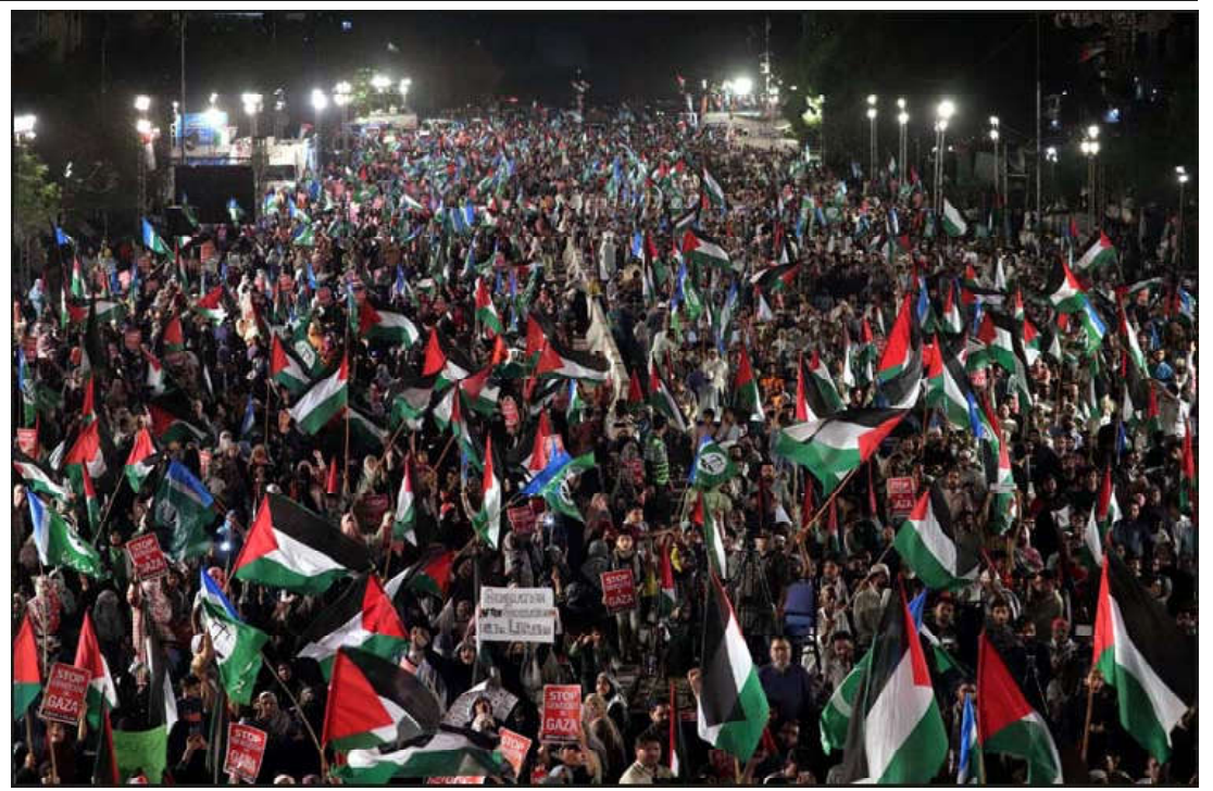
KARACHI: A large number of supporters of Jamat-e-Islami (JI) are gathered to attend rally against Israeli cruel and inhumane acts and express unity with the innocent people of Palestine, at Shahrah-e-Quaideen in Karachi.

"While we celebrate diversity of faiths as a source of strength and enrichment in our nation, let us join hands towards building a society that is tolerant and cohesive and together defeat the forces of discord that are trying to cause harm to the fabric of our society," PM Office Media Wing, in a press release, quoted the prime minister as saying.