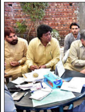
SIALKOT: Federal Defense Minister Khawaja Muhammad Asif is listening to the public's problems at his residence.

He, speaking to the press, lauded SIFC as a visionary initiative spearheaded by Chief of Army Staff General Syed Asim Munir. He emphasized that this landmark initiative has garnered trust not only from fraternal Islamic Arab nations but also from both local and foreign investors.