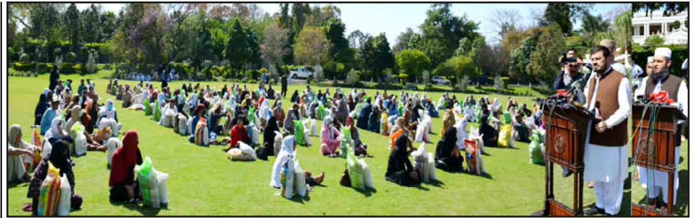
PESHAWAR: Governor Khyber Pakhtunkhwa Haji Ghulam Ali and Mayor Peshawar Haji Zubair Ali addressing the ration distributing ceremony amongst the Eunuchs.

female chief minister of any province in the nation's history to her teachers also. She highlighted the importance of discipline and cleanliness instilled in her by the school, stating that it played a pivotal role in her life after her parents. She shared that her father, Nawaz Sharif, had always emphasized the importance of minority rights. She expressed appreciation for the first Sikh minister and congratulated him on his appointment.