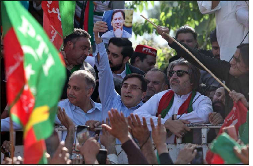
PESHAWAR: Activists of Tehreek-e-Insaf (PTI) are holding protest demonstration for release of Imran Khan, Former Prime Minister, at Peshawar press club.

NEW DELHI (INP): Finally, the Indian Air Force (IAF) proved the stance of Pakistan correct by admitting its incapability in missile technology, especially in the Brahmos Missile case. The IAF has filed its report in the Delhi High Court that combat connectors of the Brahmos missile "remained connected to the junction box" which landed in Pakistan in March 2022. The Economic Times said in its report that the IAF revealed its incapability in missile technology in a reply filed in the Delhi High Court. Revealed in a report filed in the Delhi High Court, the IAF detailed findings from a Court of Inquiry, attributing the incident to a failure in ensuring the disconnection of combat connectors before a road convoy's movement.