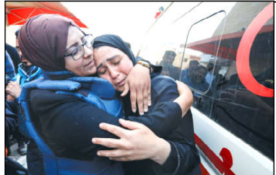
A member of the press consoles a woman outside Al-Aqsa hospital in Deir el-Balah.

Monitoring Desk WASHINGTON: The Biden administration has established a mid-March deadline for Israel to sign a letter committing to adhere to international law when using American weapons. Furnished by Washington, the letter also mandates Israel to facilitate humanitarian aid into Gaza, where over half a million Palestinians are on the brink of famine. Axios, a US news outlet, which has a copy of the letter, reports that on Tuesday, US officials in both Washington and Tel Aviv formally briefed their Israeli counterparts on this new policy. They provided them with a draft letter, essential for Israel to sign. According to a senior Israeli official, the US has requested written assurances by mid-March. This timeline aligns with Secretary of State Blinken's goal to certify them by month-end. Israel has the flexibility to designate the government representative signing the letter. Similar letters have also been presented to several other nations utilising US weaponry, as disclosed by a US official to Axios.