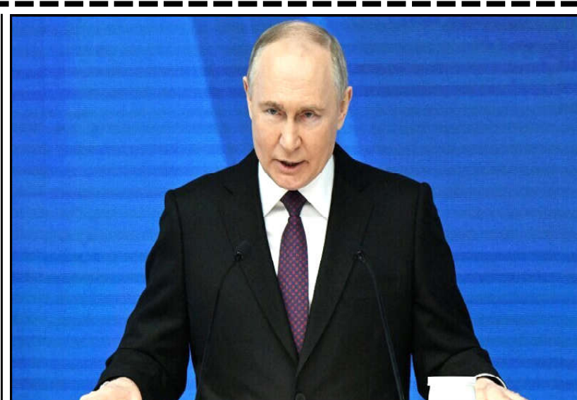
Russian President Vladimir Putin delivers his annual address to the Federal Assembly, in Moscow, Russia.