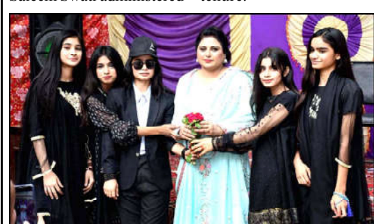
LARKANA: Student presents a bouquet to her teacher during a function at Govt little folks Girls High School Jinnah Bagh.