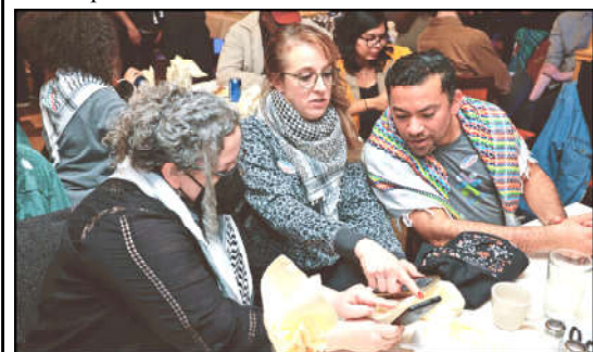
People look at election results at a monitoring centre set up in Dearborn by the Listen to Michigan watch party, a group which asked voters to vote 'uncommitted' instead of voting for President Joe Biden.

Monitoring Desk DEARBORN: Joe Biden's campaign and top Democratic officials vowed to double down on efforts to win back former supporters after being hit by a much stronger-than-anticipated protest vote in the Michigan primary over the president's support of Israel. About 13.2 per cent of Michigan Democrats cast a ballot for "uncommitted" in the nominating contest, following a weeks-long push by activists, an Edison Research tally showed after 9am on Wednesday. With about 85pc of all votes counted, the uncommitted vote was already over 101,000 votes, far higher than expected. Turnout for the Democratic primary was also high, at some 900,000 voters overall. About 81pc of those votes backed Biden. As the results were being tallied, a senior Biden campaign official said the team will continue to "make our case in the state — to both uncommitted voters and the entire Michigan constituency. The president will continue to work for peace in the Middle East." Biden's staunch support for Israel during its five-month war with Hamas, which has decimated Gaza, has sparked outrage and a well-organised backlash among progressive Democrats and Arab Americans, with Michigan as their epicentre.