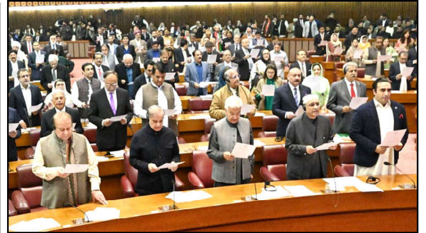
ISLAMABAD: The newly elected members of the National Assembly taking oath of their office during the inaugural session of the 16th National Assembly at the Parliament House.

Shehbaz further insisted that there should be no doubt now that PTI Founder Imran Khan wants the destruction of the country. He regretted and condemned the letter written to the IMF. "No Pakistani, despite political differences, will resort to anti-national activities," he asserted.