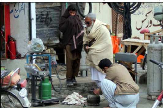
QUETTA: A man filling Liquefied Petroleum Gas (LPG) into cylinder at his shop in Quetta.