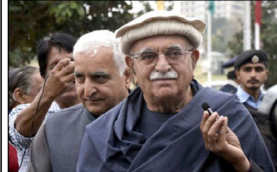
ISLAMABAD: Leader of Pashtunkhwa Milli Awami Party, Mahmood Khan Achakzai, arriving before the start of the inaugural session of the National Assembly, at the parliament house building in the Federal Capital.

Mir Sarfraz Bugti expressed the hope that new speaker would run the assembly with total impartiality. He also pleaded to run the House as a Jirga as per the province's traditions.