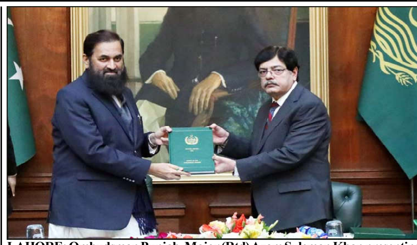
LAHORE: Ombudsman Punjab, Major (Rtd) Azam Suleman Khan presenting annual performance report of the Office to Governor Punjab Muhammad Balighur Rehman during a ceremony.

initiatives like complete digitalization of the Ombudsman Punjab office. He said that extending the offices of the Punjab Ombudsman to various districts and providing maximum relief to the people was commendable. Governor Punjab said that the decisions of the provincial ombudsman are written in Urdu which is easy for people to understand and they do not need to hire any lawyer for it. Governor Punjab further said,