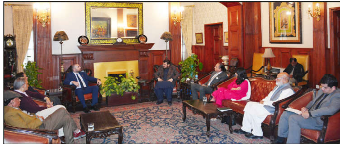
PESHAWAR: A delegation of Association of Small Medium Enterprises (BVMW) Germany meeting with Khyber Pakhtunkhwa Governor Haji Ghulam Ali.

He said that the surplus products of POF were sold in the civil market and the standards of POF products were not less than any international company.