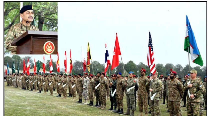
Chief of the Army Staff, General Syed Asim Munir addressing the closing ceremony of the Seventh Pakistan Army Team Spirit Exercise-2024 at Kharian.

Moreover, PPP's Bilawal Bhutto-Zardari, Hina Rabbani Khar and sister Aseefa Bhutto, Naz Baloch, Sunni Ittehad Council's Ali Muhammad Khan, Zain Qureshi and Shehryar Afridi also reached the assembly, as well as PML-N's Tariq Fazal Chaudhry and Hanif Abbasi. JUI-F chief Maulana Fazlur Rehman and MQM leader Khalid Maqbool Siddiqui and Farooq Sattar are also in attendance.