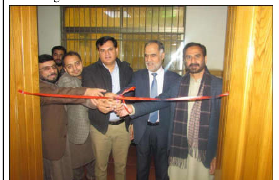
Training of Division and District Coordinators from Balochistan appointed for 7th Agricultural Census on 'Supervisor and Enumerators Management System' held on Thursday.

ISLAMABAD (INP): The Election Commission of Pakistan (ECP) has appointed five Presiding officers to conduct election to the office of President of Pakistan, in Islamabad and four provincial capitals. According to Spokesperson of the ECP, these officers will receive nomination papers from candidates and chair meetings of the Parliament at the Parliament House, Islamabad, and the Provincial Assembly of the respective province during the scheduled polling for the Presidential Election. According to the notification, the Chief Justice of the Islamabad High Court will oversee the elections in the Senate and National Assembly in Islamabad. A Member of the Election Commission of Pakistan, Election Commissioner-1, will supervise polling in the Provincial Assembly of Punjab. The Chief Justice of the Sindh High Court will supervise the Presidential Elections in the Provincial Assembly of Sindh. Similarly, the Chief Justice of the Peshawar High Court will supervise the polls in the Provincial Assembly of Khyber Pakhtunkhwa.