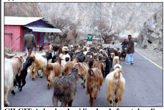
GILGIT: A shepherd guiding herd of goats heading towards grazing field near Nomal area.

The SUGS Project is a critical initiative designed to establish storage facilities for surplus gas, particularly during off-peak seasons when demand is low relative to supply in the Pakistani market. Through the SUGS Project, OGDCL and ISGS aim to mitigate these challenges by creating storage capacity and facilitating gas-swapping arrangements with other stakeholders in the industry on commercial basis.